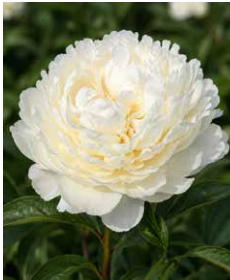
Perfect Princess (2014) Mid.