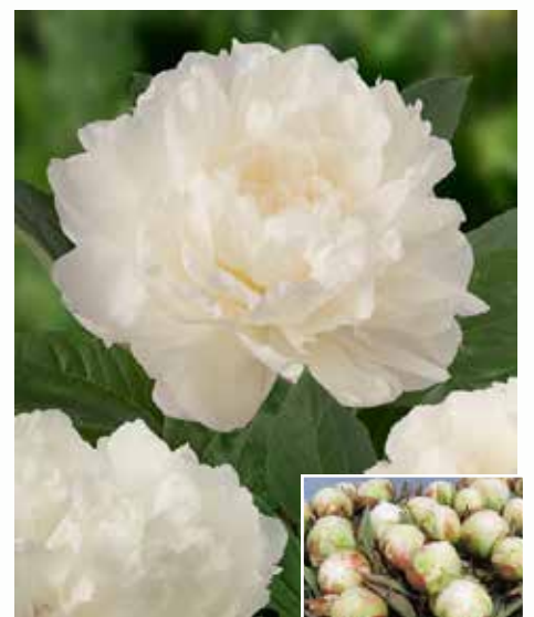
Fringed Ivory (1989) Mid.