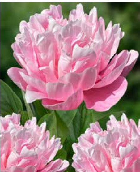
Pink Parfait (1975)