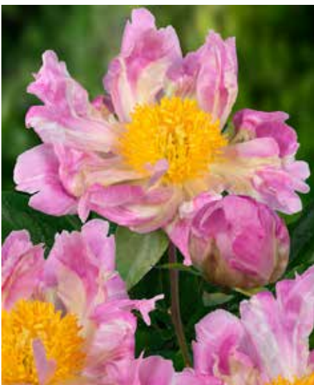
Pink Spritzer (1999)