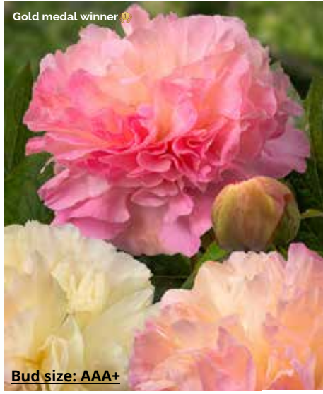
Lois' Choice (1993)