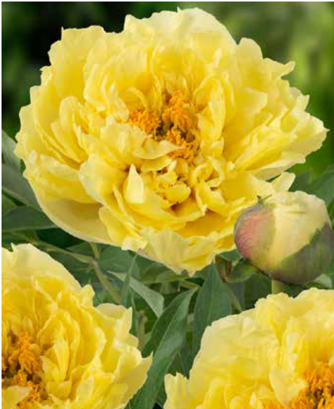
Itoh Yellow Crown (1974) Mid. | Pot