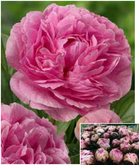
The Fawn (2000) Mid.