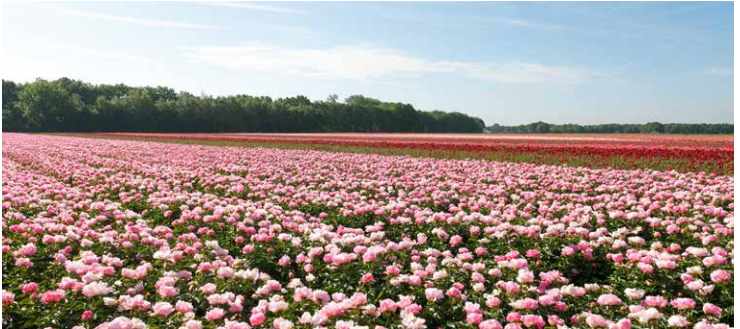
Ivory Victory (1988) Late