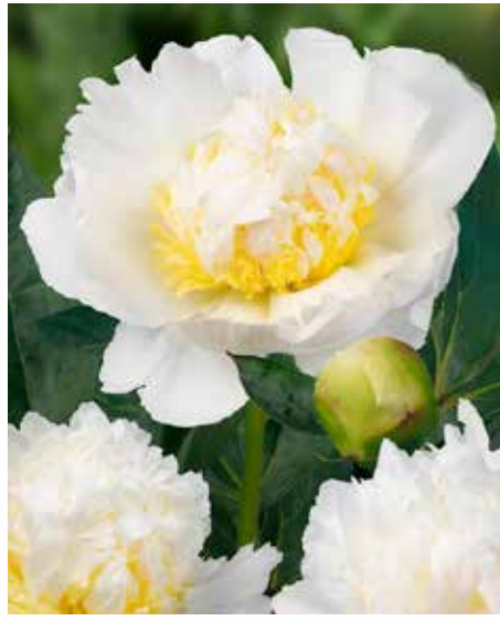
Bride's Dream (1965) Mid.