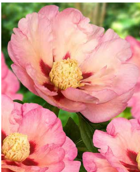
Itoh Pastel Splendor (1996) Mid. | Pot