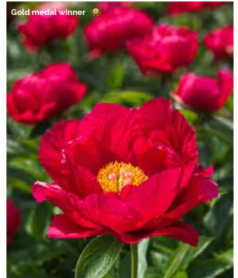
America (1976) Early