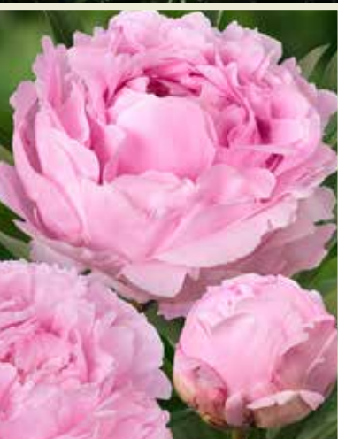
One of our fields: Coral Sunset