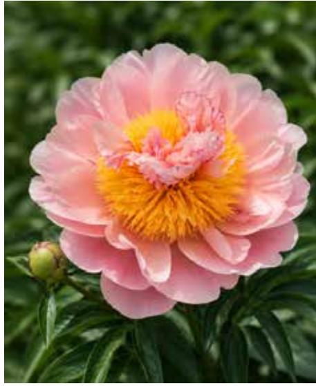
Tecumseh (1954) Early - mid.