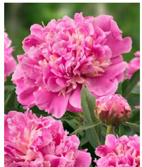
Anima (1934) Early - Mid. | Pot