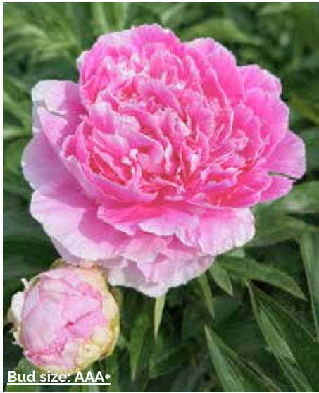
Pink Giant (1966)