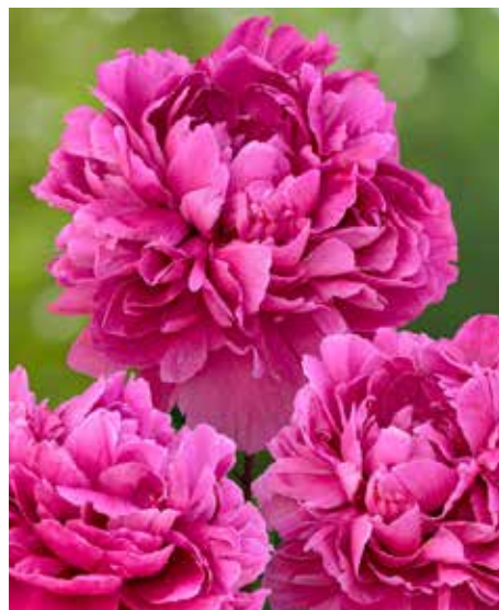
Jadwiga (1995) Early