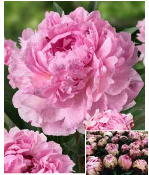
Sarah Bernhardt Unique™ (1997) | Late