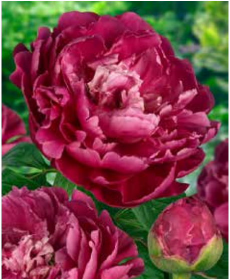
Louis van Houtte (1867)