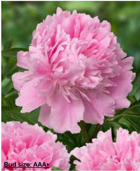
Hermione (1932) Early - mid.