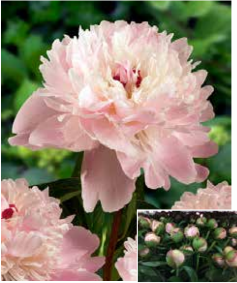
Alertie (<1950) Very early | Pot