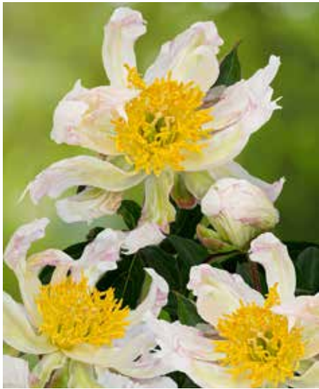
Green Halo (1999) Early - mid. | Pot