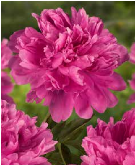
Amabilis (Pink Panther) (1856) Early - mid. | Pot