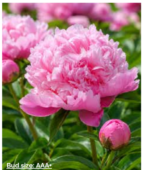
Lady Anna (1856) Mid. | Pot