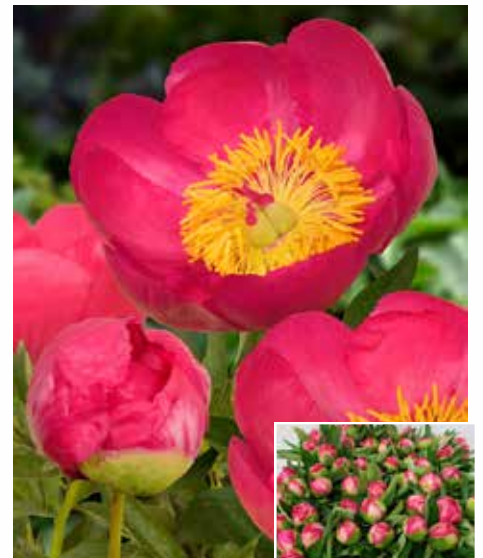
Flame (1939) Early | Pot