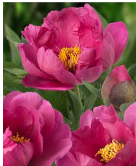
Itoh Pink Ardour (1996) Mid. | Pot