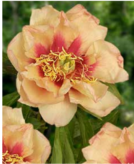
Itoh Callies Memory (1990) | Early - mid. | Pot