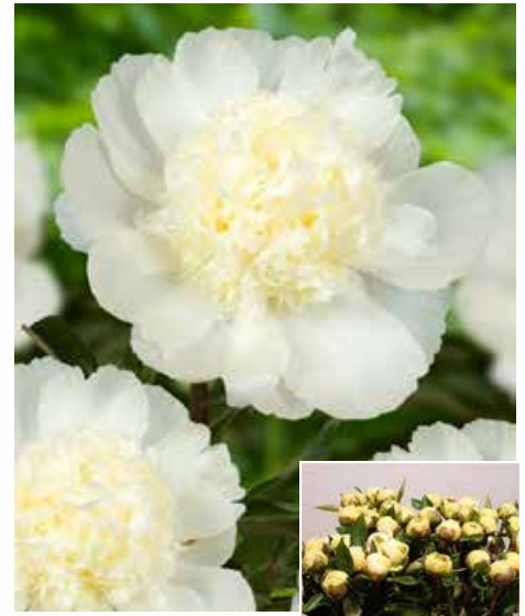
Charle's White (1951) Early - mid.