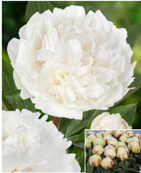
Snow Princess (1990) Mid.