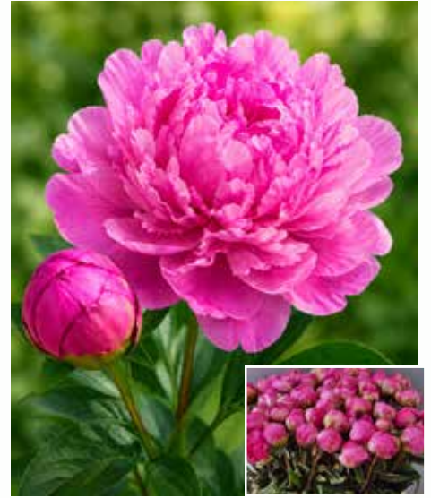
Glory Hallelujah (1970) Late