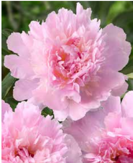
Pecher (Noemi Demay) (1867) Early | Pot