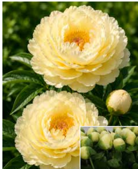
Early Sensation (1988) Early