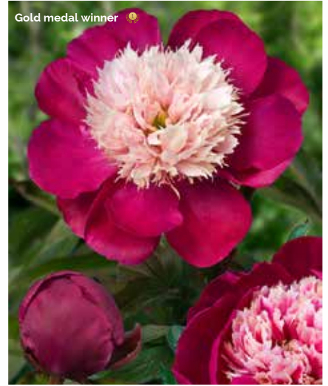
White Cap (1956) Early - mid.