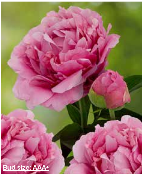
Kathy's Touch (2009) Very early