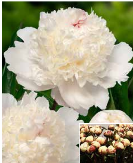
Festiva Maxima (1955) | Early - Mid.