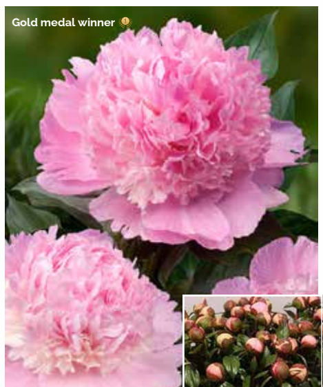
Angel Cheeks (<1975) Early - mid.