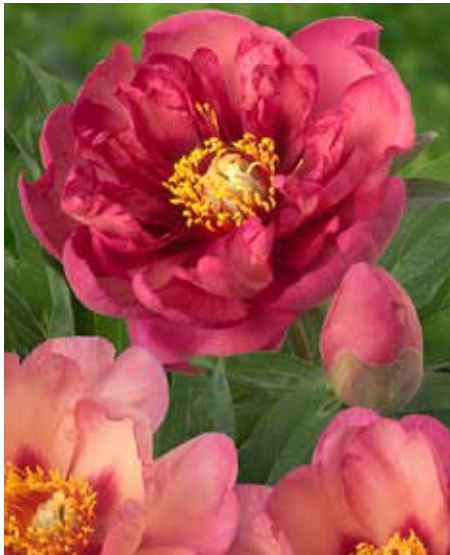
Itoh Magical Mystery Tour (2002) | Early | Pot