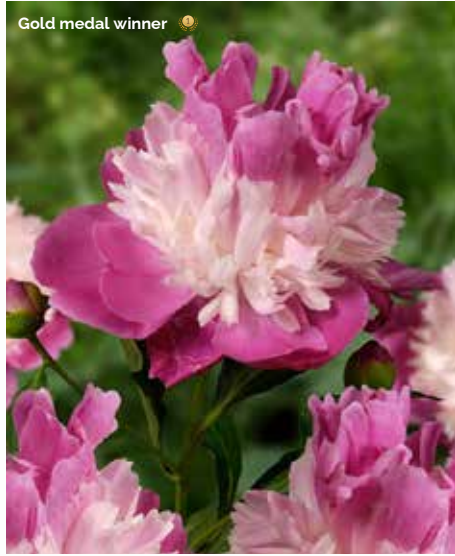
Gay Paree (1933) Early - Mid.