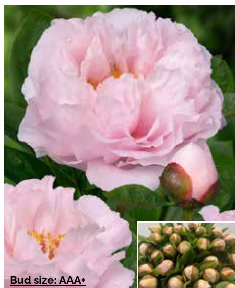
Blushing Princess (1991) | Very early