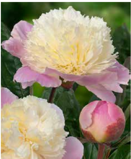
Touch of Class (1999) Mid.