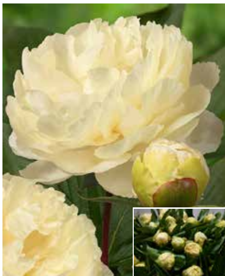
Sunny Girl (1985) Very early