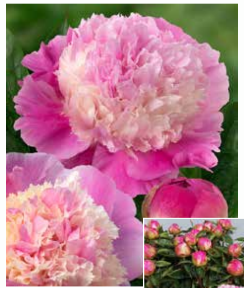
She's My Star (2000) Early - mid.