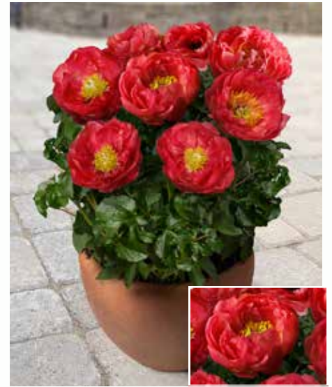
Patio Peony™ Moscow Early - mid.