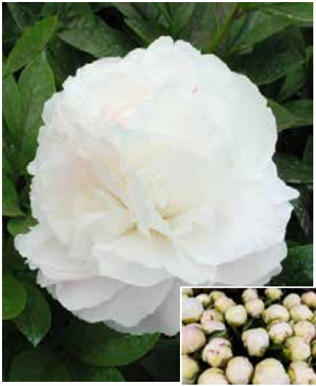
Mistress (1949) Late