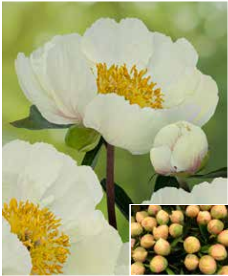
Claire de Lune (1954) Very early