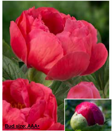
Bud size: AAA+ Coral Magic (1998) Early