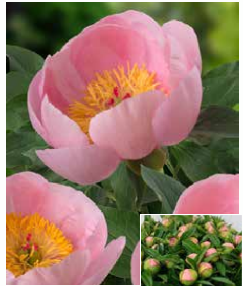
Soft Salmon Saucer (1981) | Early