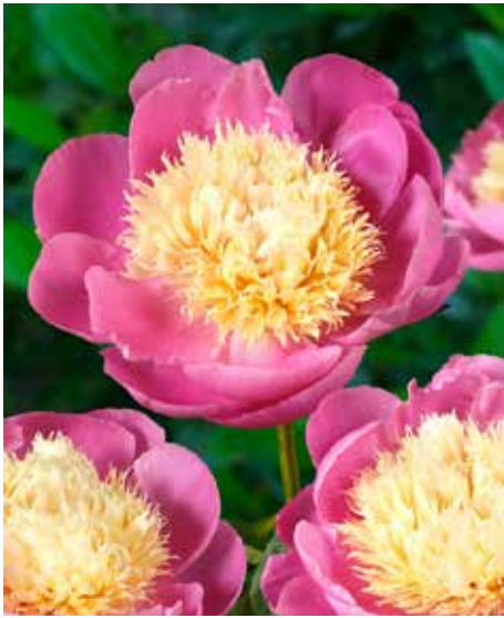
Bowl of Beauty (Globe of Light) (1949) | Early - mid.