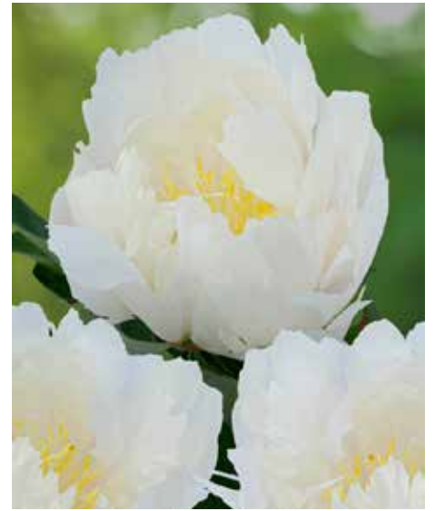
Itoh Love Affair (2005) Mid. - late | Pot