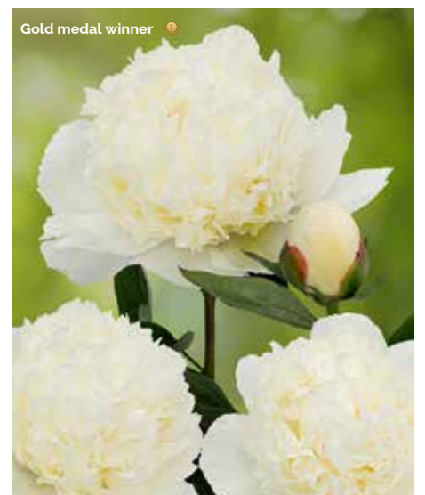
Lancaster Imp. (1987) Early | Pot