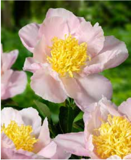
Garden Lace (1992) Early - Mid. | Pot