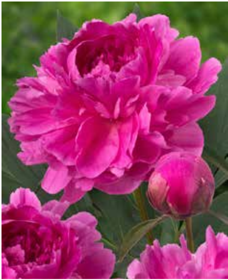
Bunker Hill (1906) Late | Pot