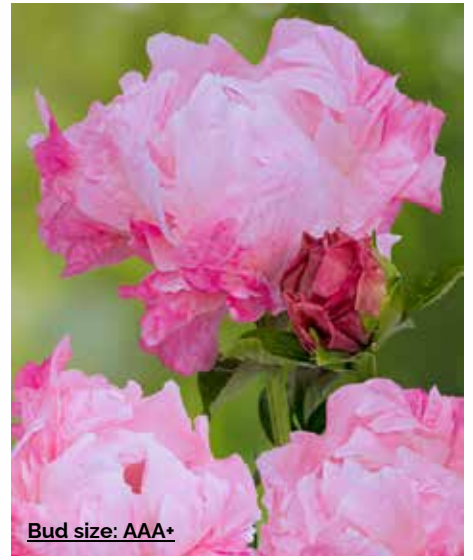
Pink Choice (2019)