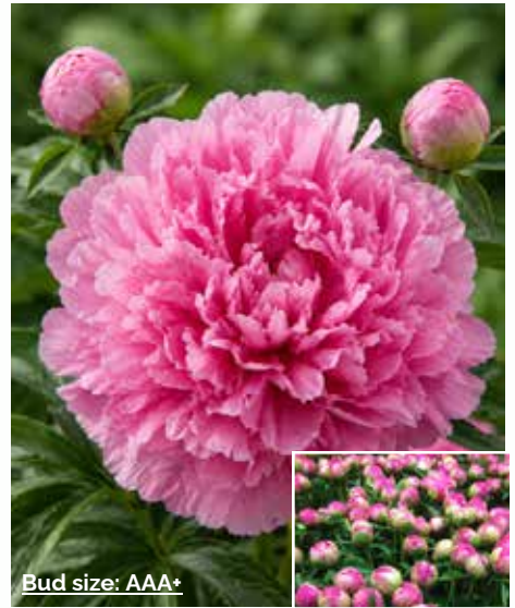
Pink Jazz (1972)