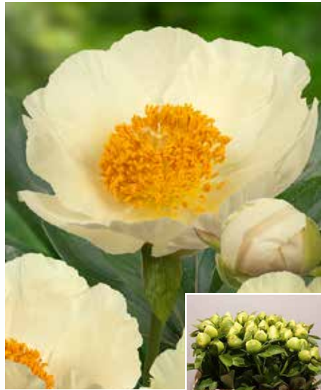
Moonrise (1949) Early | Pot