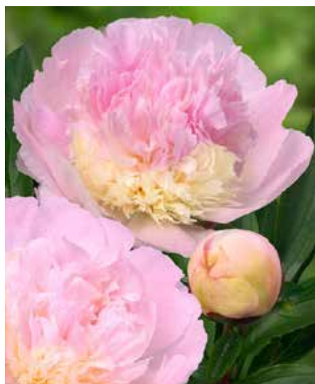
Petticoat Flounce (1985) Early