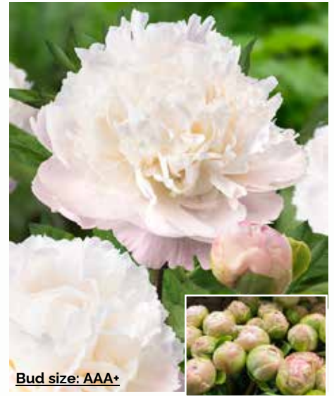
Moon over Barrington (1986) | Early-mid