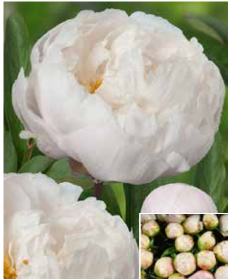
White Grace (2000) Mid.