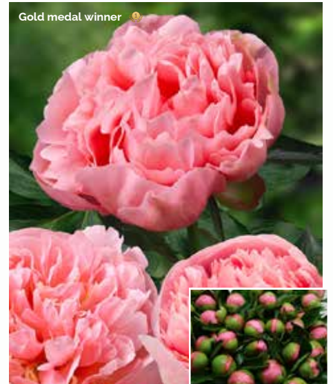
Etched Salmon (1981) | Early - mid.