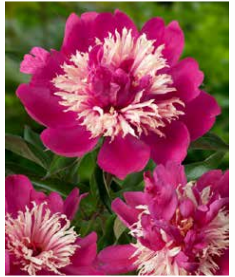
Top Hat (1971) Early - mid. | Pot