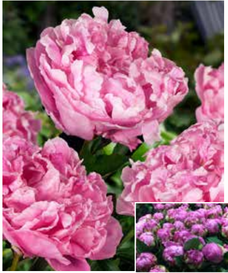
Alexander Fleming (<1950) | Mid. | Pot