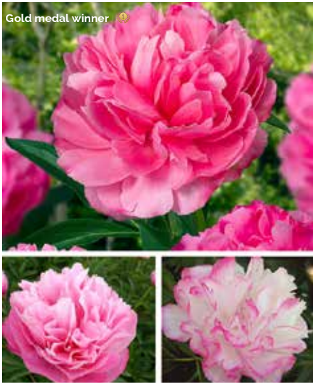
Joker (2004) Early | Pot