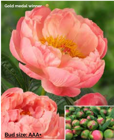
Gold medal winner 🏆 Bud size: AAA+ Coral Charm (1964) Early