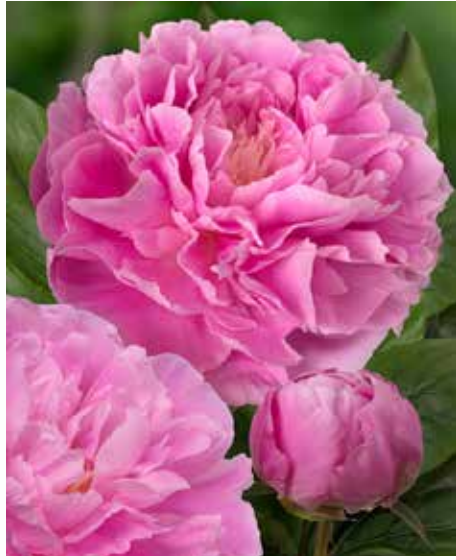
Silver Daubed (1977) Late