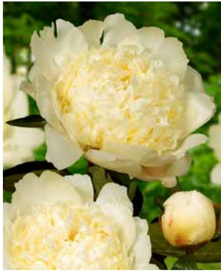
Capital Dome (1979) Early