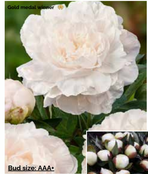
Mother's Choice (1950) | Early - mid.