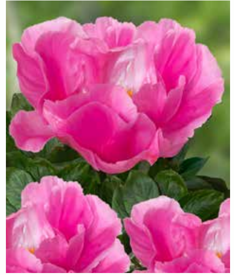
Terrific Gal (1995) Early | Pot