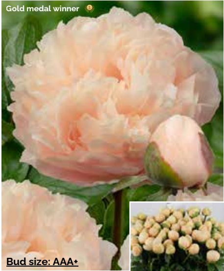
Pastelegance (1989) Early - mid.