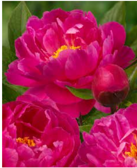
Nice Gal (1965) Early - mid. | Pot