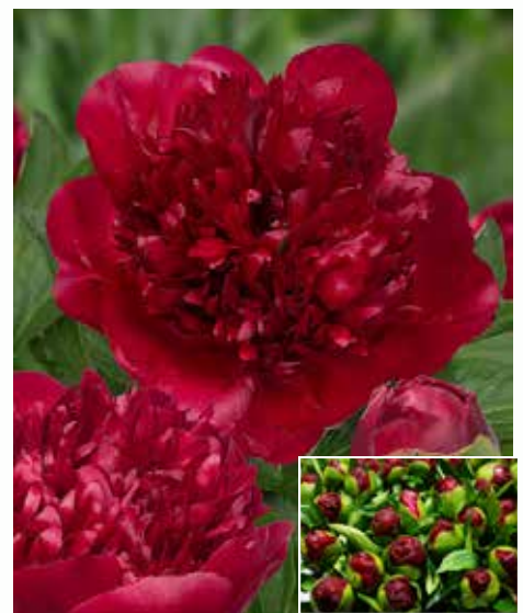
Christmas Velvet (1992) | Early