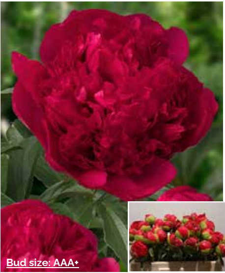
Bud size: AAA+ Command Performance (1996) | Early