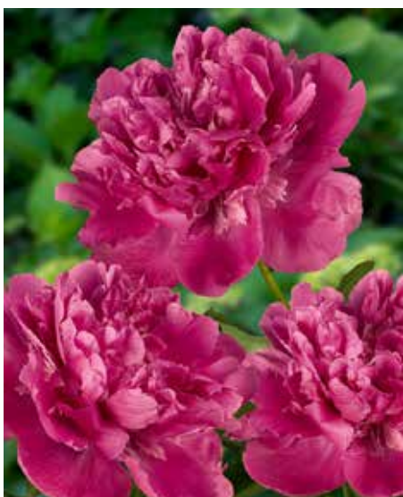
Edulis Superba (1824) Early - mid. | Pot