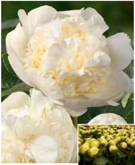
Bridal Shower (1959) Early - mid.