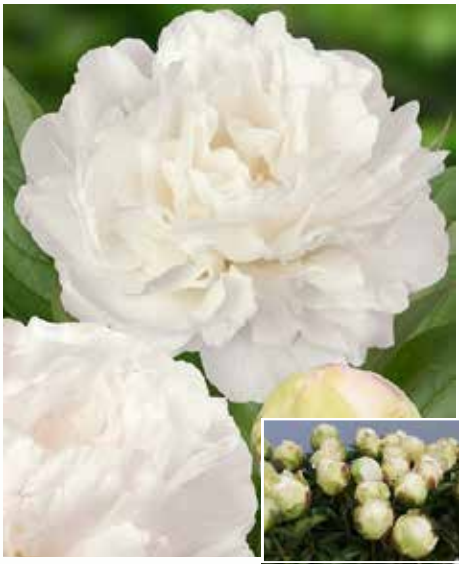
Puffed Cotton (2003) Mid.