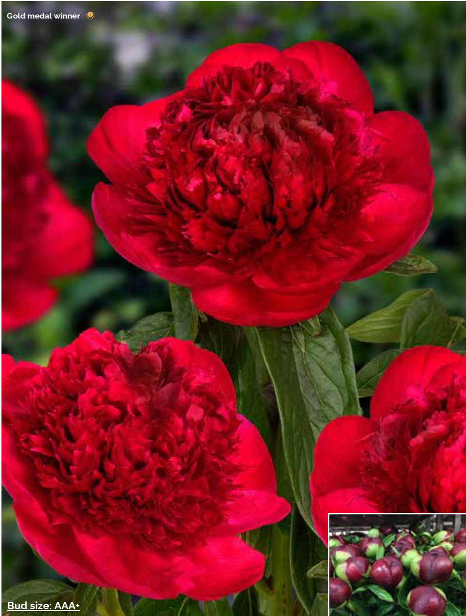
Red Charm (1944) Early