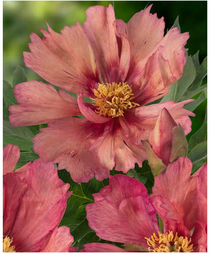
Itoh Sonoma Kaleidoscope (2001) Mid. | Pot