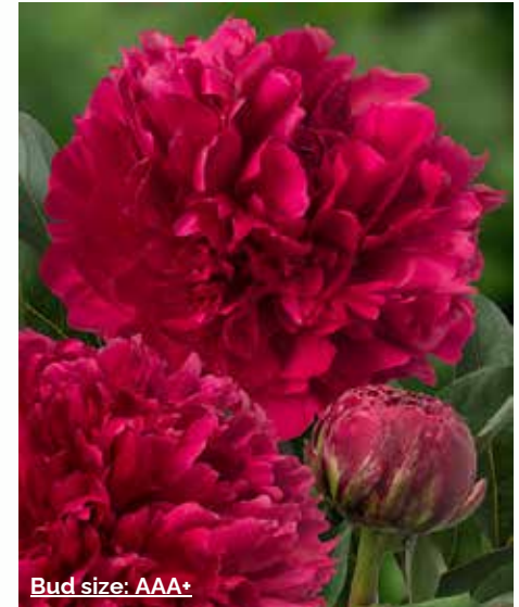
Red Magic (1950) Very late