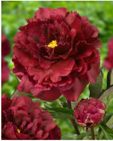
Black Beauty (1924)