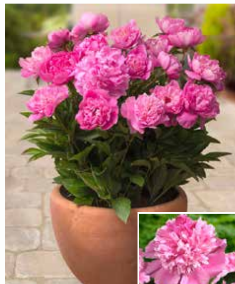
Patio Peony™ Rome Mid.