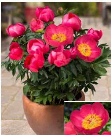
Patio Peony™ Oslo Very early