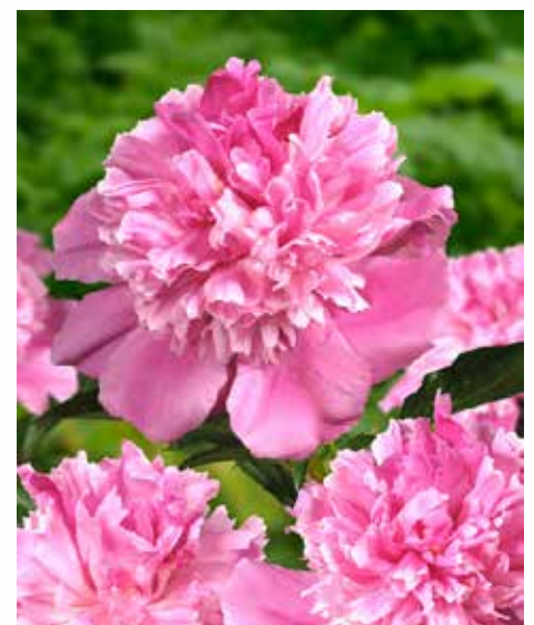
Bouquet Perfect (1987)