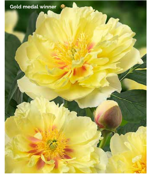
Itoh Bartzella (1986) | Mid. | Pot