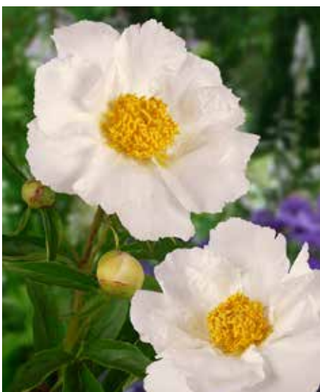
Krinkled White (1909) Mid. | Pot