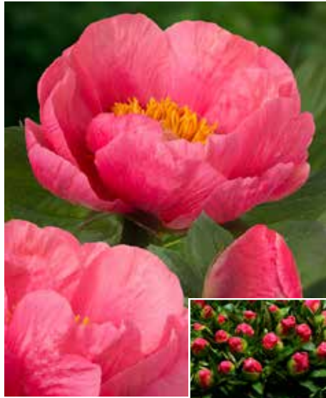
Lovely Rose (1942)