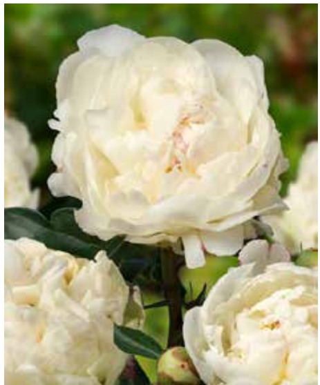
Kelways Glorious (1928) Late