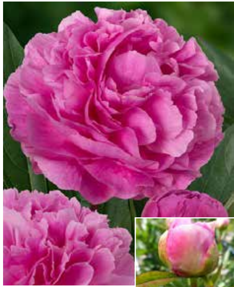
Think Pink (2000) Early