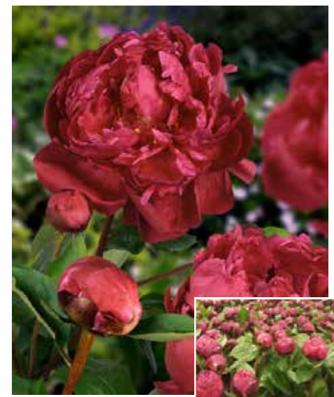
Red Sarah Bernhardt (Fiona) (1970) | Mid.