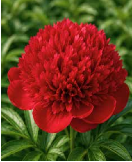
Viking Valor (1989) Mid.