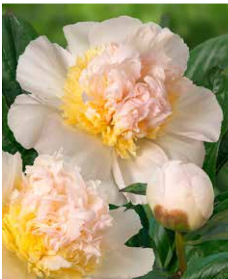
Honey Gold (1976) Mid.