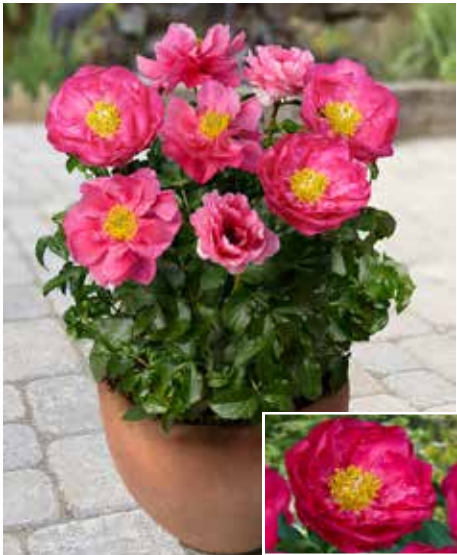
Patio Peony™ Athens Very early