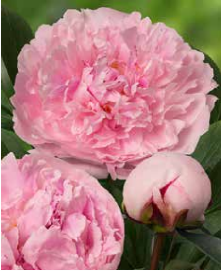
Reine Hortense (1857) Mid.