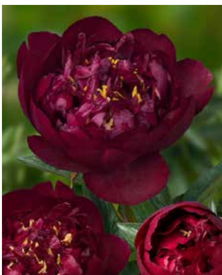
Buckeye Belle (1956) Early