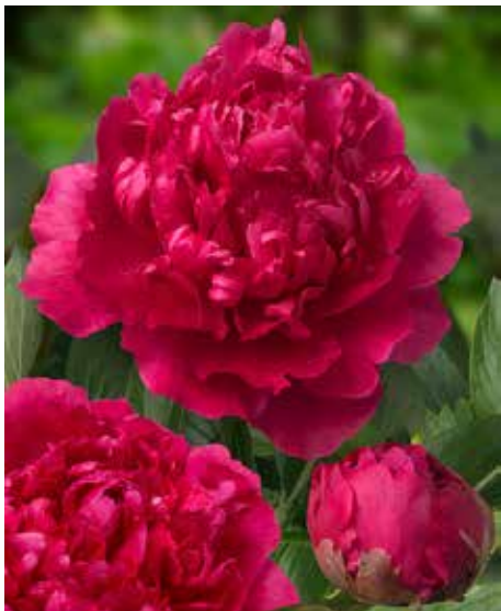
Felix Supreme (1955) Late