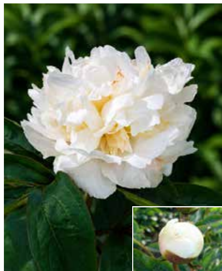
White Masterpiece (2003) Mid.