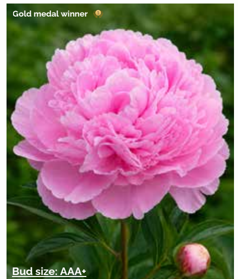
Myra MacRae (1967) Very late