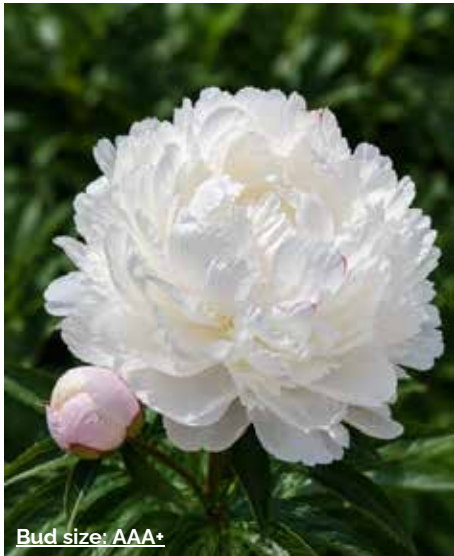
White Frost (1979) Mid.