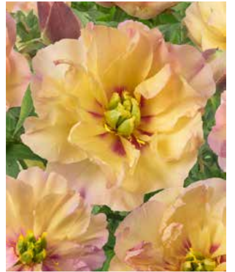
Itoh Canary Brilliant (1999) | Mid. | Pot