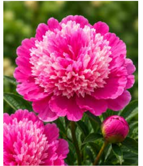
Hes My Star (2000) Mid.