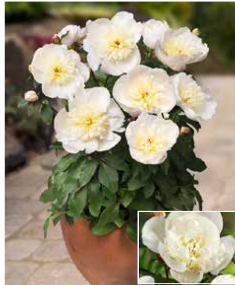
Patio Peony™ Madrid Late