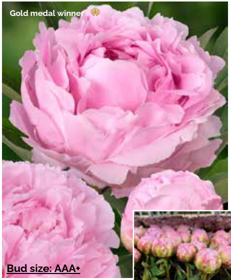
Pillow Talk (1973)