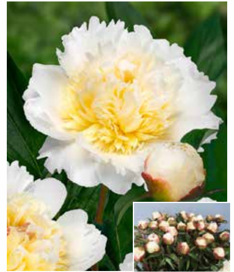
Bridal Grace (1999) Mid.