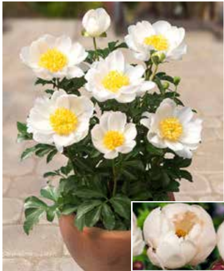
Patio Peony™ Dublin Late