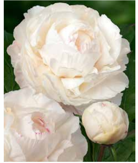
Silver Slippers (2003) Early - Mid.