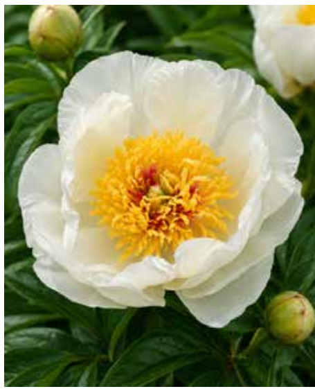
Seraphim (1938) Very Early | Pot