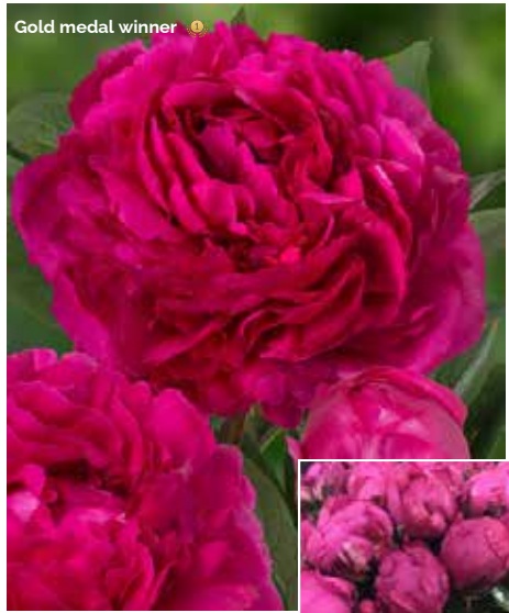
Kansas (1940) Early - mid.