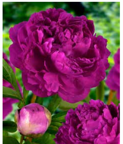
Victoire de la Marne (1915) Mid. | Pot