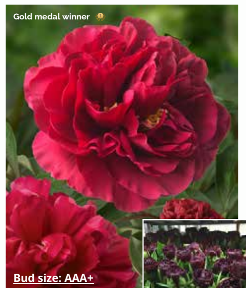
Ole Faithful (1964) Late