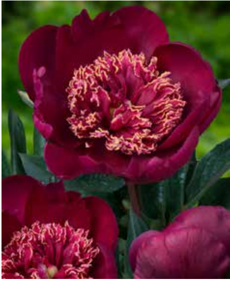
Sword Dance (1933) Late