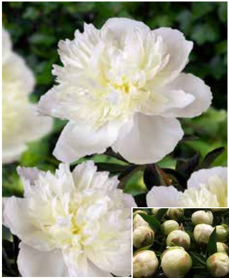
Duchesse de Nemours (1856) | Mid.