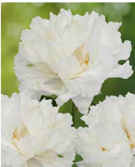
Grand Massive (2001) Very early