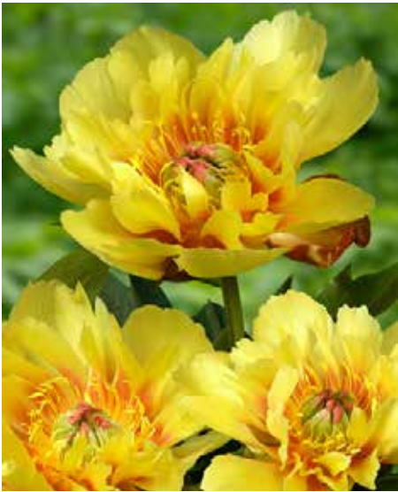
Itoh Border Charm (1984) | Mid - late | Pot