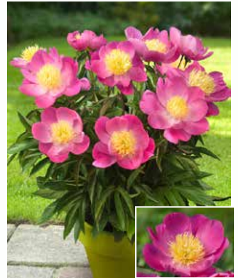
Patio Peony™ Kiev Mid.