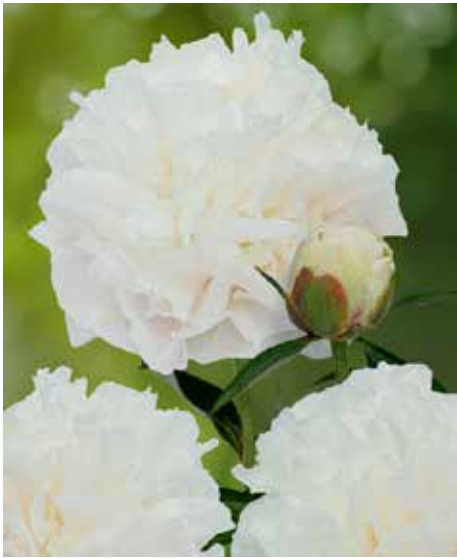
Moonlit Snow (1978) Mid.