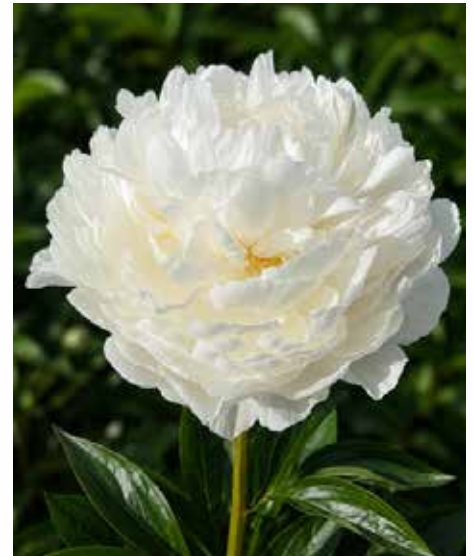
White Ivory (1981) Mid.