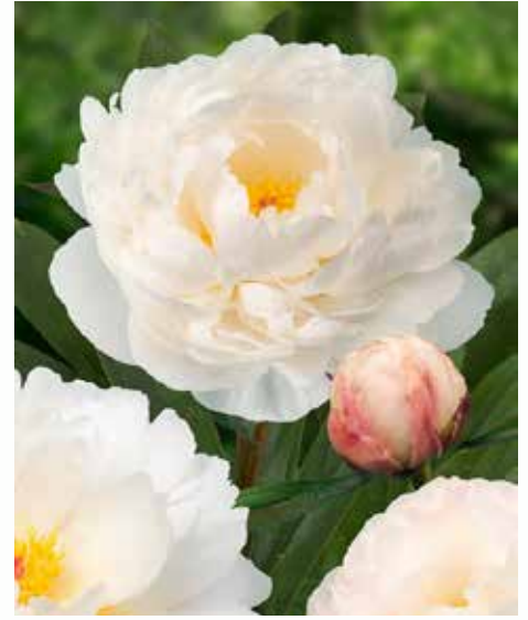
Allan Rogers (2008) Early - mid. | Pot