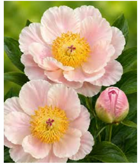
Apricot Whisper (1999)