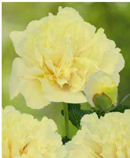
Vanilla Schnapps (2013) Very early