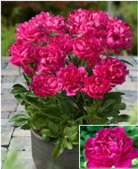
Patio Peony™ London Early