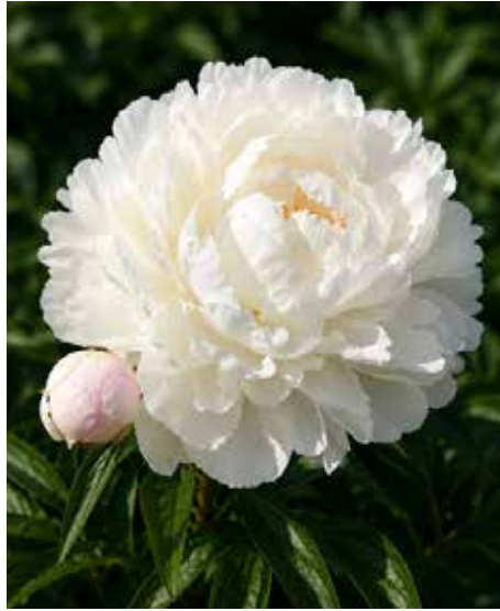
Vogue (1949) Mid.