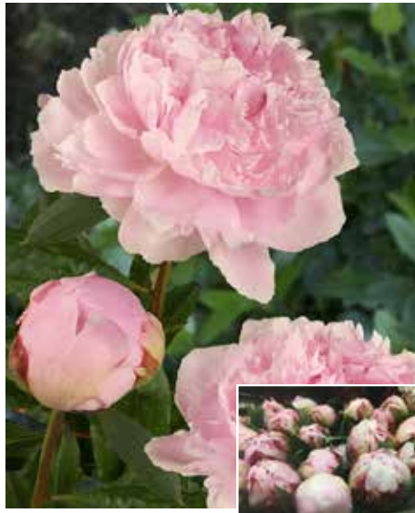
Sarah Bernhardt (1906) | Late | Pot