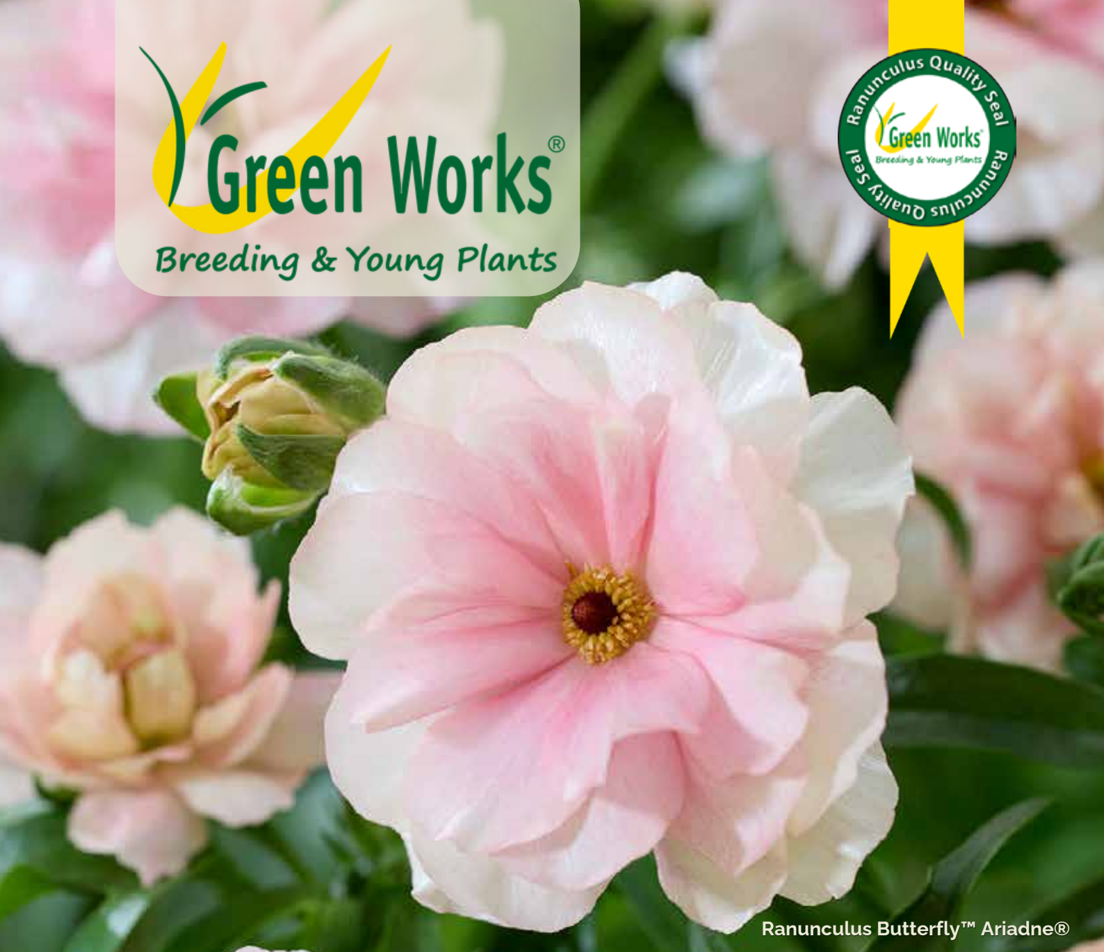
Ranunculus Butterfly™ Ariadne®