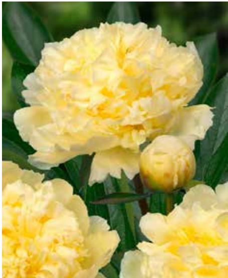
Goldilocks (1975) Mid.