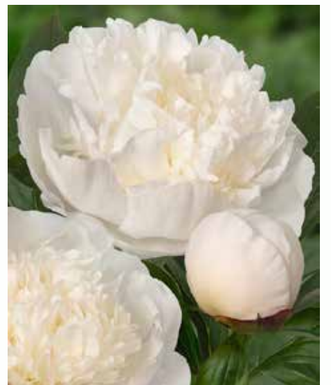
Immaculee (1953) Late | Pot