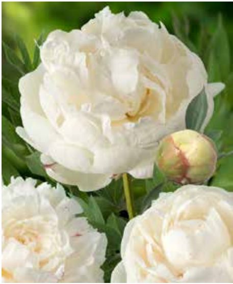
Snow Mountain (1946) | Late