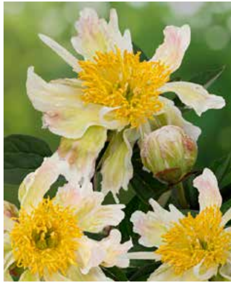
Green Lotus (1995) Early | Pot