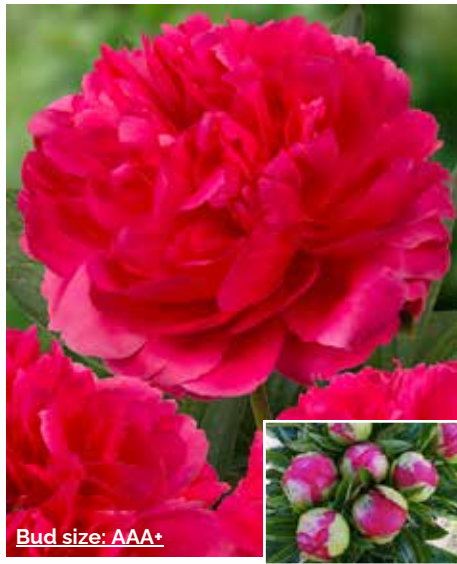
Raspberry Charm (1968) Early - mid.