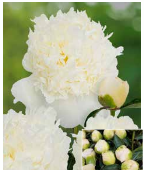
Princess Bride (1988)