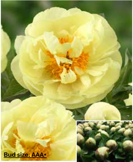
Lemon Chiffon (1981)