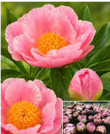
Sugar 'n Spice (1988) Very early | Pot