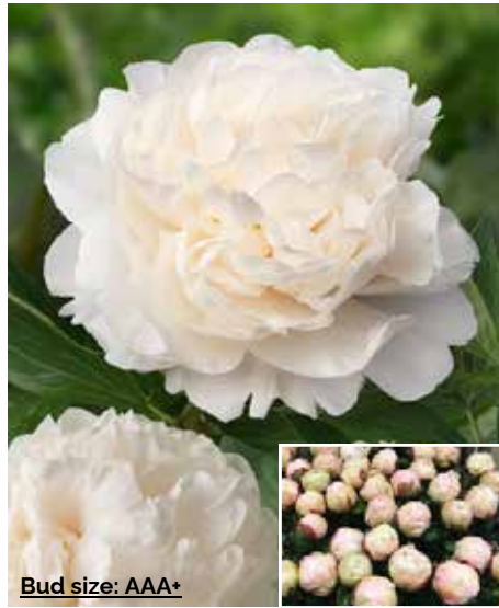
Bud size: AAA+ Class Act (1991) Mid.