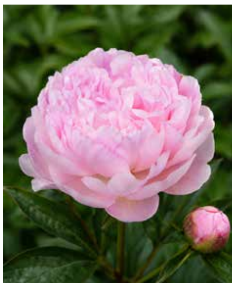
Petite Elegance (1995) Mid. | Pot