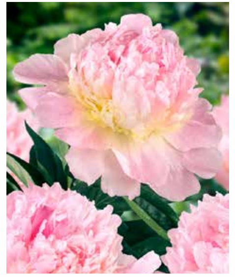
Raspberry Sundae (1968) Early - mid.