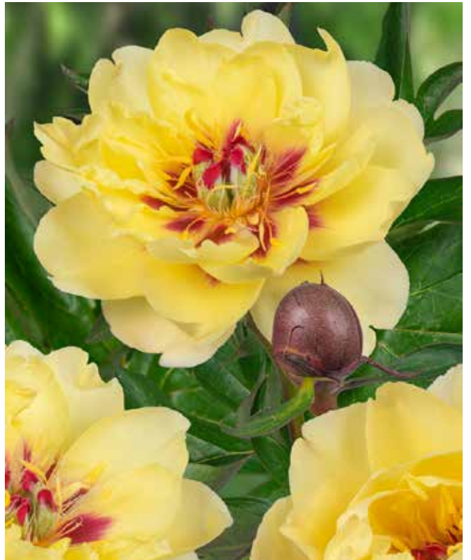
Itoh Yellow Waterlily (1999) Mid. | Pot