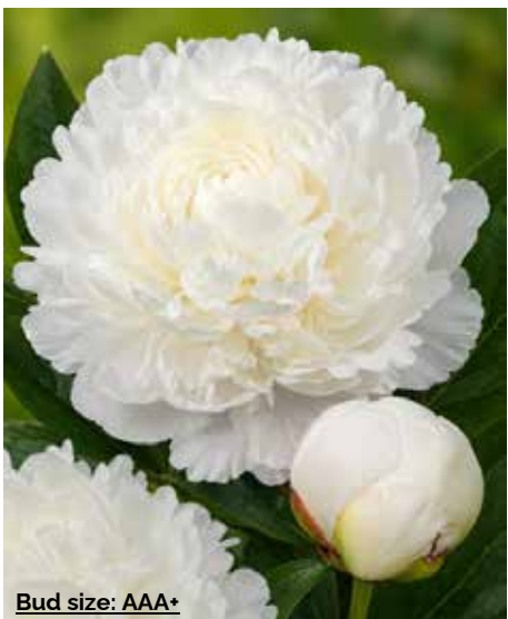
Mother's Day (1936) Mid