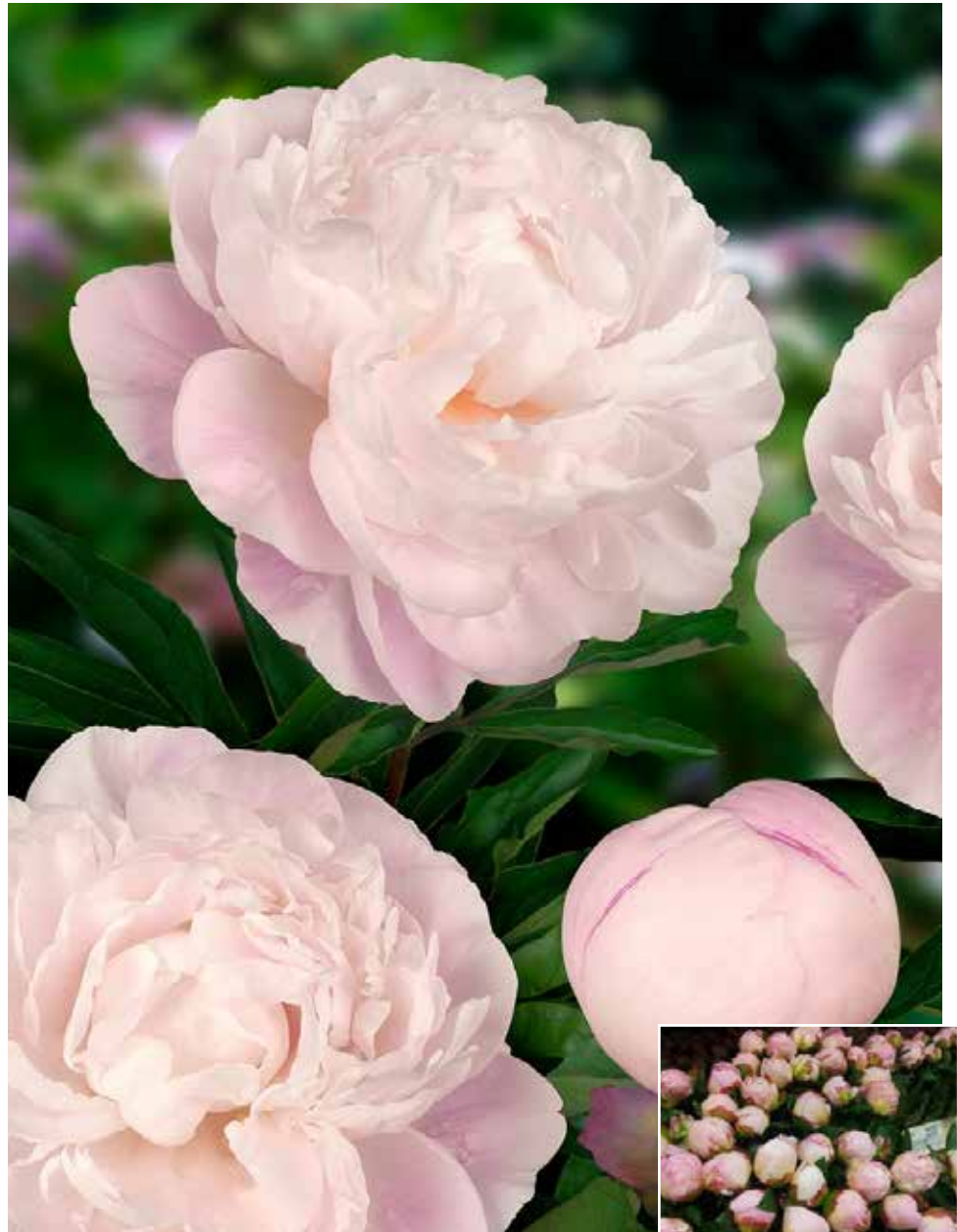
Gardenia (1955) Early - mid. | Pot