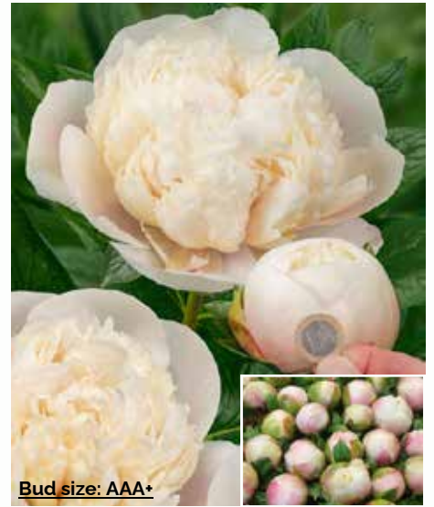
Bud size: AAA+ Colonel Owens Cousins (1972) | Early