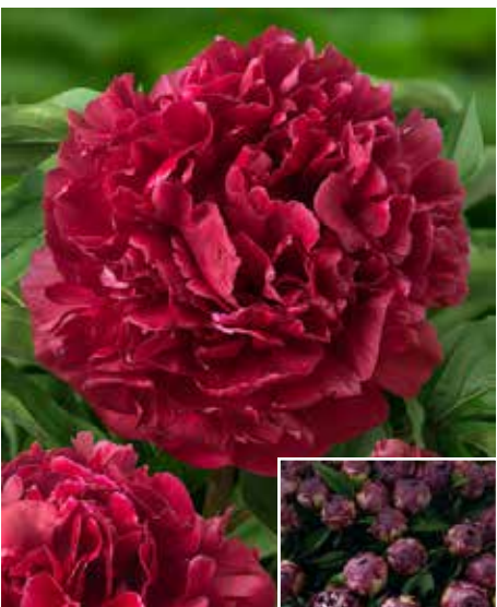
Highlight (1952) Early - mid.