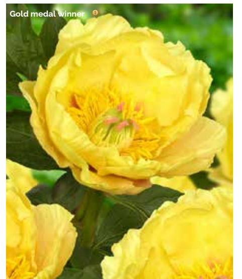
Itoh Garden Treasure (1984) | Mid. | Pot