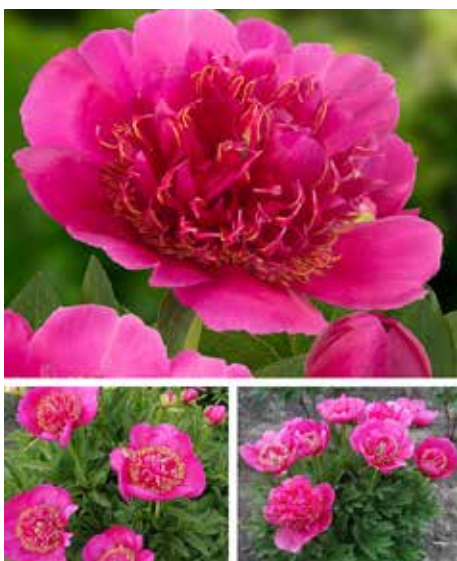
Anemoniflora (<1900) Very Early | Pot