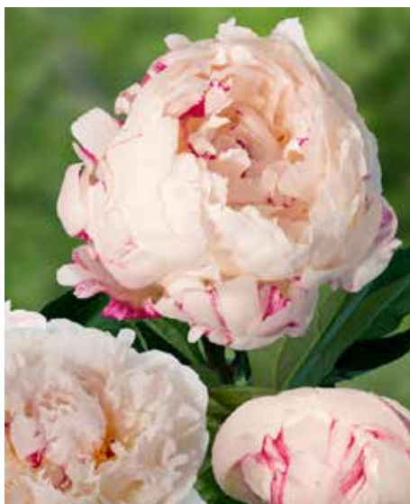
Chinook (1981) Very late