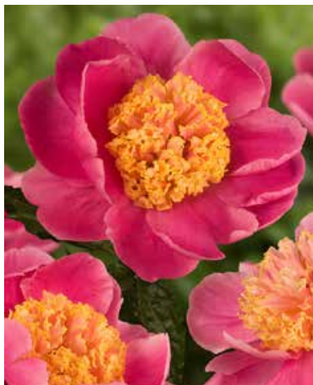
Doreen (1949) Late