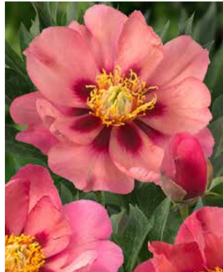
Itoh Old Rose Dandy (1993) Mid. | Pot