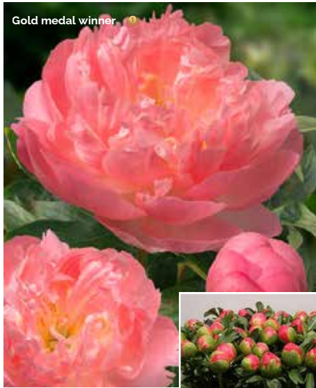
Pink Hawaiian Coral (1981) | Early