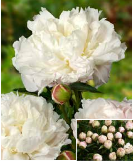
Shirley Temple (<1948) | Mid. | Pot