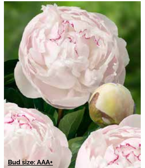
Odile (1928) Early