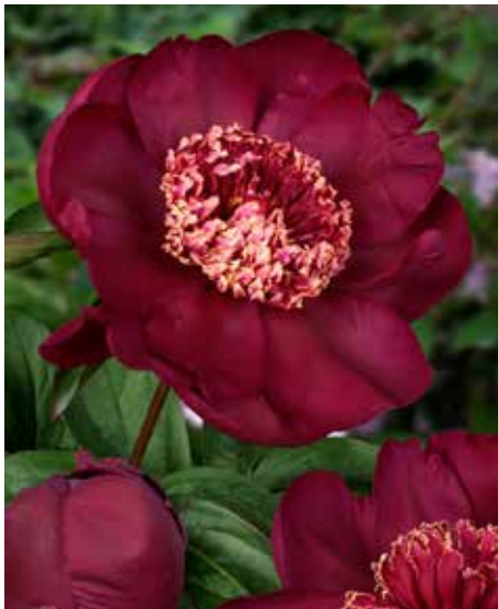
Nippon Beauty (1927) Late