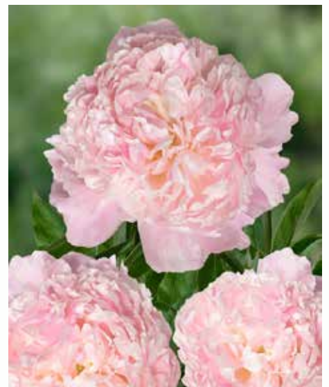
Sweet Sixteen (2007) Early - Mid. | Pot