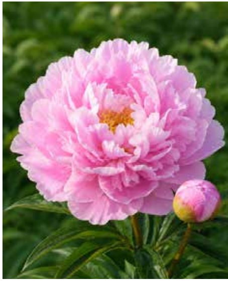
Pink Charmer (1993)