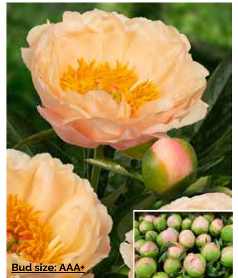
King's Day (2019) Early