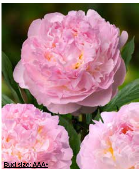
Blush Queen (1949)