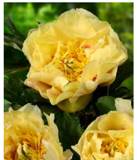
Itoh Prairie Charm (1992) Mid. | Pot