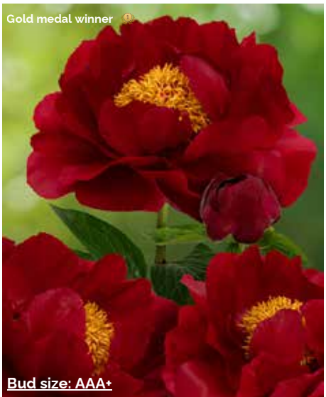
Mackinac Grand (1992)