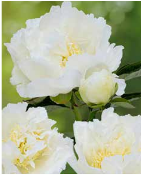
Aphrodite Kiss (2003)