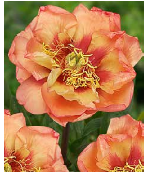
Itoh Orange Victory (2001) Early - mid. | Pot