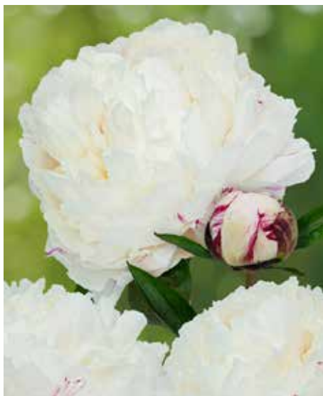
White Lullaby (2000) Mid. - late | Pot