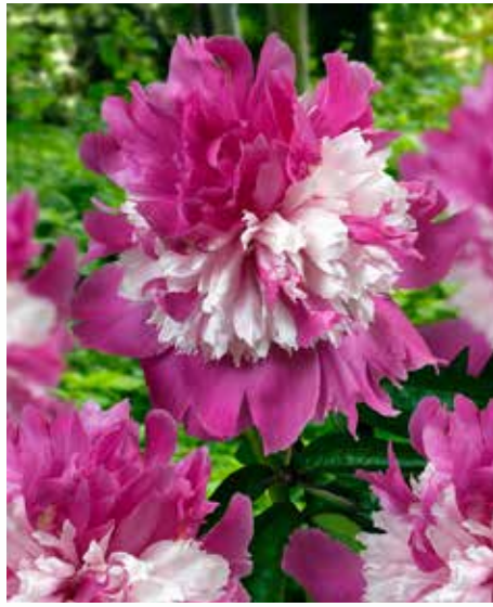
Celebrity (1985) Early - mid.