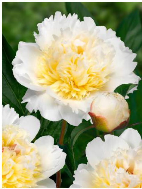
Bridal Grace (1999) Mid.