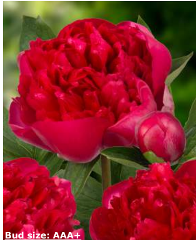
Bud size: AAA+