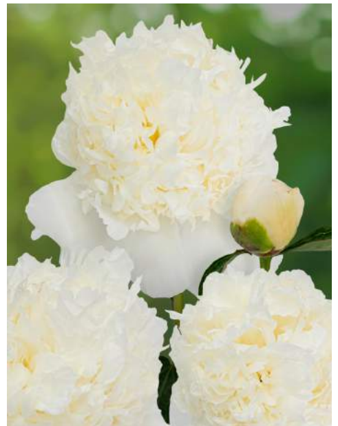
Princess Bride (1988) Early