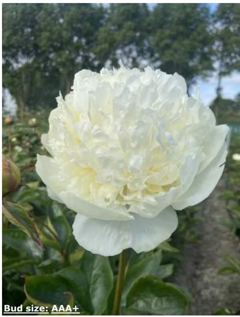
Bridal Gown (1957) Mid. | Pot