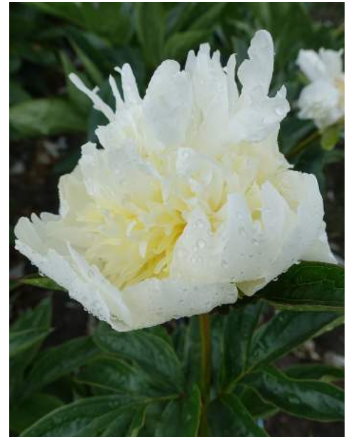
Bride's Dream (1965) Mid.