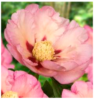
Itoh Pastel Splendor