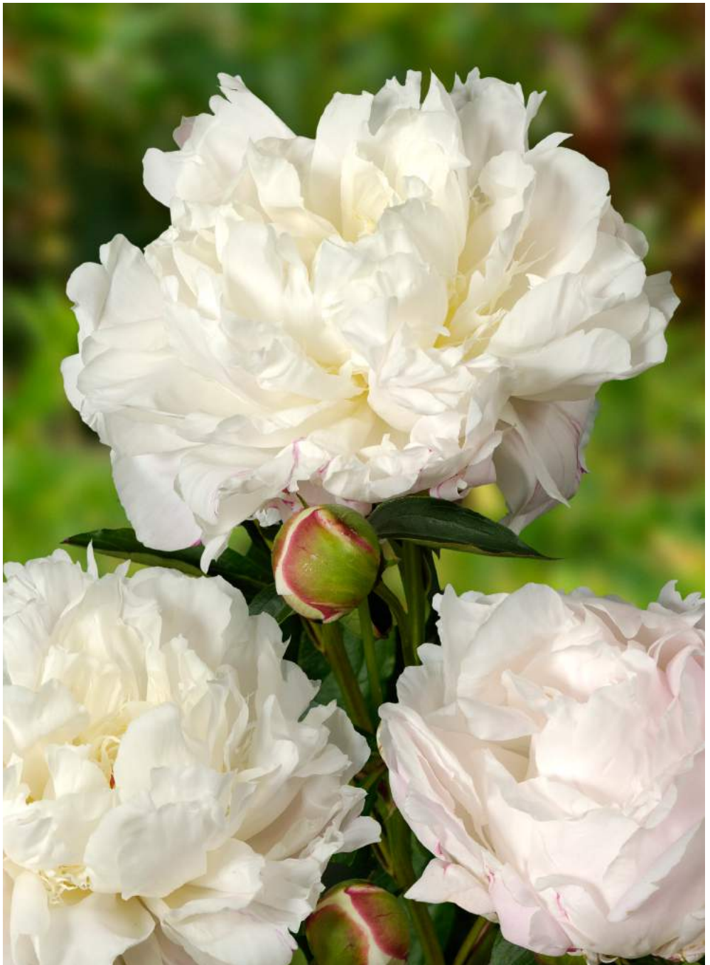
Sorbet (<1987) Late