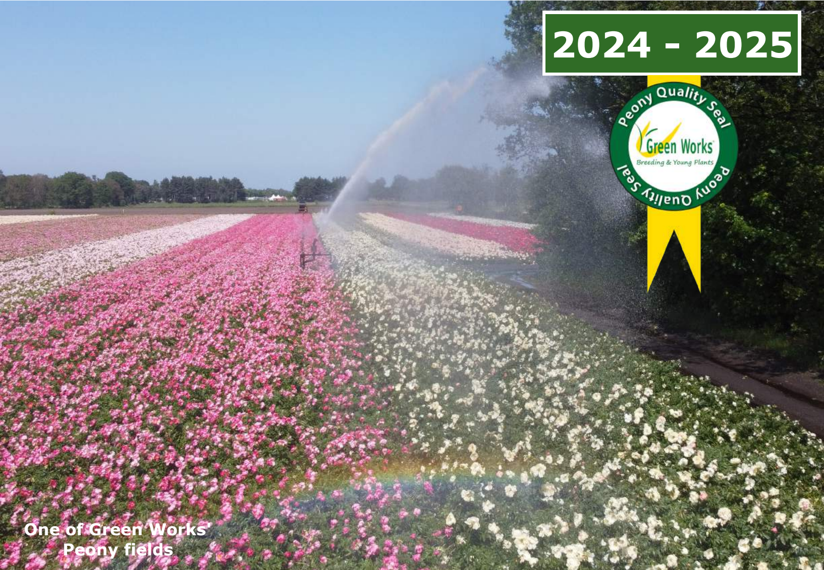
One of Green Works Peony fields