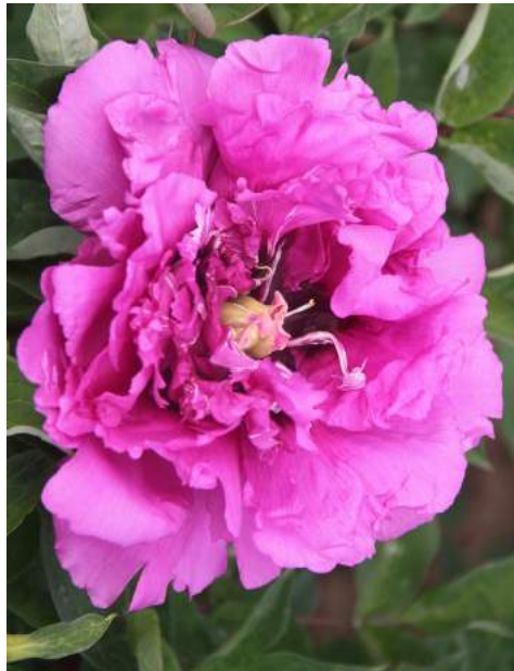
Rockii-Flare Ballroom (Lan Hai Cha Cui) | Mid.