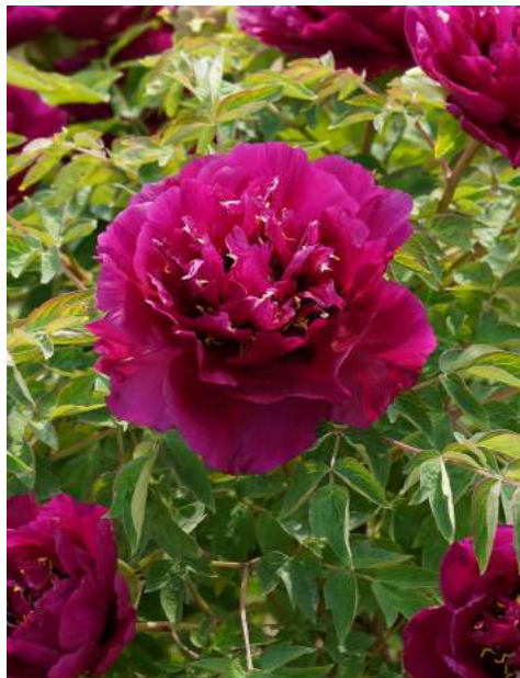
Rockii-Flare Dark Horse (Jing Mo Sa Jing) | Mid.