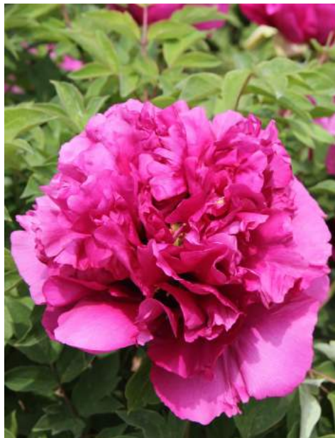
Rockii-Flare Noble Crown (Jing Zi Guan Yin Xian) | Mid.