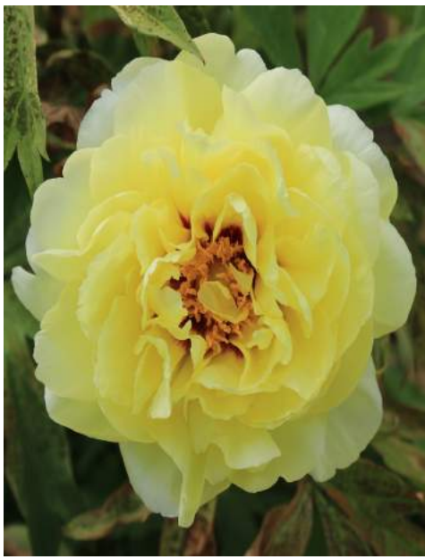
Lutea High Noon Mid.