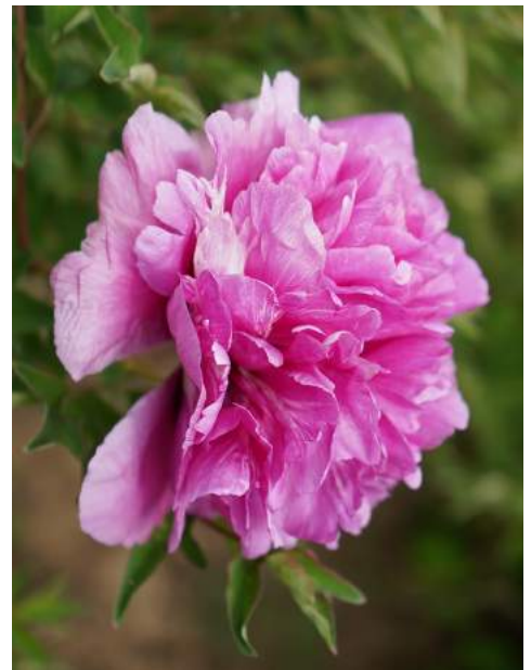
Rockii-Flare Dream (Jing Zui Mei) | Mid.