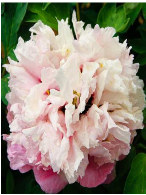
Rockii-Flare Sugarcone (Gui Chuan Fen) | Mid.