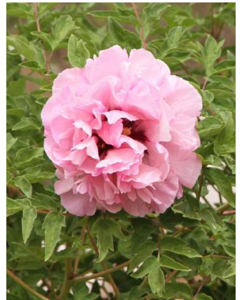
Rockii-Flare Pants (Jing Ming Fen) | Mid.