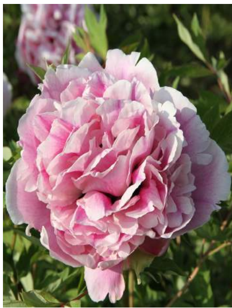
Rockii-Flare Fiesta (Guan Yin Mian) | Mid.