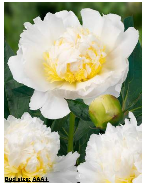
Bridal Icing (1959) Mid.