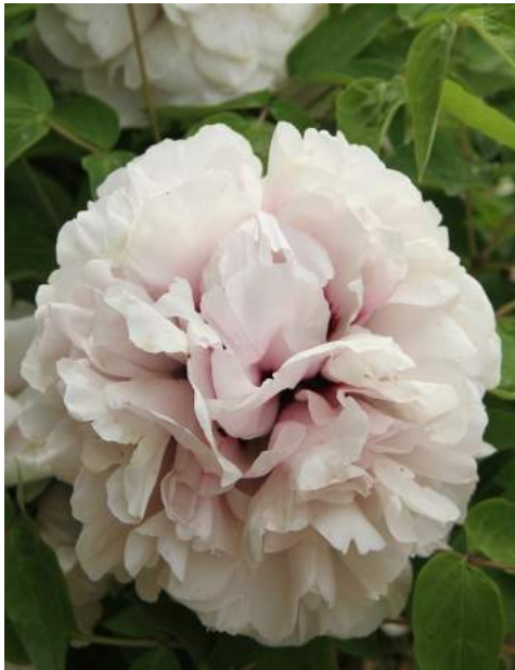
Rockii-Flare Baby Girl (Jing Juan Fen) | Mid.