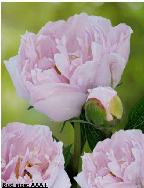
Pink Vanguard (2005) Very early