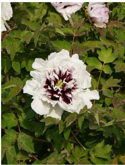
Rockii-Flare Eagle Wings (Jing Yu Tian Cheng) | Mid.