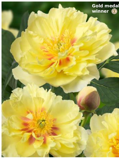
itoh Bartzella (1986) | Mid. | Pot