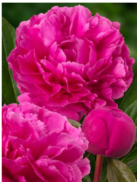
Dayton (1962) Mid.