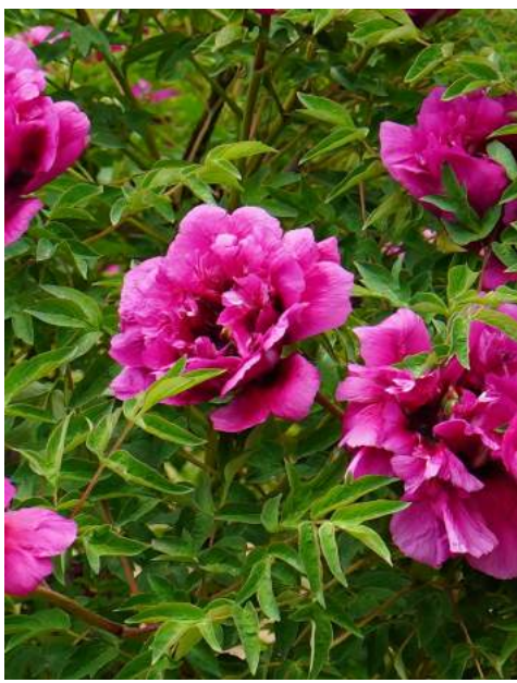
Rockii-Flare Rebel (Gao Yuan Sheng Huo) | Mid.