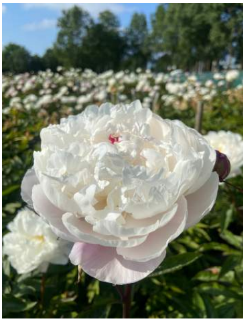
Vogue (1949) Mid.