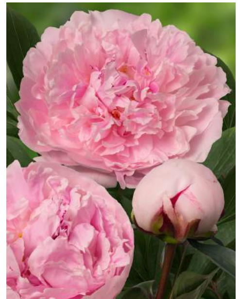
Reine Hortense (1857) Mid.