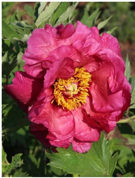
Lutea Tropical Mid.