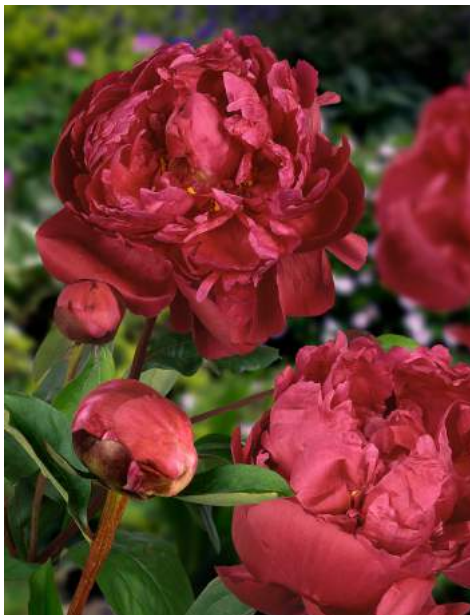
Red Sarah Bernhardt (1970) | Mid.