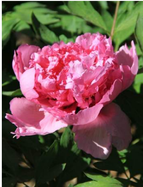
Rockii-Flare Gentle Touch (Qian Zi Bai Tai) | Mid.