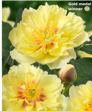
Gold medal winner