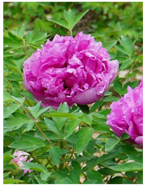
Rockii-Flare Abracadabra (Lan Guan Yu Dai) | Mid.