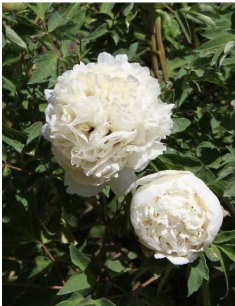
Rockii-Flare Carte Blanche (Jing Yun Guan) | Mid.