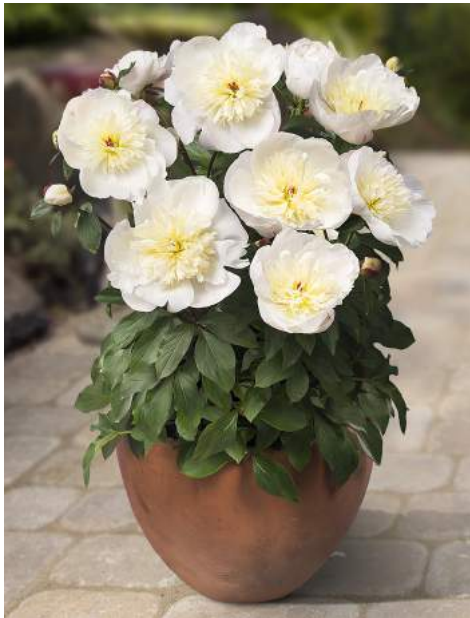
Patio Peony™ Madrid Late