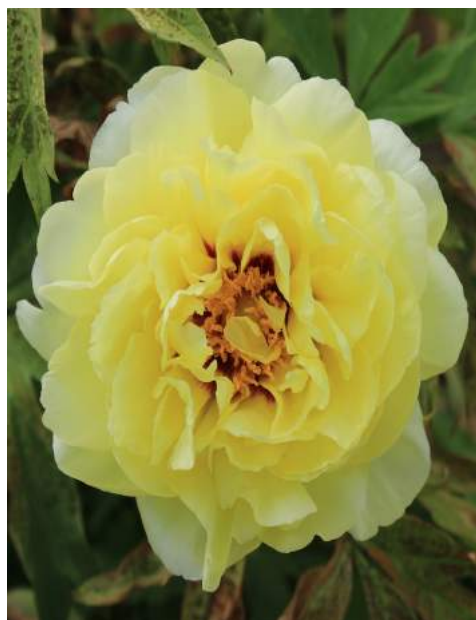
Lutea High Noon Mid.