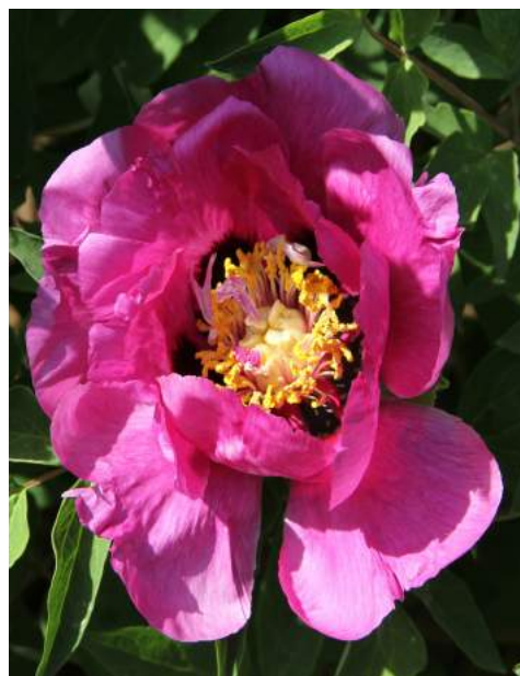
Rockii-Flare Bingo (Jing Hong Ying Bo) | Mid.