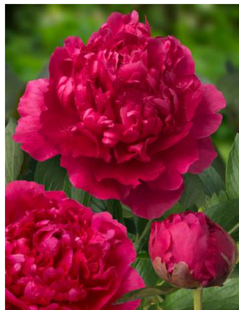
Felix Supreme (1955)