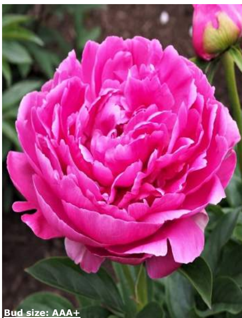
Rozella (1990) Late