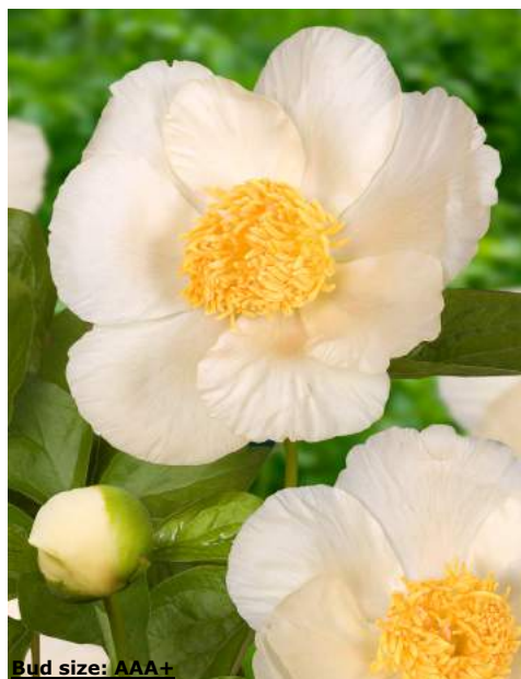
Roy Pehrsons Best Yellow (1982) Very early