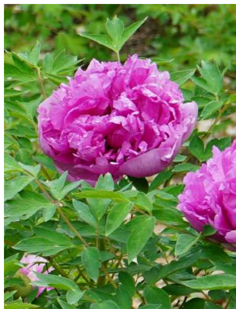
Rockii-Flare Abracadabra (Lan Guan Yu Dai) | Mid.