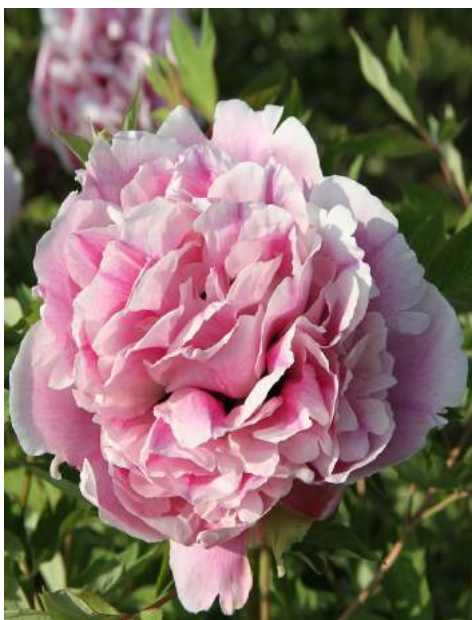
Rockii-Flare Fiesta (Guan Yin Mian) | Mid.