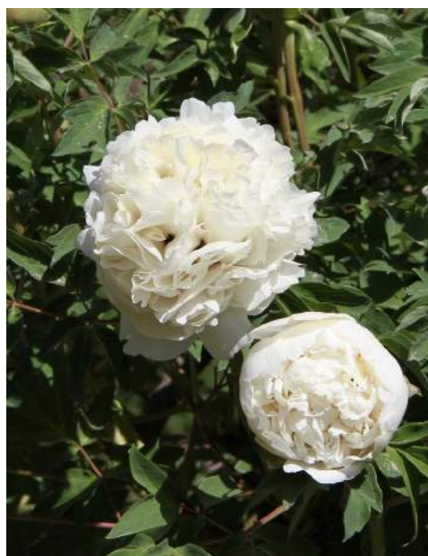
Rockii-Flare Carte Blanche (Jing Yun Guan) | Mid.