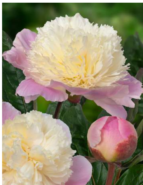
Touch of Class (1999)