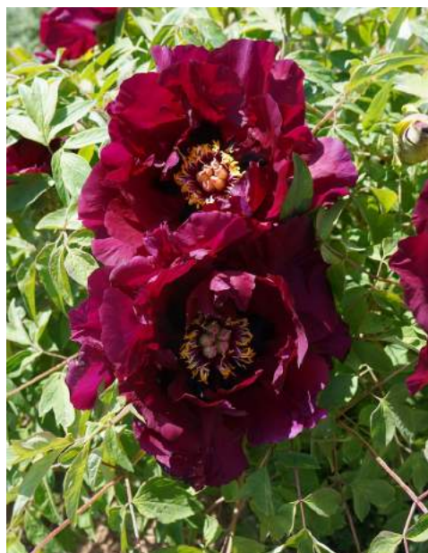
Rockii-Flare Flashlight (Jing Long Wang Yue) | Mid.