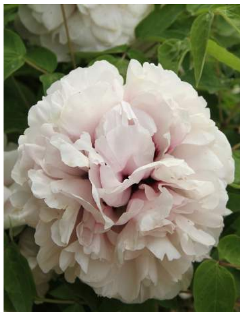
Rockii-Flare Baby Girl (Jing Juan Fen) | Mid.