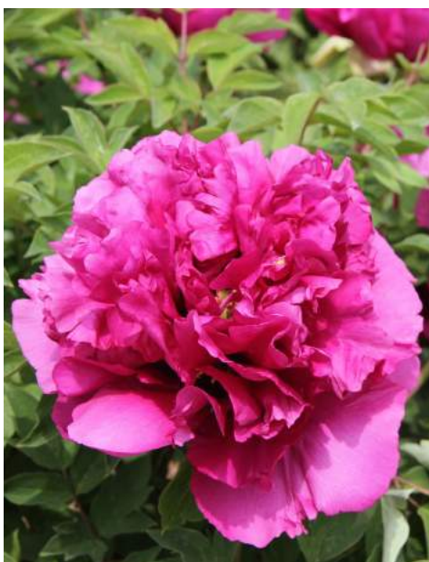
Rockii-Flare Noble Crown (Jing Zi Guan Yin Xian) | Mid.