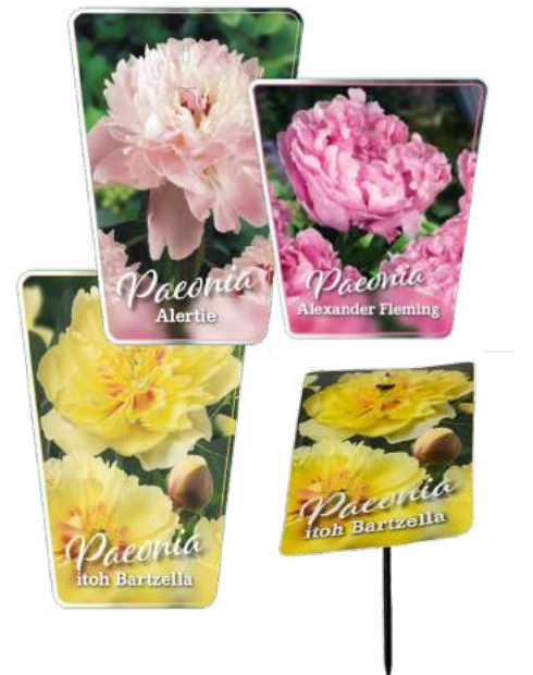
Order your Peony Labels at Green Works