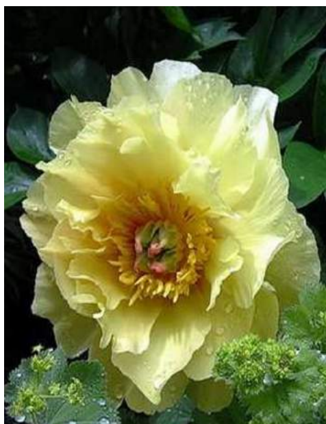
itoh Yellow Dream (1964) Mid. | Pot