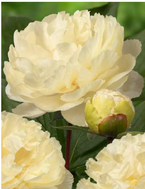
Sunny Girl (1985)