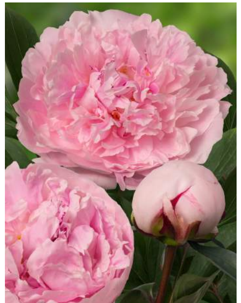
Reine Hortense (1857) Mid.