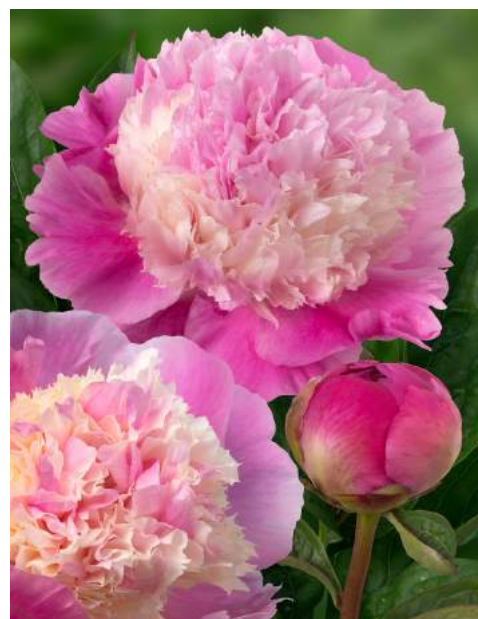
Victoire de la Marne (1915)