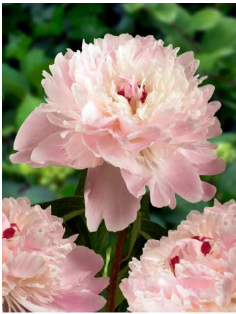
Alertie (<1950) Very early | Pot