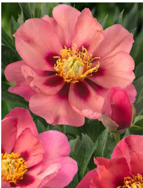
itoh Old Rose Dandy (1993)