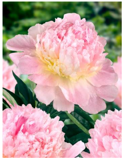
Raspberry Sundae (1968) Early - mid.