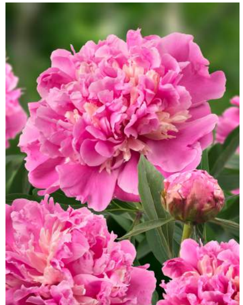
Anima (1934) Early - mid. | Pot