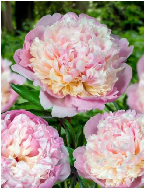
Madame Calot (1856) Early - mid.