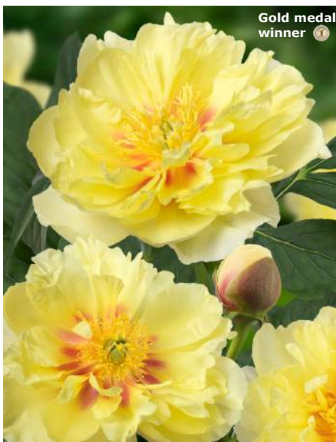
itoh Bartzella (1986) Mid. | Pot