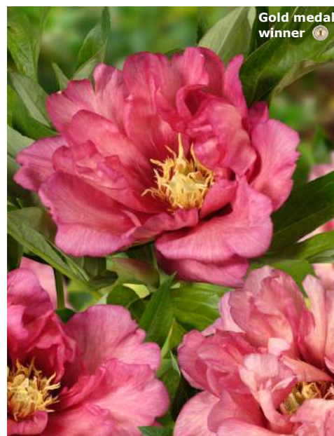
itoh Hillary (1999) Early - mid. | Pot