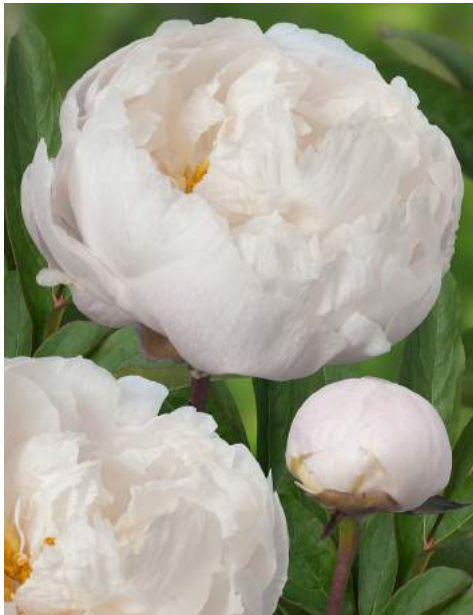
White Grace (2000) Mid.