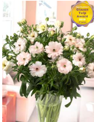
Ranunculus Butterfly™ Ariadne®