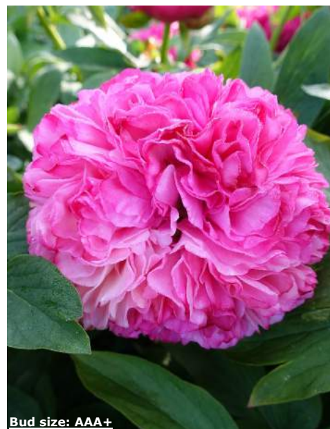
Coral Pom Pom (-)