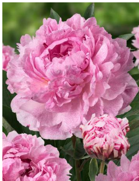
Sarah Bernhardt Unique (1997) Late