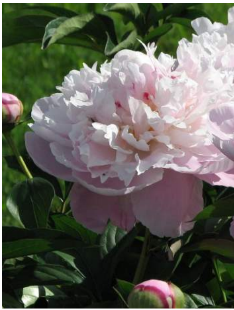
Lady Alexandra Duff (1902) Mid.