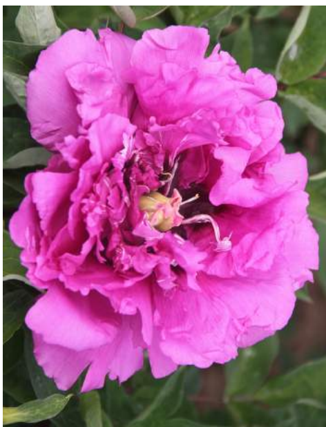
Rockii-Flare Ballroom (Lan Hai Cha Cui) | Mid.