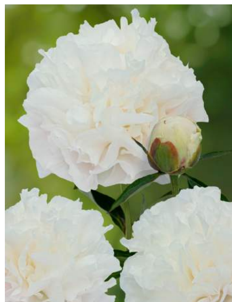
Moonlit Snow (1978)