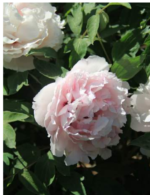
Rockii-Flare Firework (Jing Su Fen) | Mid.