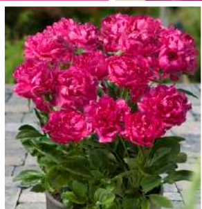
Patio Peony™ London