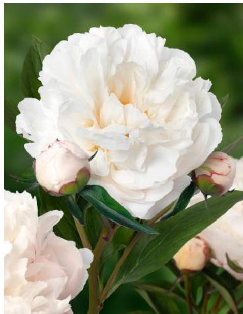
Steve's Choice (-)