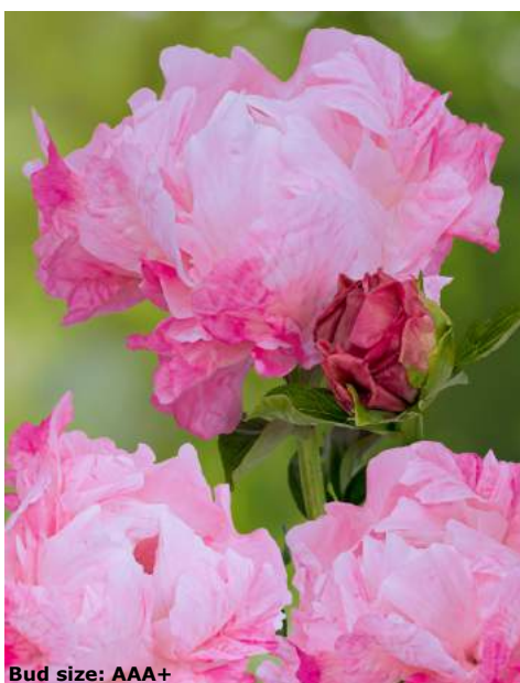
Pink Choice (2019)