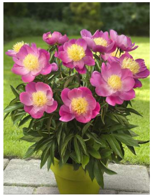
Patio Peony™ Kiev Mid.