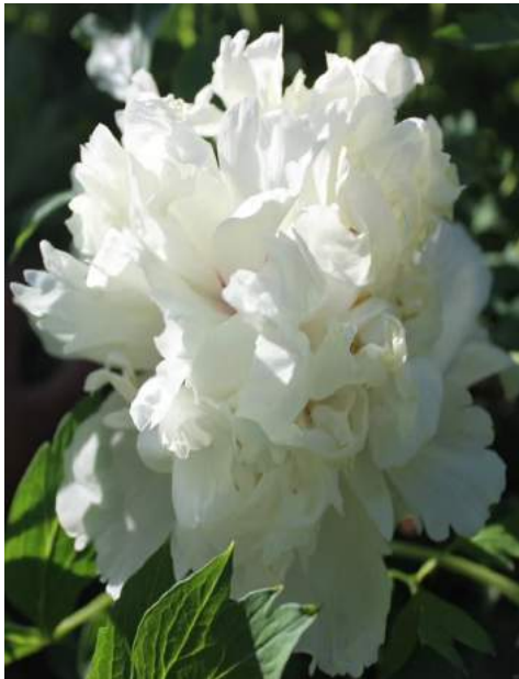
Rockii-Flare Whitewash (Ping Ding Iv) | Mid.