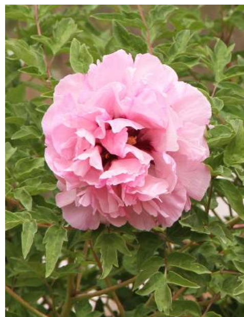
Rockii-Flare Pants (Jing Ming Fen) | Mid.