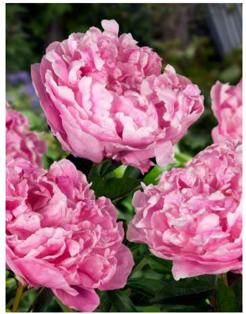
Alexander Fleming (<1950) Mid. | Pot