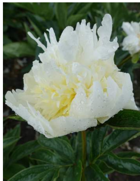
Bride's Dream (1965)