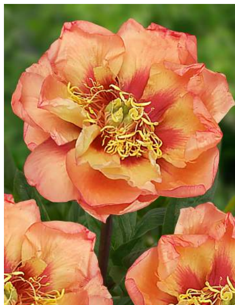
itoh Orange Victory (2001)