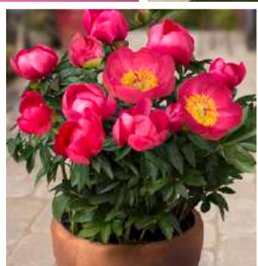
Patio Peony™ Oslo