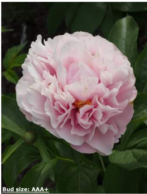
Sky Dance (2017) Very early