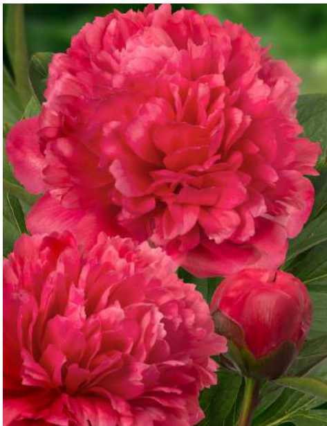
Lorelei (1996) Early - mid.