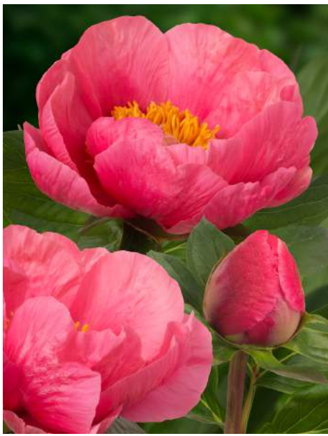
Lovely Rose (1942) Early | Pot