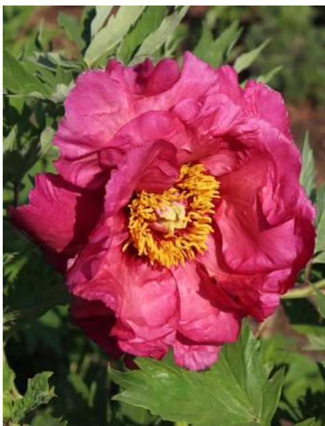
Lutea Tropical Mid.