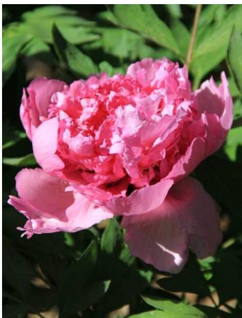
Rockii-Flare Gentle Touch (Qian Zi Bai Tai) | Mid.