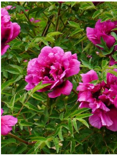
Rockii-Flare Rebel (Gao Yuan Sheng Huo) | Mid.