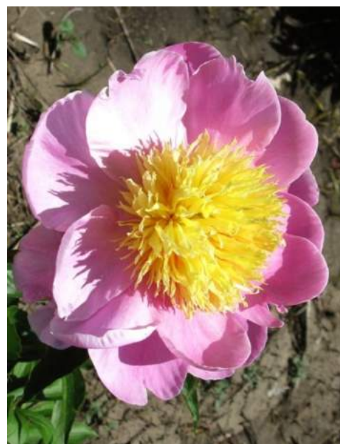
Nippon Gold (1929)