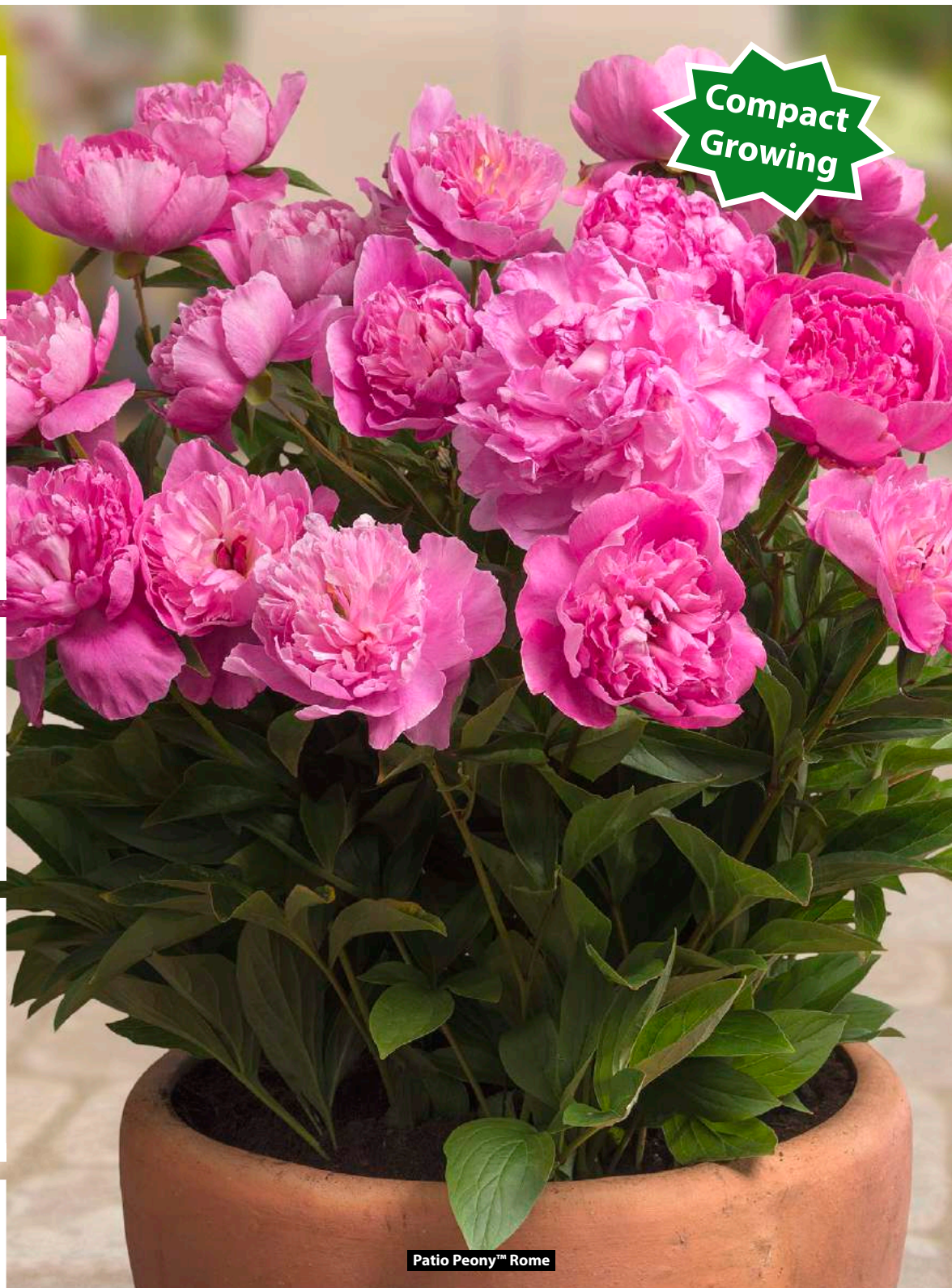
Patio Peony™ Rome