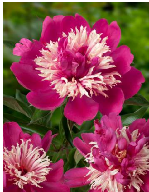
Top Hat (1971)