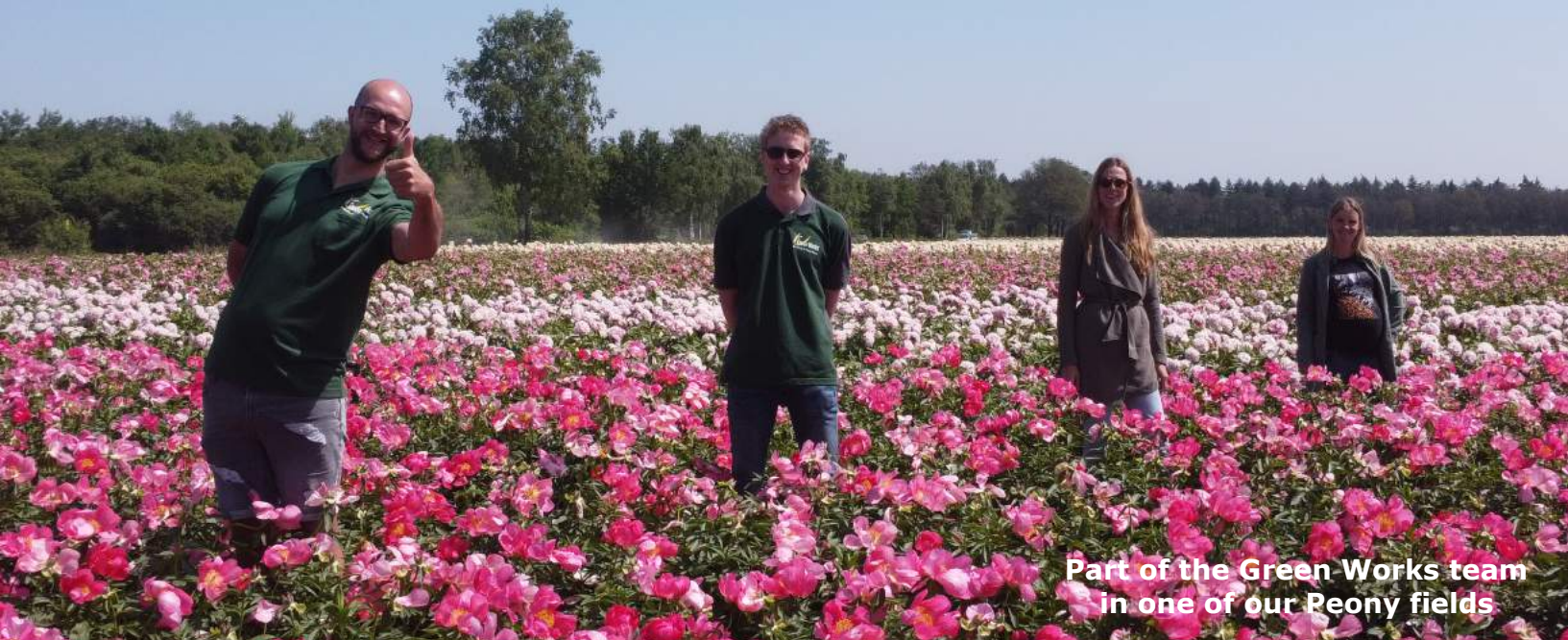
Part of the Green Works team in one of our Peony fields