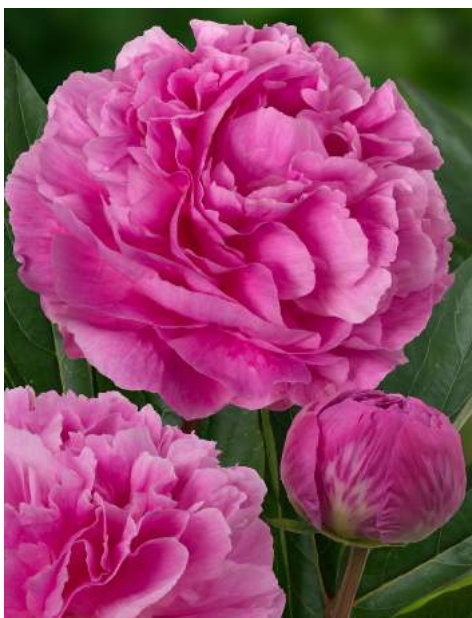
Think Pink (2000)