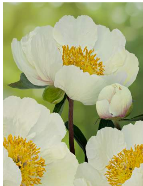
Claire de Lune (1954)