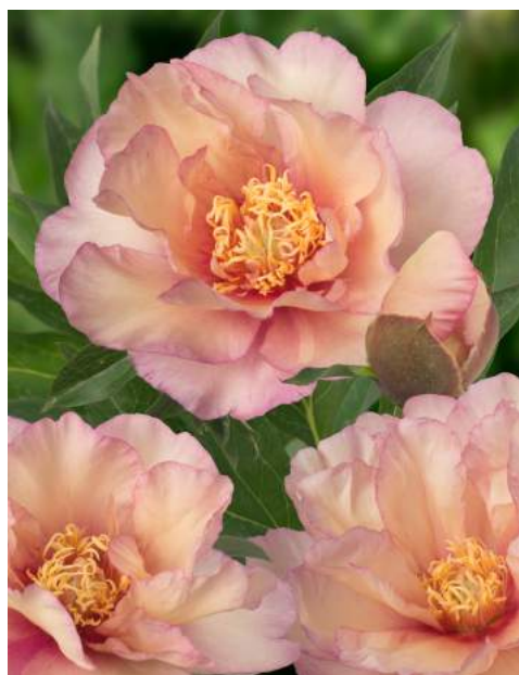
itoh Pastel Splendor (1996)