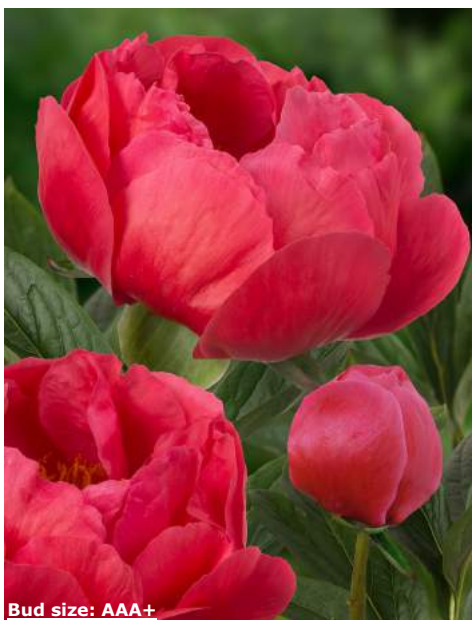
Coral Magic (1998)