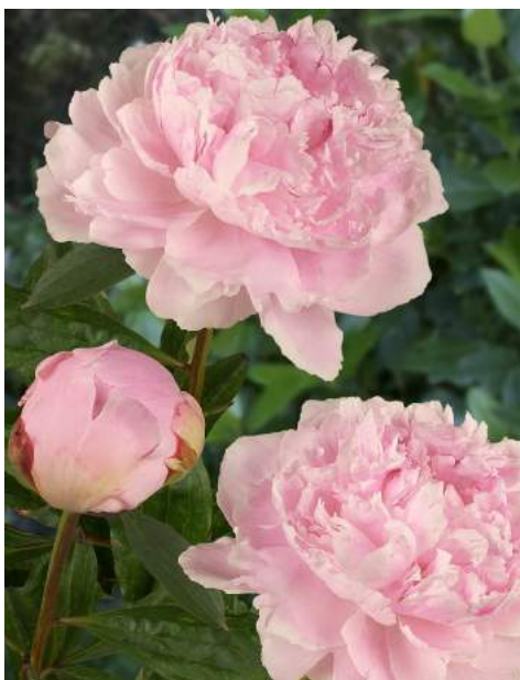
Sarah Bernhardt (1906) Late | Pot