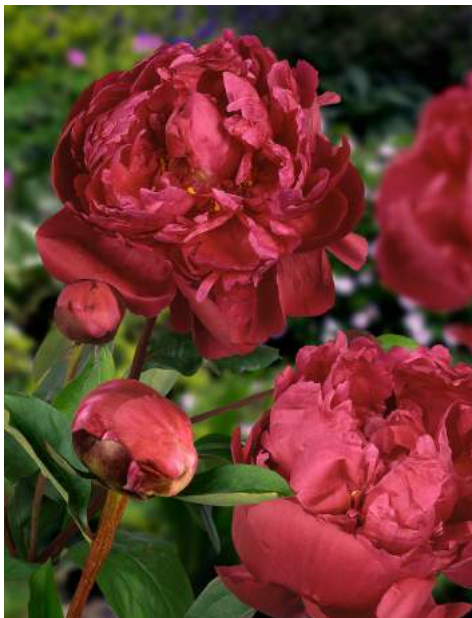
Red Sarah Bernhardt (1970) | Mid.