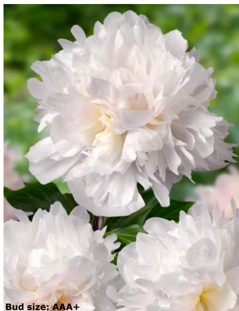
Missie's Blush (1994)