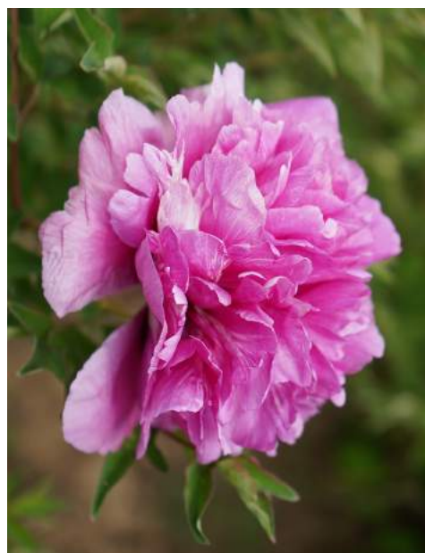
Rockii-Flare Dream (Jing Zui Mei) | Mid.