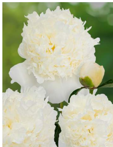
Princess Bride (1988)