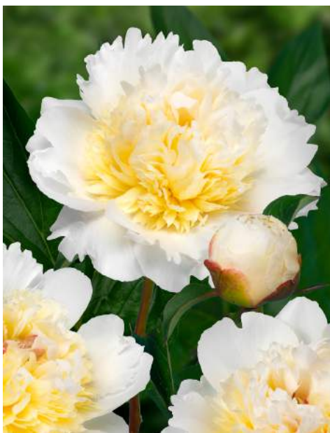
Bridal Grace (1999)