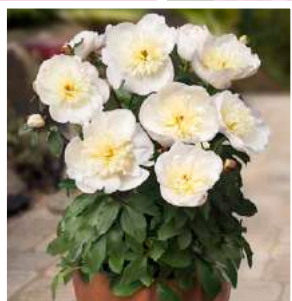
Patio Peony™ Madrid