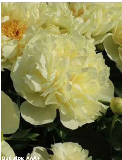
Seidl's Super (2015) Very early