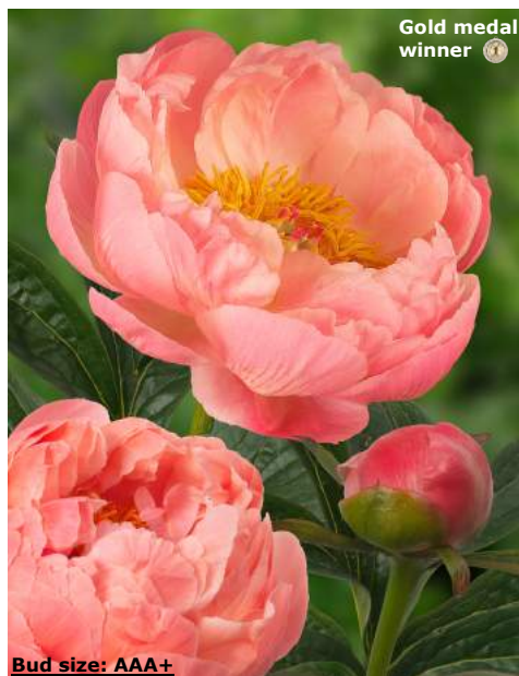
Coral Charm (1964)