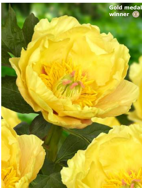
itoh Garden Treasure (1984) Mid. | Pot