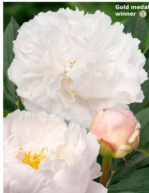
Miss America (1936)