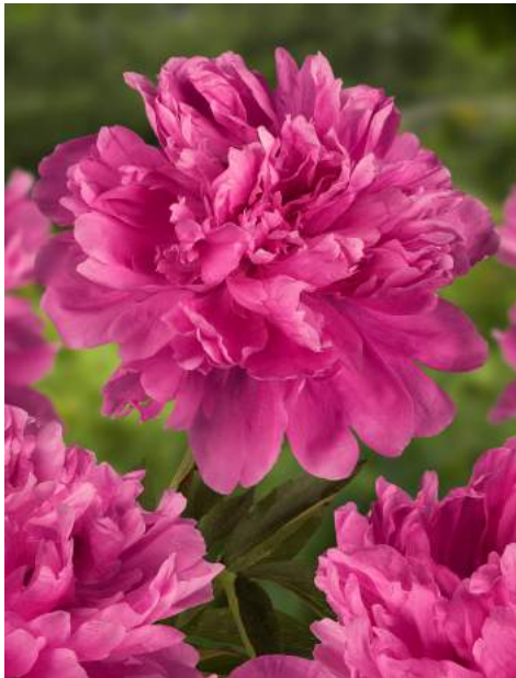
Amabilis (Pink Panther) 1978) Early - mid. | Pot