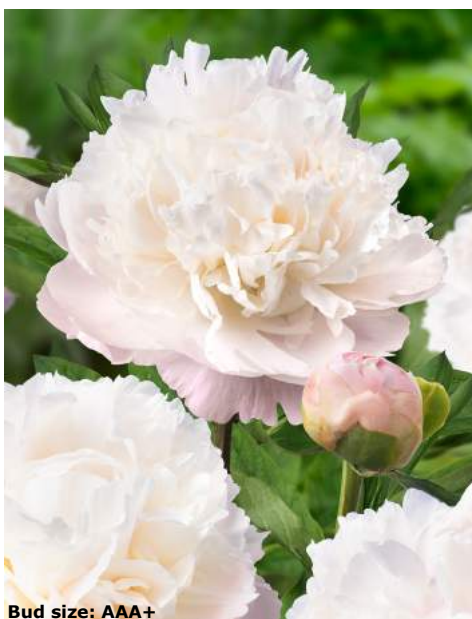
Moon over Barrington