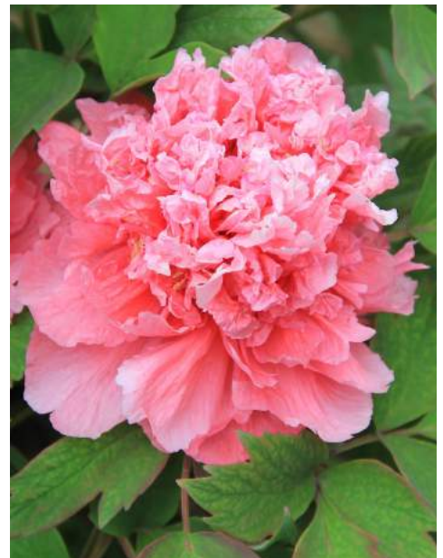
Suffruticosa Pink Sky (Hu Hong) | Mid.