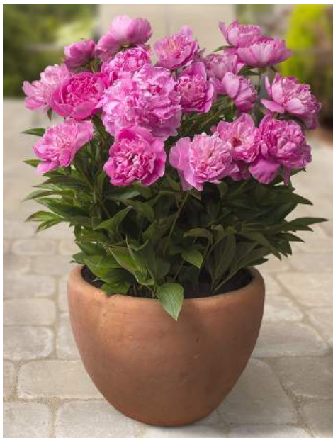
Patio Peony™ Rome Mid.