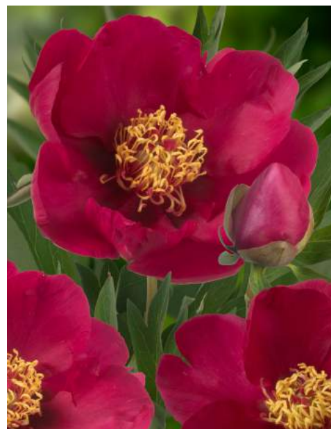
itoh Tolomeo Nr. 59 (2012) Mid. | Pot