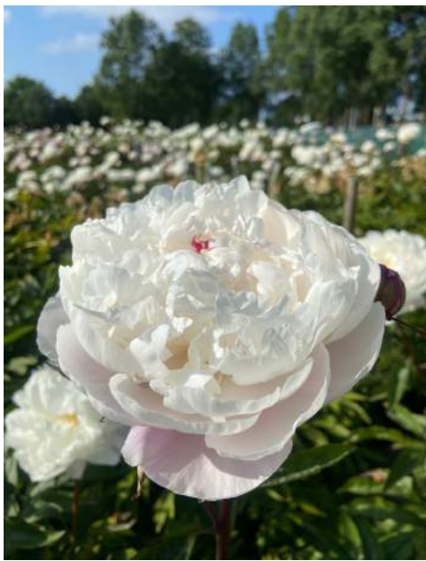
Vogue (1949) Mid.