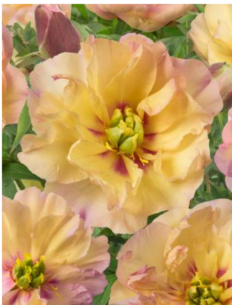
itoh Canary Brilliants (1999) Mid. | Pot