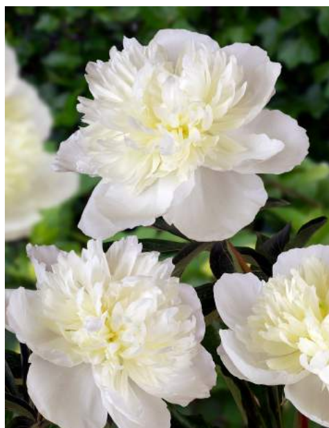
Duchesse de Nemours