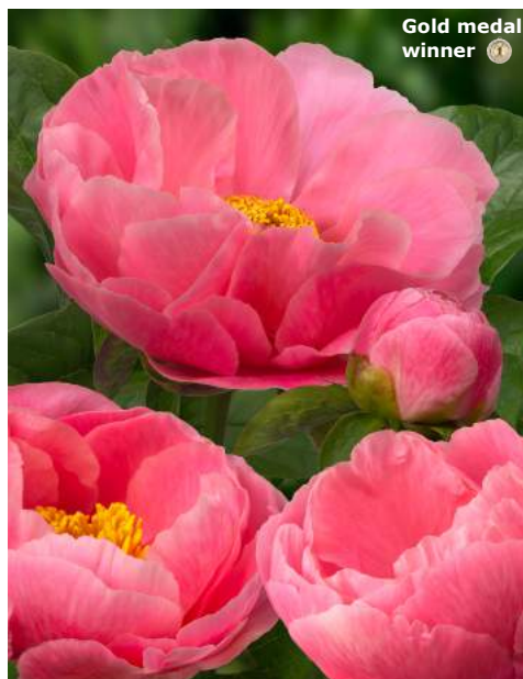
Salmon Dream (1979) Very early | Pot