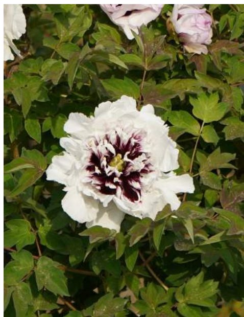
Rockii-Flare Eagle Wings (Jing Yu Tian Cheng) | Mid.