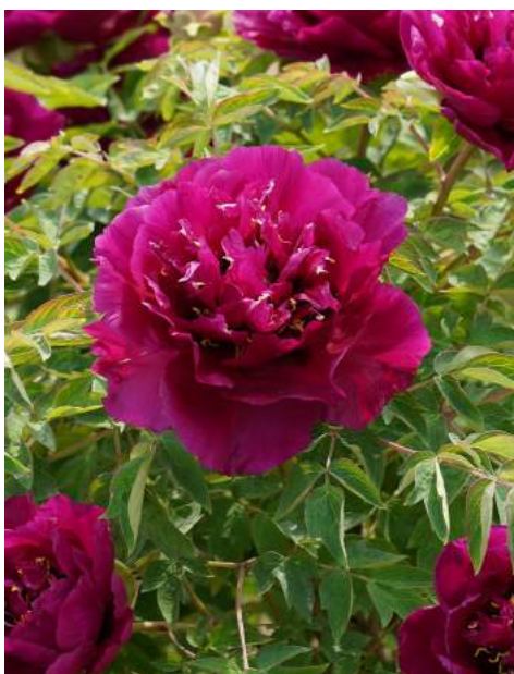
Rockii-Flare Dark Horse (Jing Mo Sa Jing) | Mid.