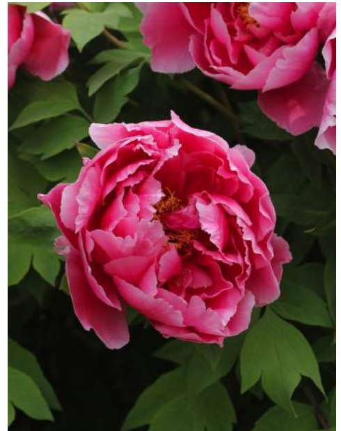
Suffruticosa Dragon Wing (Xin Qi Fu Shen) | Mid.