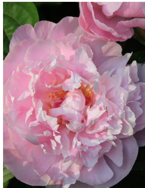
Sweet Rewards (2003)