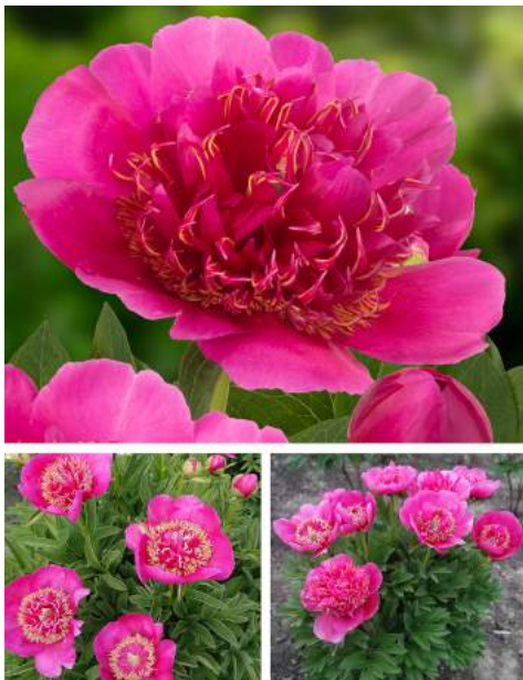
Anemoniflora (<1900) Very early | Pot