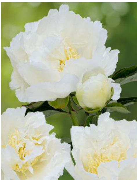
Aphrodite Kiss (2003)