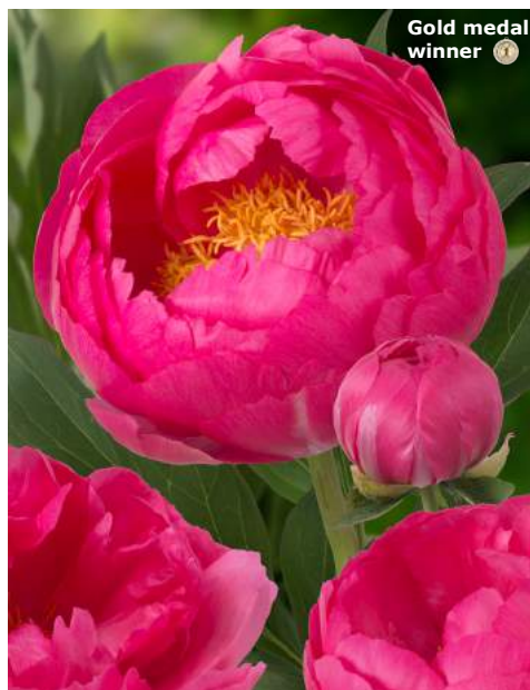
Cytherea (1953) Early - mid.