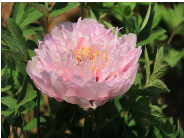
Rockii-Flare Heavenly Pink (Jin Ju Fei)