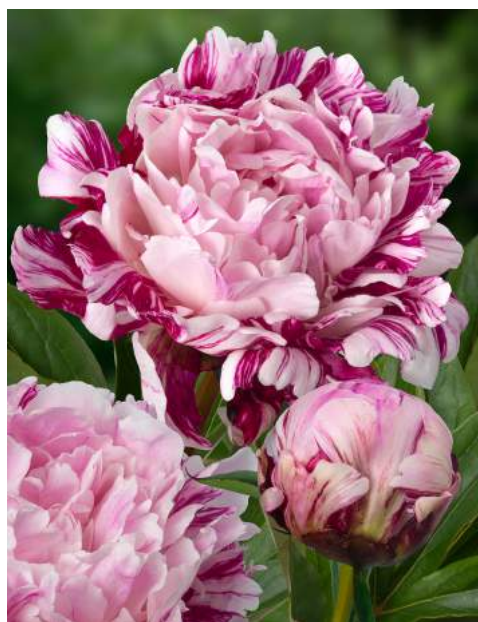
Candy Stripe (1992)