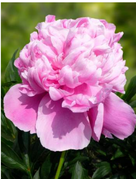
Lady Anna (1856)