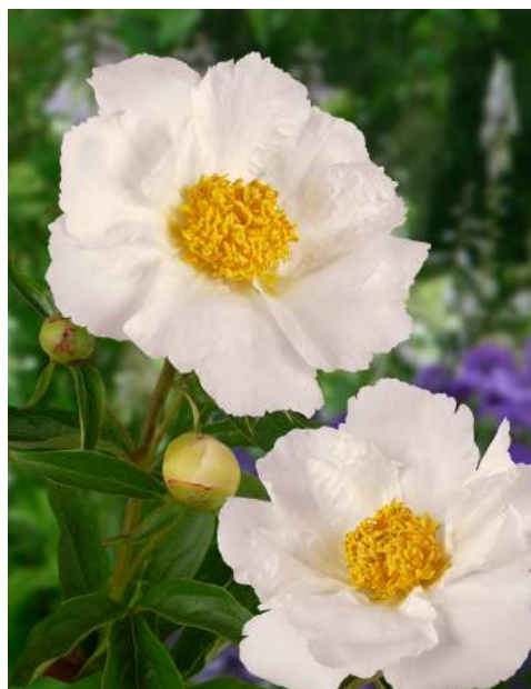
Krinkled White (1928)