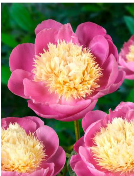
Bowl of Beauty (Globe of Light)