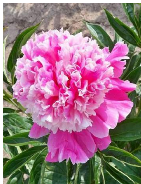
He's My Star (2000)