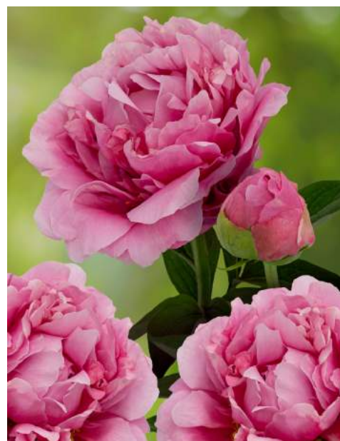
Kathy's Touch (2009)