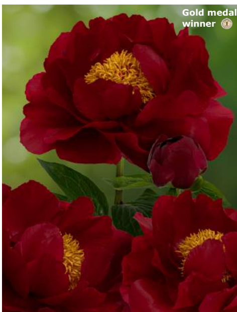
Mackinac Grand (1992)