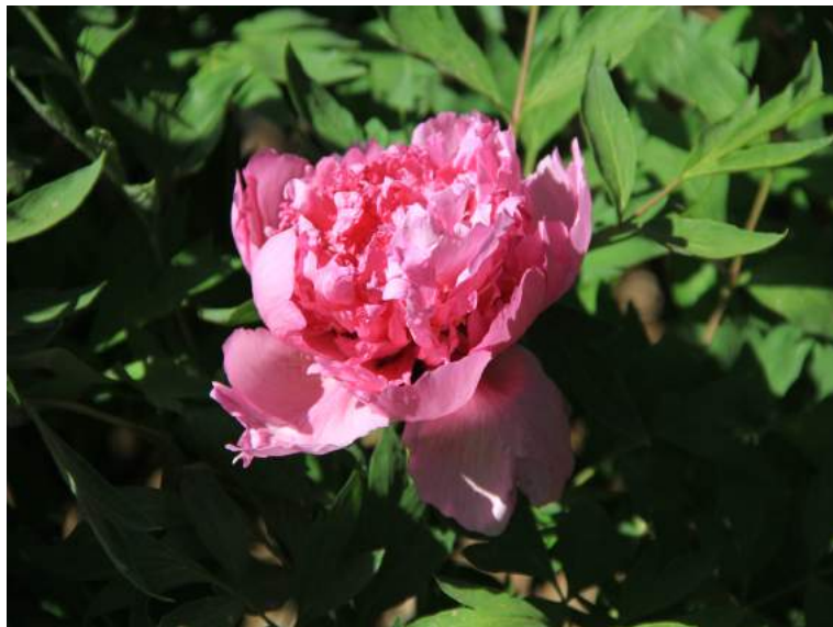
Rockii-Flare Gentle Touch (Qian Zi Bai Tai)