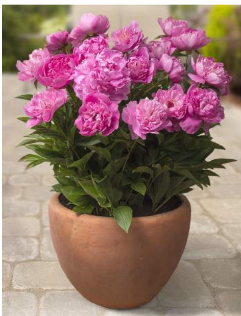
Patio Peony™ Rome Mid.