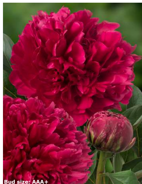
Red Magic (1950)