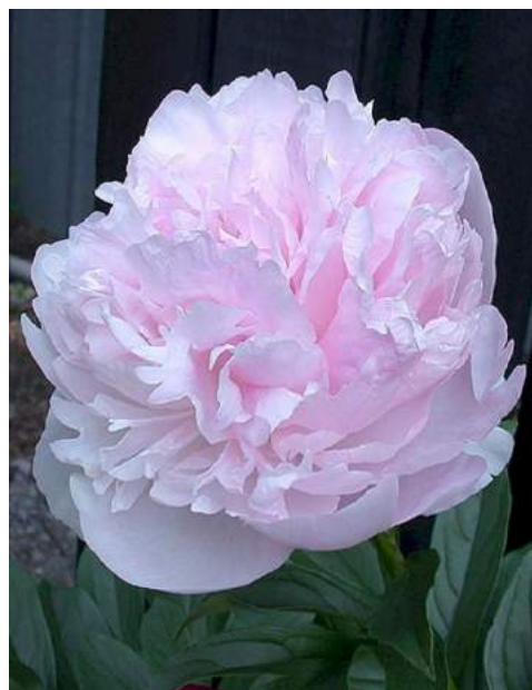
Lady Orchid / Pink Diamond (1942)