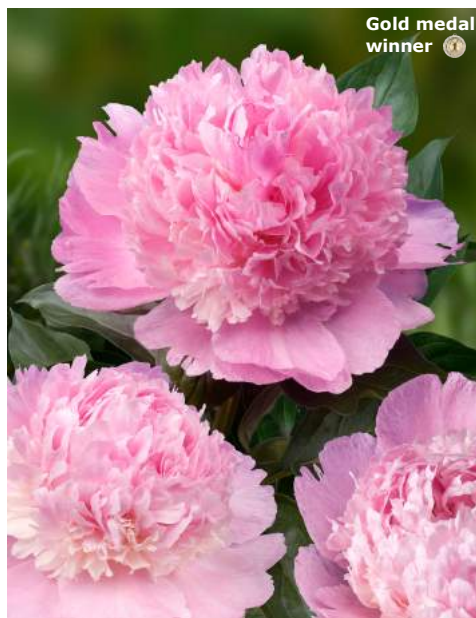
Angel Cheeks (<1975)