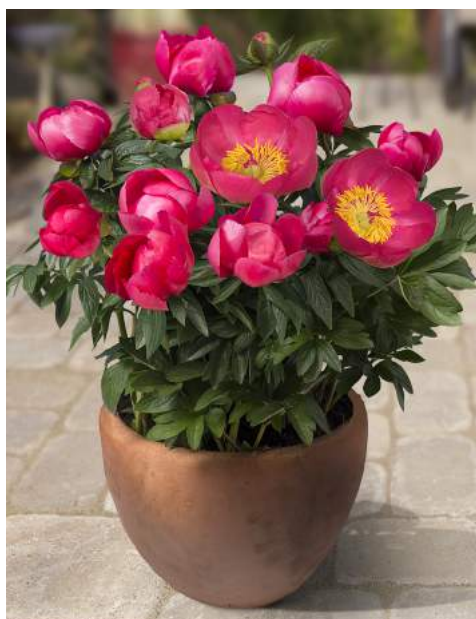
Patio Peony™ Oslo Very early