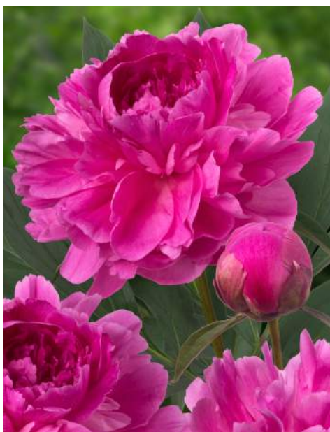
Bunker Hill (1906)