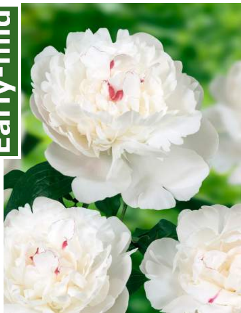
Festiva Maxima (1955)