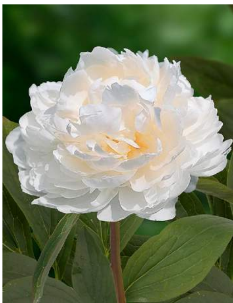
White Ivory (1981)