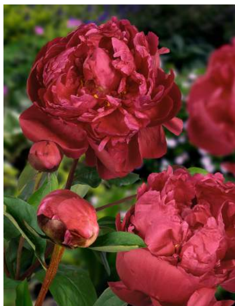
Red Sarah Bernhardt (1970) | Mid.