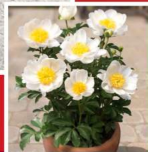
Patio Peony™ Dublin