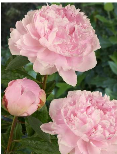
Sarah Bernhardt (1906)