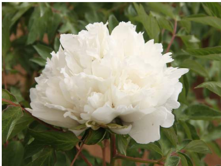
Rockii-Flare Carte Blanche (Jing Yun Guan)