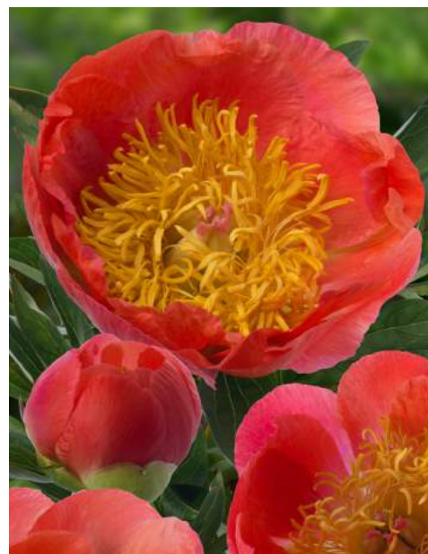
Coral Supreme (1981)