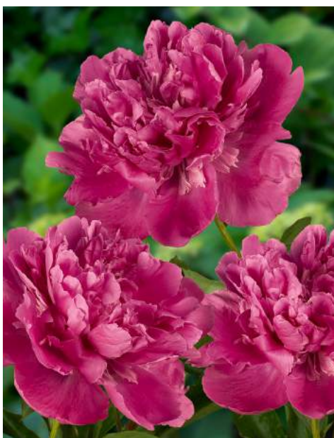
Edulis Superba (1824)