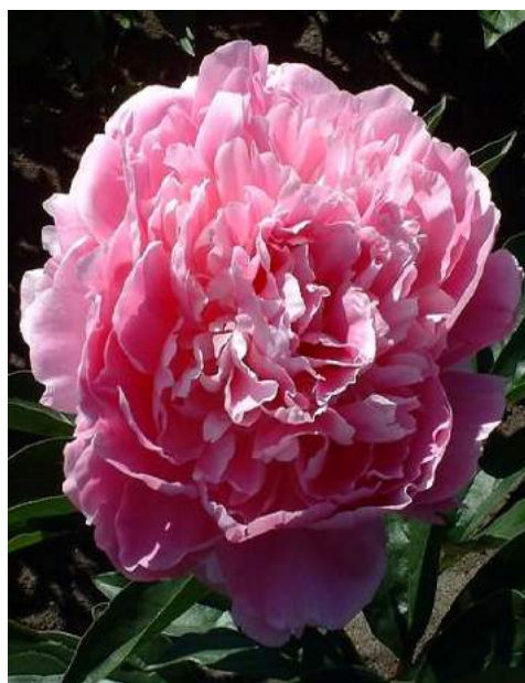
Pink Giant (1966)