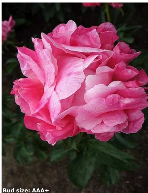
Pink Choice (2019)