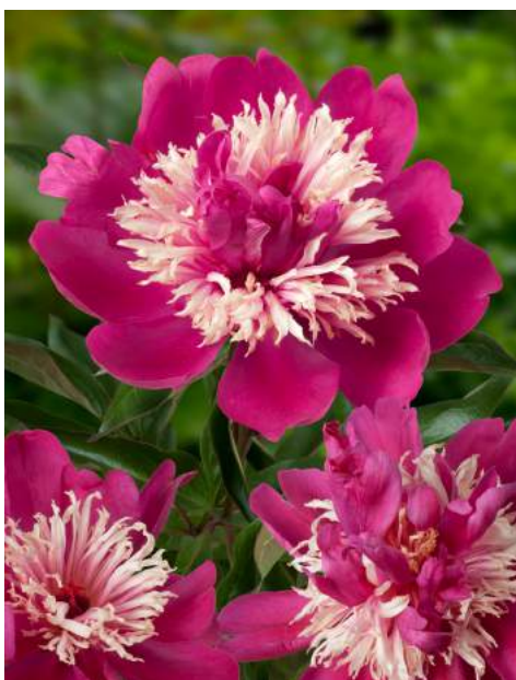
Top Hat (1971)