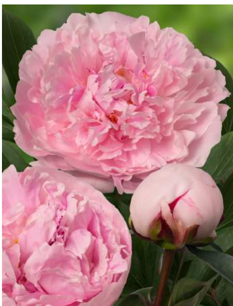
Reine Hortense (1857)