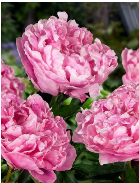
Alexander Fleming (<1950)