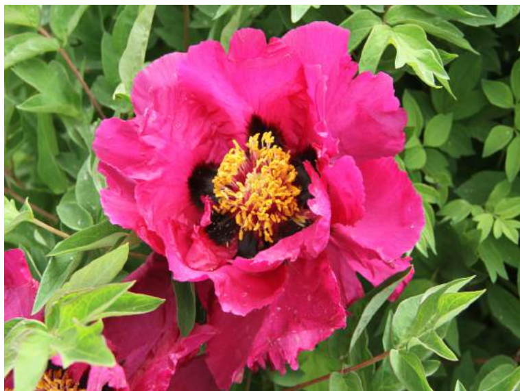
Rockii-Flare Sweet Magic (Jing Hong Fei He)