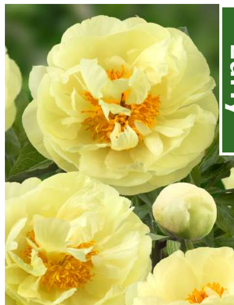
Lemon Chiffon (1981)