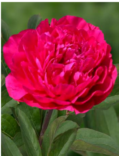
Glory Hallelujah (1970)