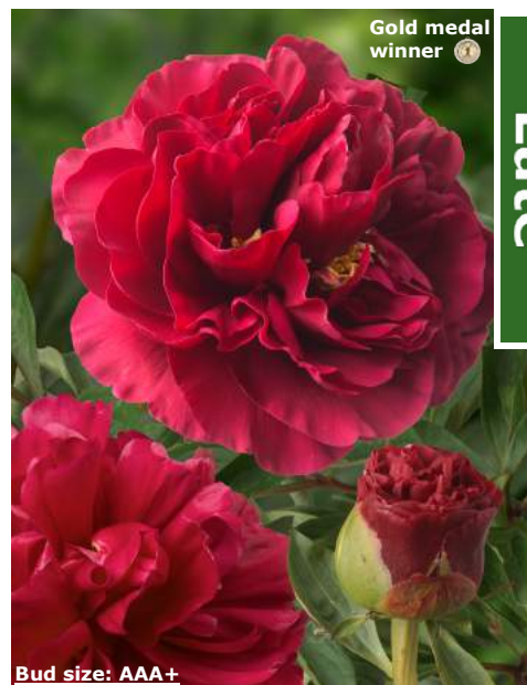
Ole Faithful (1964)