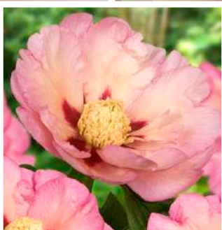
Itoh Pastel Splendor