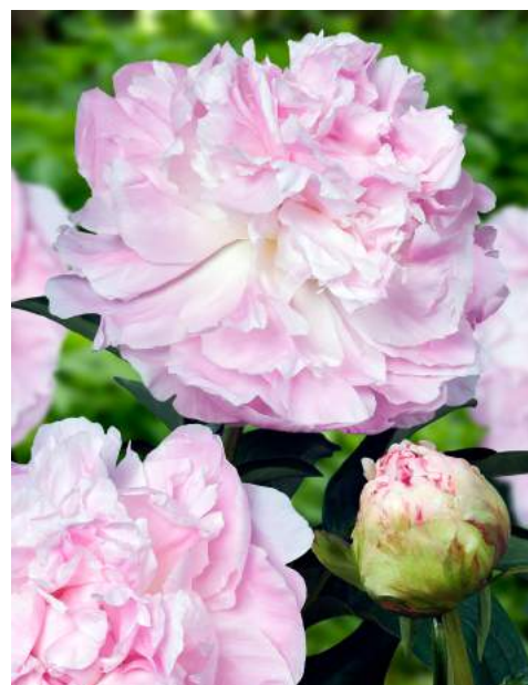
My Love (1992)