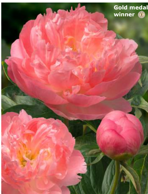
Pink Hawaiian Coral (1981)