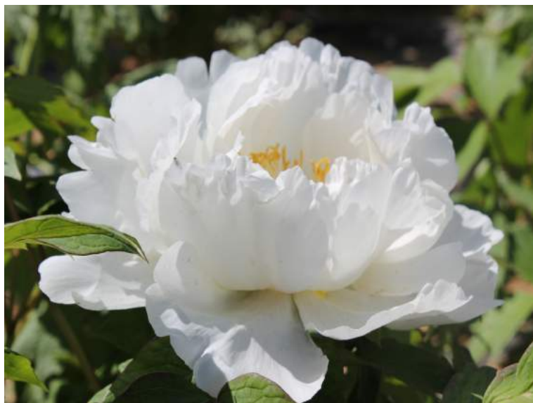
Suffruticosa Bright Prince (Bai Wang Shi Zi)