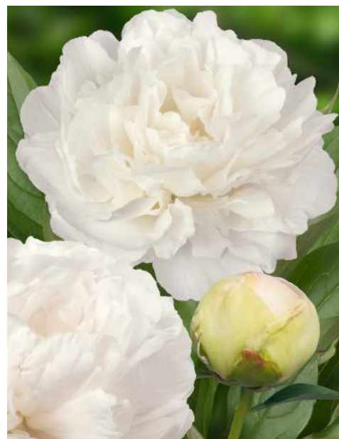
Puffed Cotton (2003)