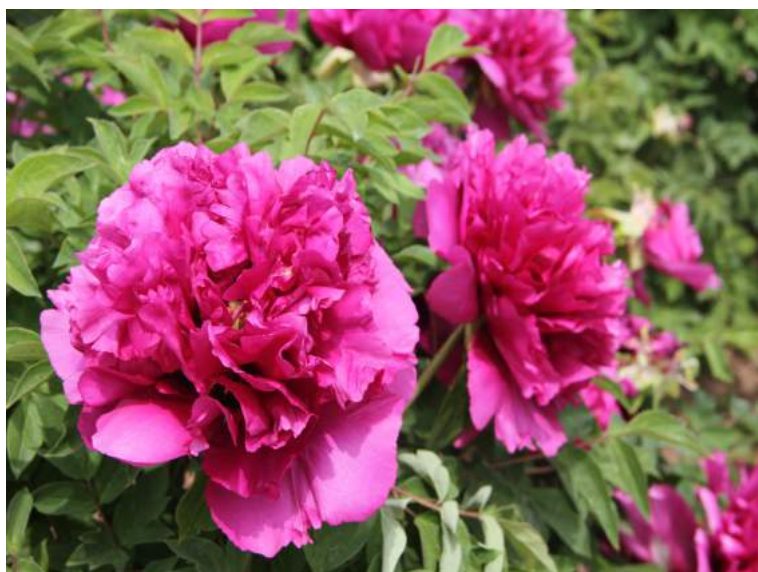
Rockii-Flare Noble Crown (Jing Zi Guan Yin Xian)