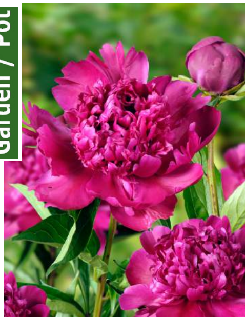
Big Ben (1943) Early - mid. | Garden