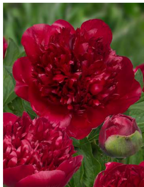
Christmas Velvet (1992)