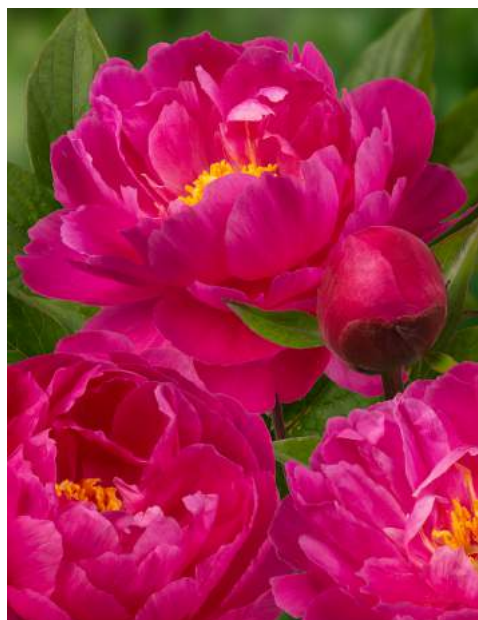
Nice Gal (1965) Early - mid.