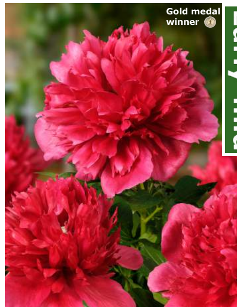
Many Happy Returns