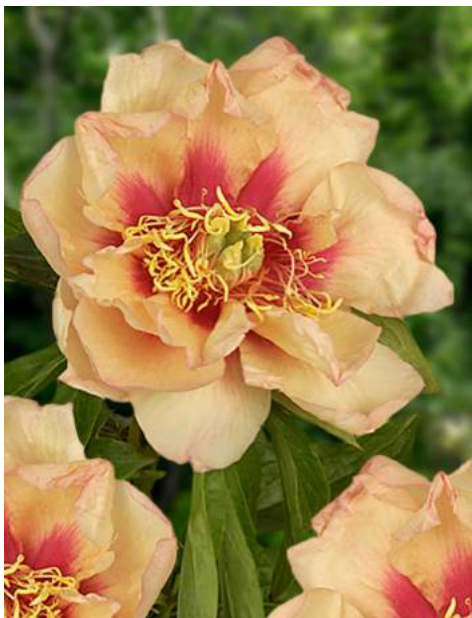
itoh Callie's Memory (1990)