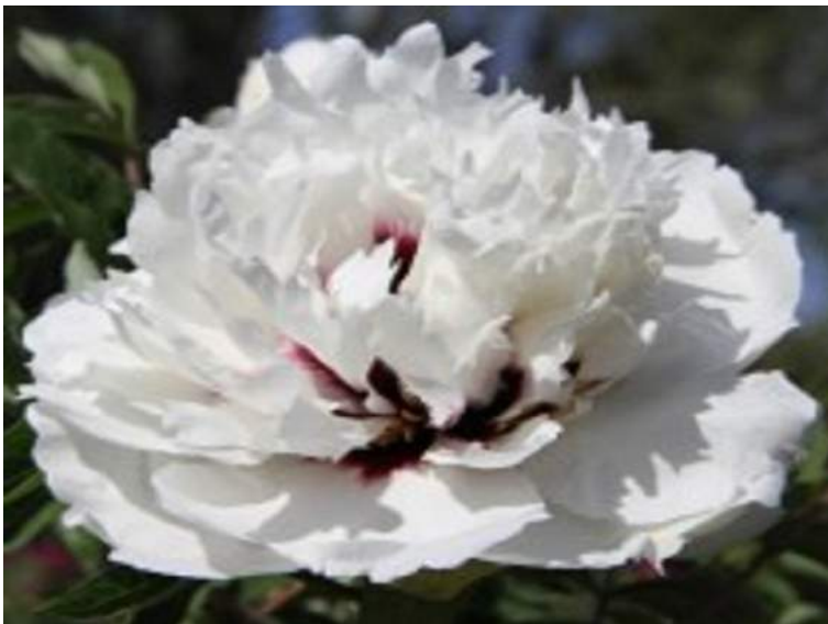
Rockii-Flare Double Delight (Jing Yun Xiang)