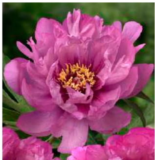
Itoh First Arrival