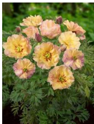
Paeonia itoh Canary Brilliants