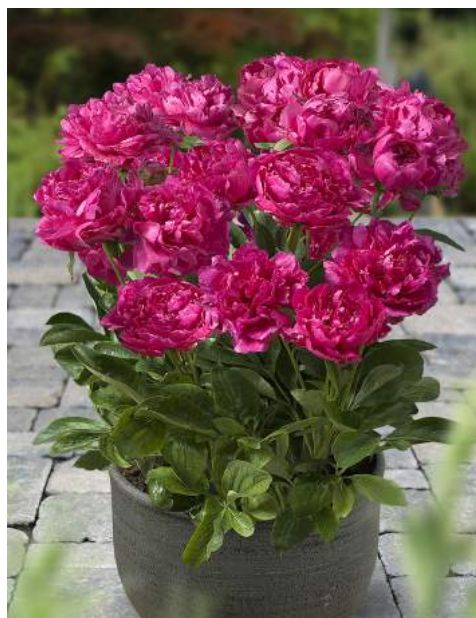
Patio Peony™ London Early