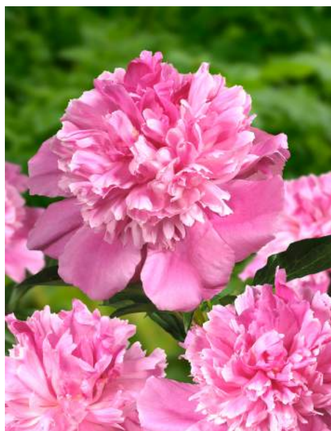
Bouquet Perfect (1987)