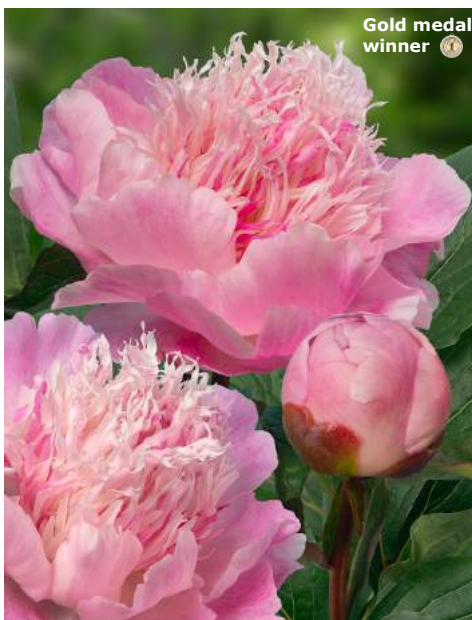
Do Tell (1946) Mid. | Garden