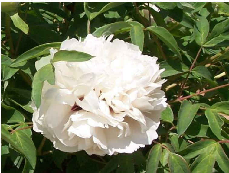
Rockii-Flare White Cracker (Jing He Gui)