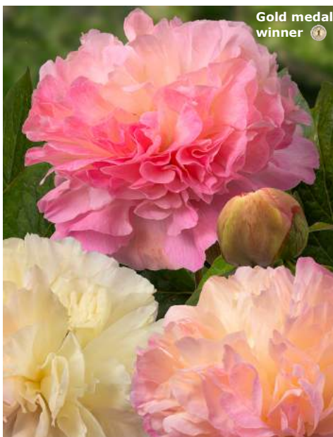
Lois' Choice (1993)