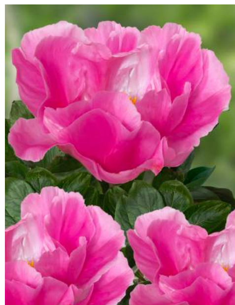
Terrific Gal (1995)