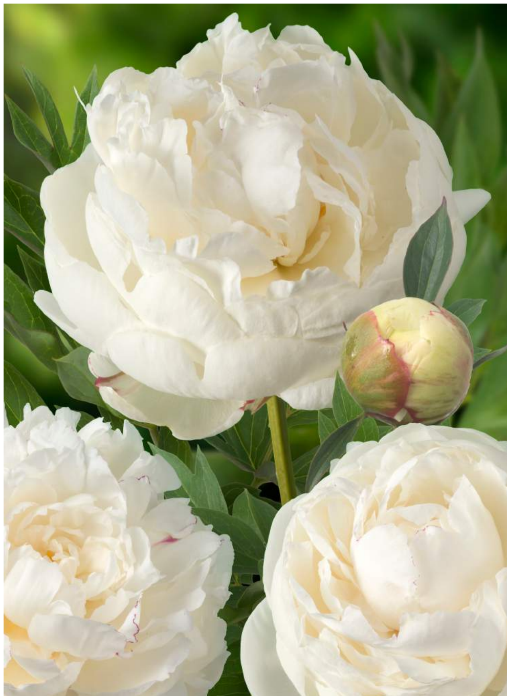
Snow Mountain (1946)