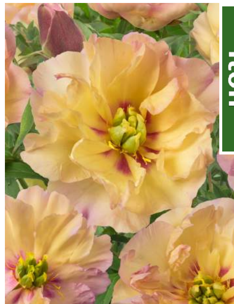
itoh Canary Brilliants (1999)