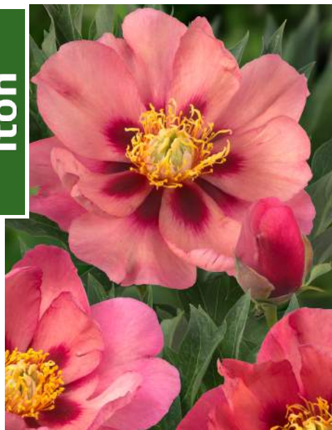
itoh Old Rose Dandy (1993) Mid.