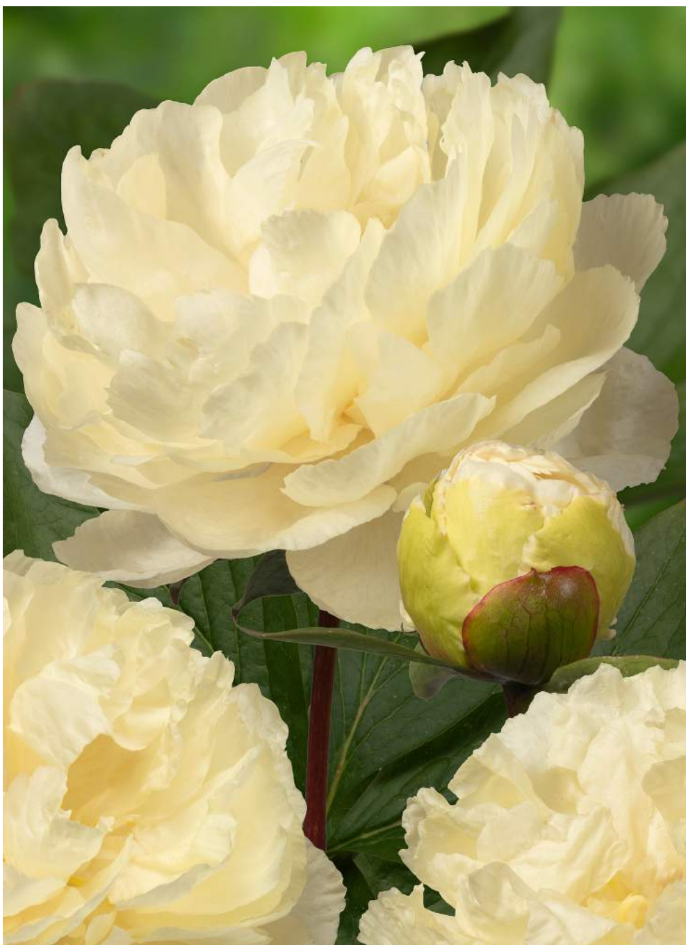
Sunny Girl (1985)