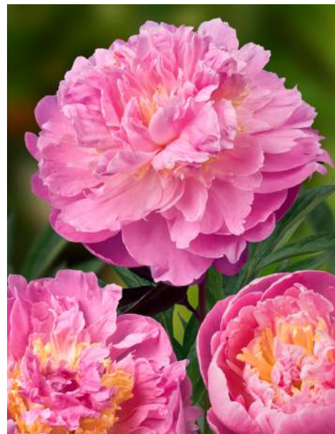
Bella Donna (1935)