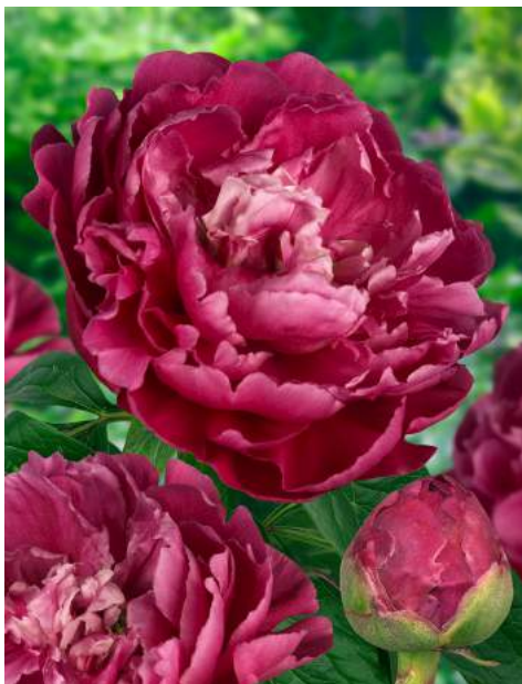
Louis van Houtte (1867)