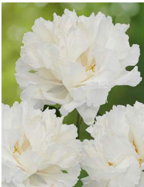
Grand Massive (2003)