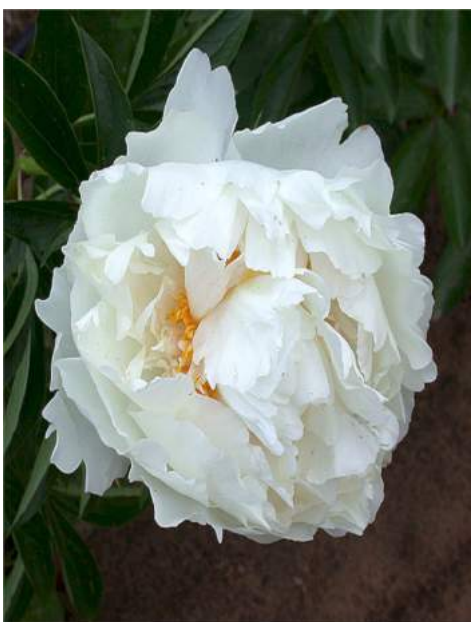
Marshmallow Puff (1986)