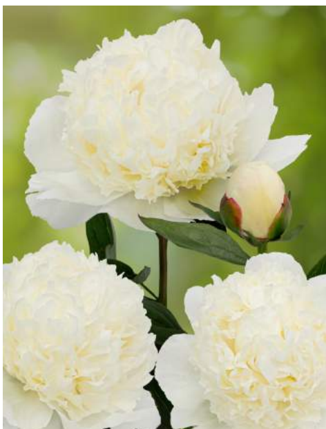
Lancaster Imp. (1987)