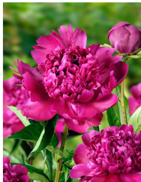
Big Ben (1943)