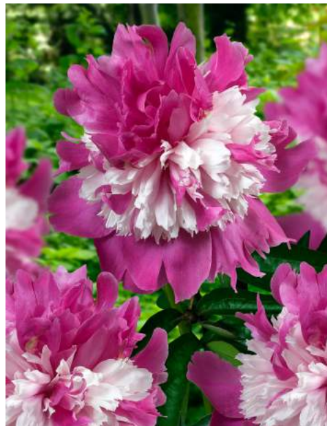
Celebrity (1985) Early - mid. | Garden