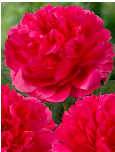
Raspberry Charm (1968)