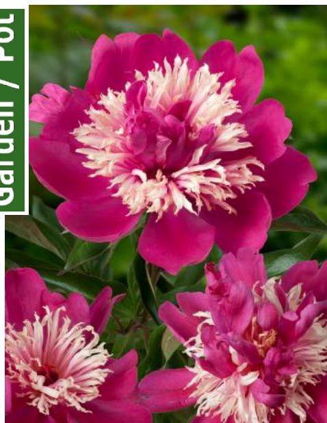
Top Hat (1971) Early - mid.