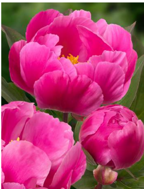
Paladin Candy (1950)