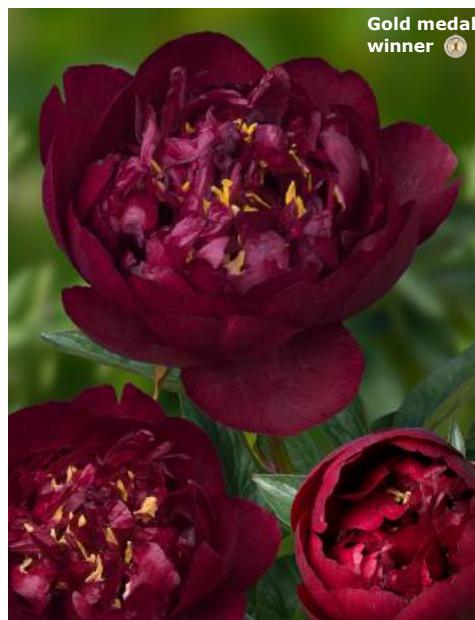
Buckeye Belle (1956) Early | Garden