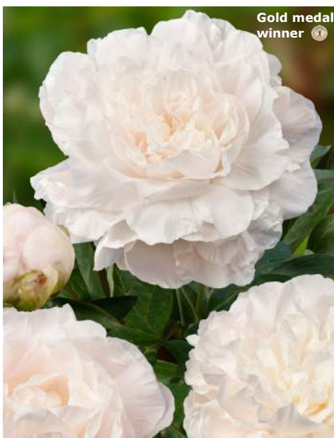
Mother's Choice (1950)