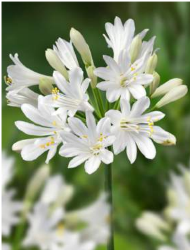
Agapanthus™ Summer Love®