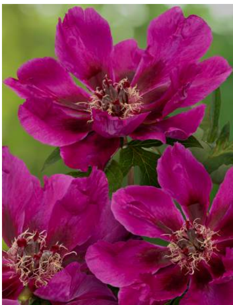
itoh Purple Sensation (1927) Early