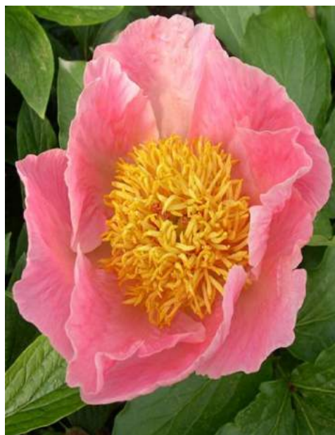
Sugar 'n Spice (1988)