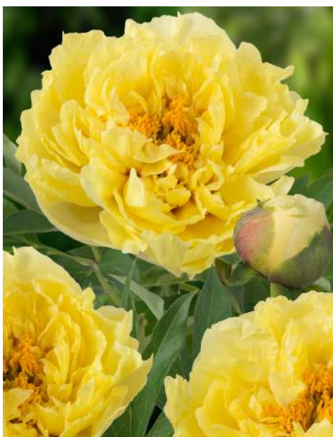
itoh Yellow Crown (1964) Mid.