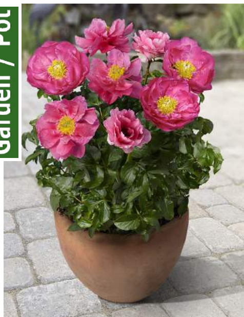
Patio Peony™ Athens Very early