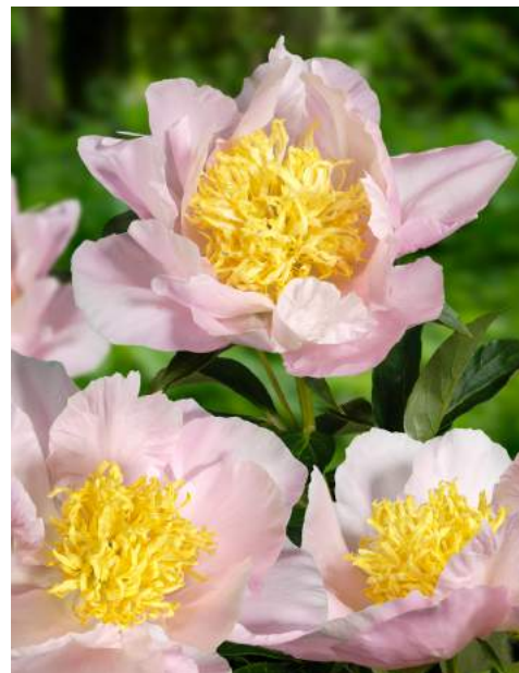
Garden Lace (1992)