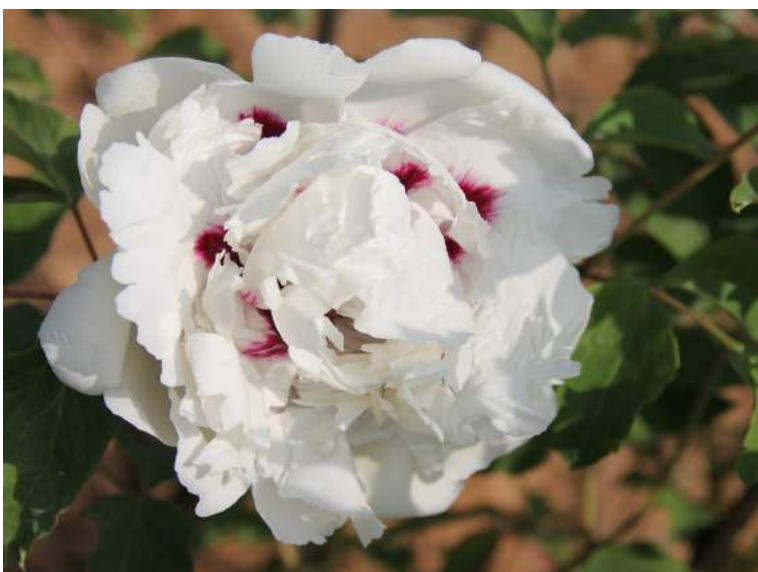
Rockii-Flare Touch of Purple (Jing Xue Juan)