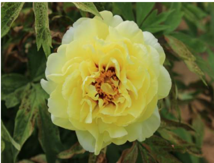
Lutea High Noon