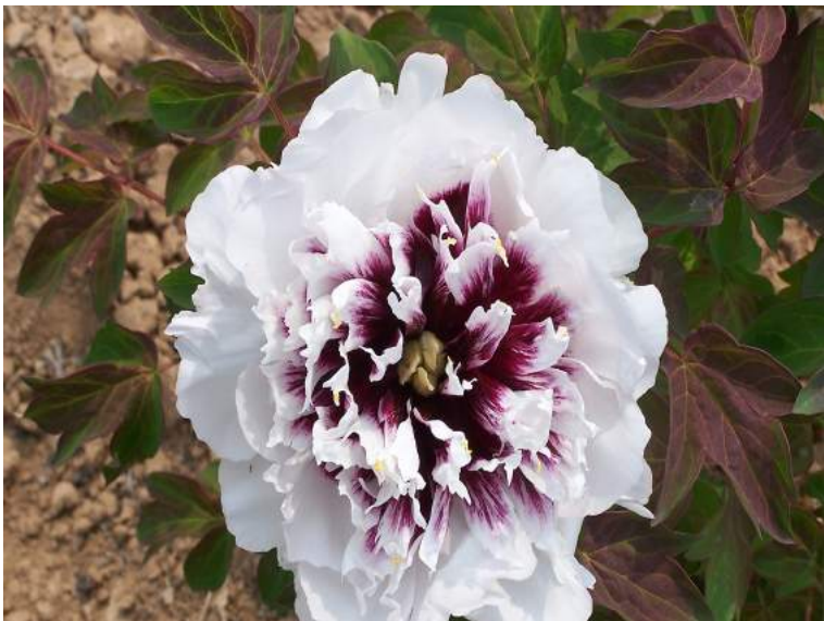
Rockii-Flare Eagle Wings (Jing Yu Tian Cheng)