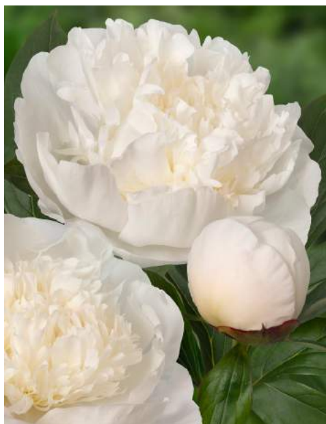
Immaculee (1953) Late