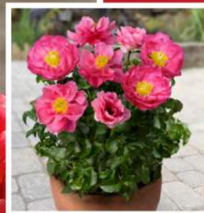
Patio Peony™ Athens