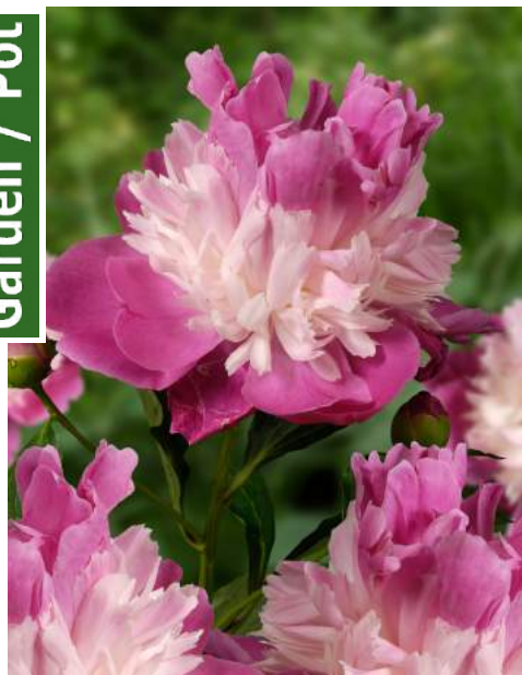
Gay Paree (1933) Early - mid. | Garden