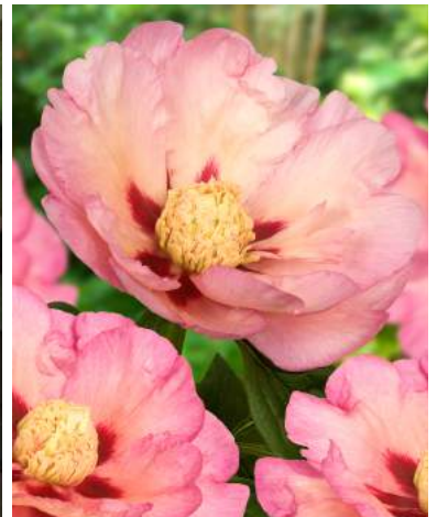
itoh 'Pastel Splendor'