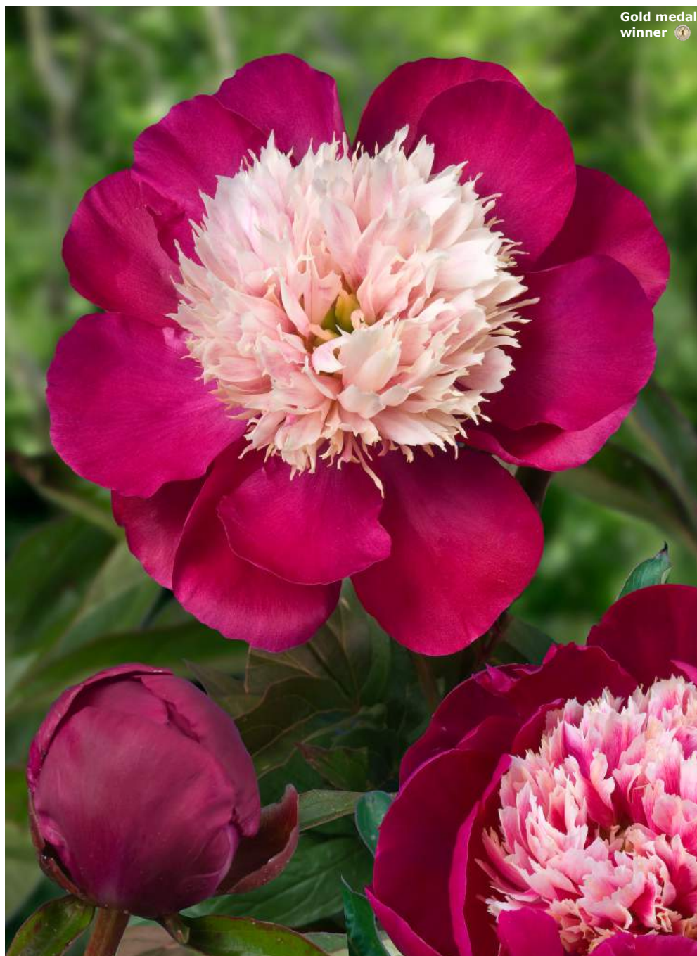
White Cap (1956) Early - mid. | Garden