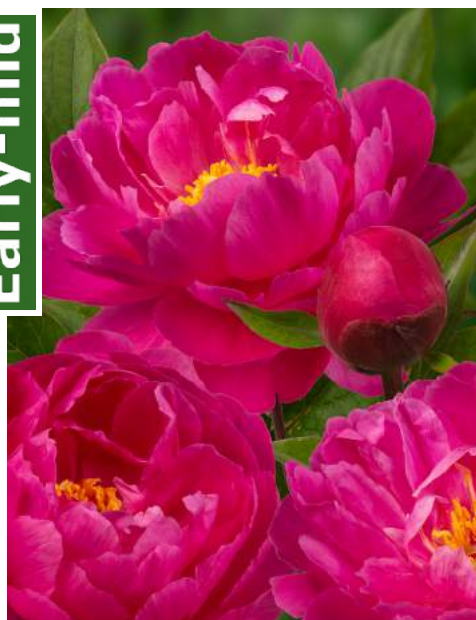
Nice Gal (1965)