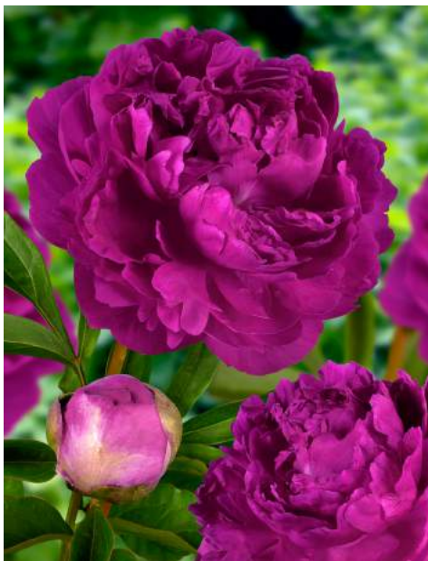
Victoire de la Marne (1915) Mid.