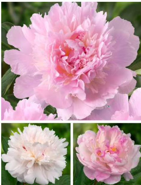
Pecher (Noemie Demay) (1867)