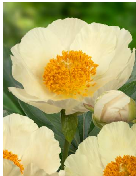
Moonrise (1949) Early