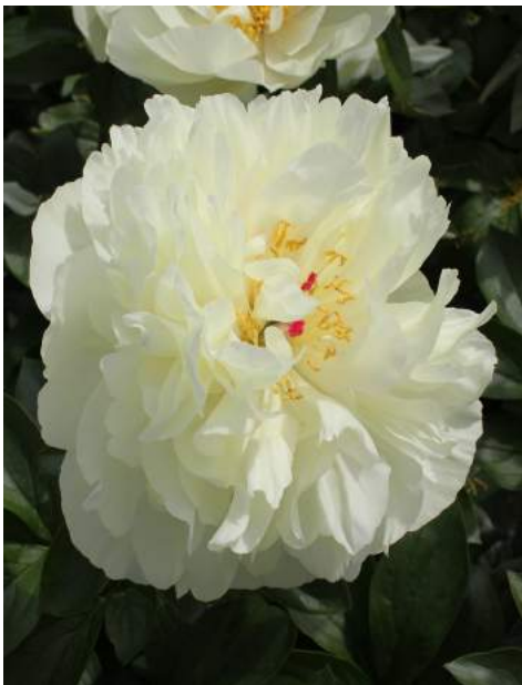
Early Sensation (1988) Early