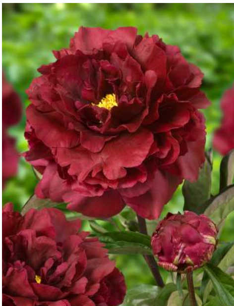
Black Beauty (1924) Mid. | Garden