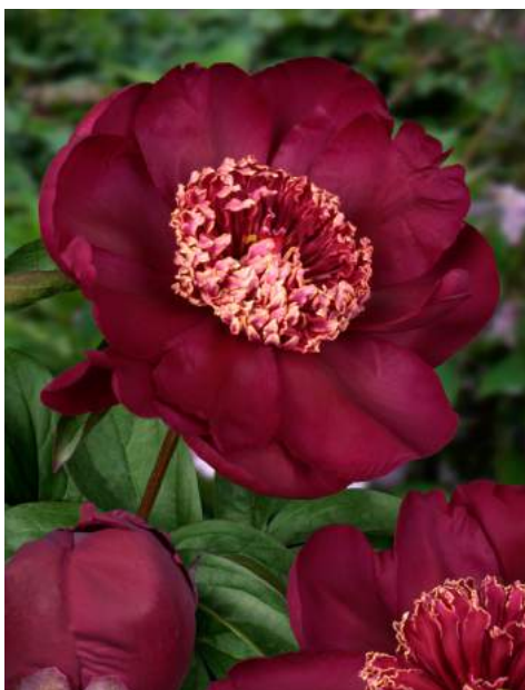
Nippon Beauty (1927)