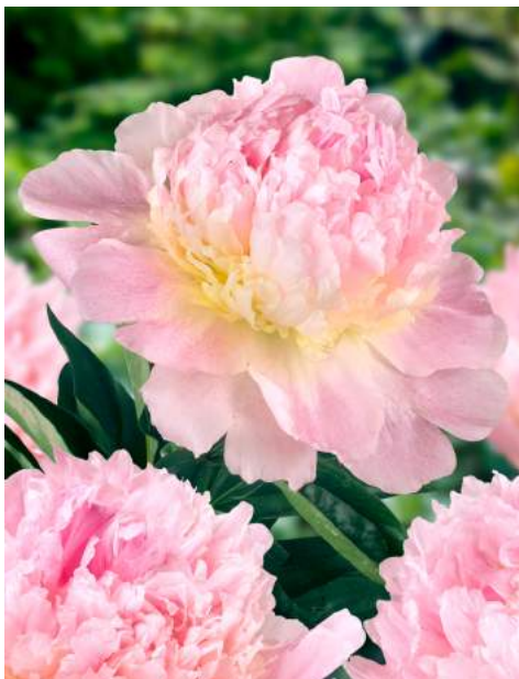
Raspberry Sundae (1968)