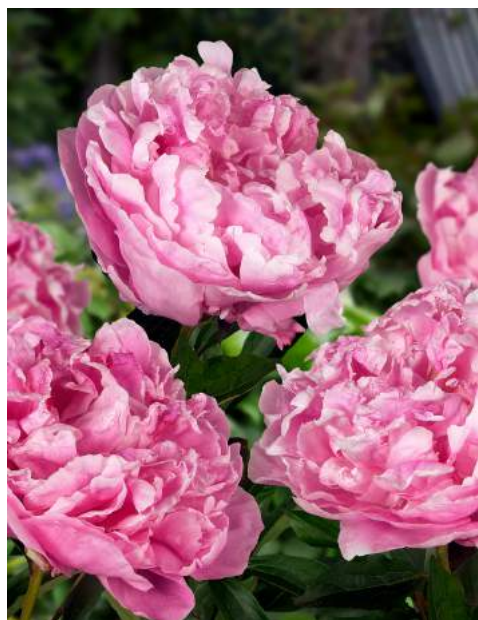
Alexander Fleming (<1950)