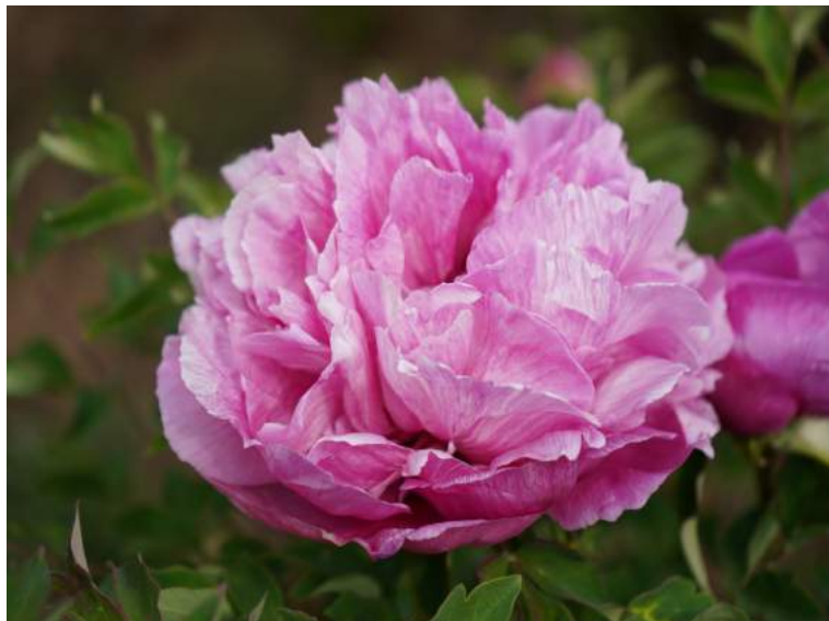
Rockii-Flare Dream (Jing Zui Mei)