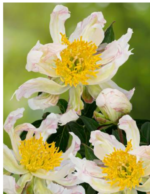
Green Halo (1999)