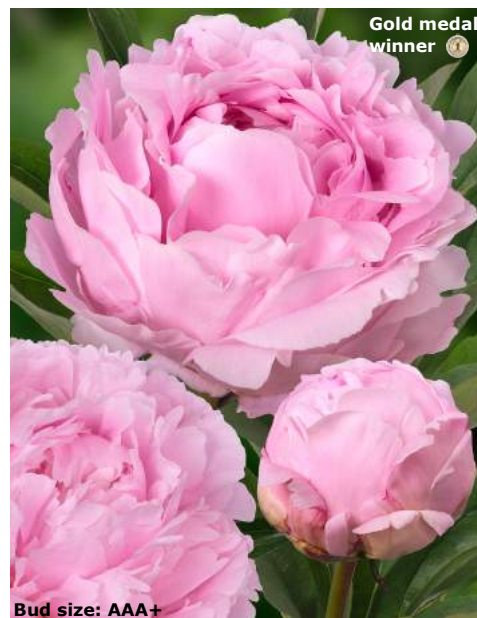
Pillow Talk (1973)