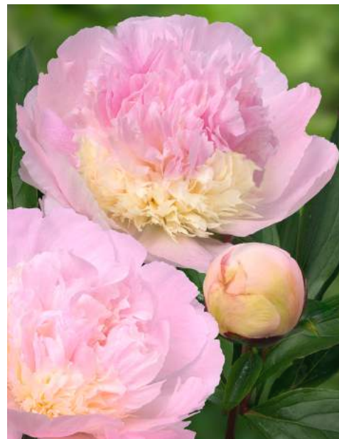
Petticoat Flounce (1985)