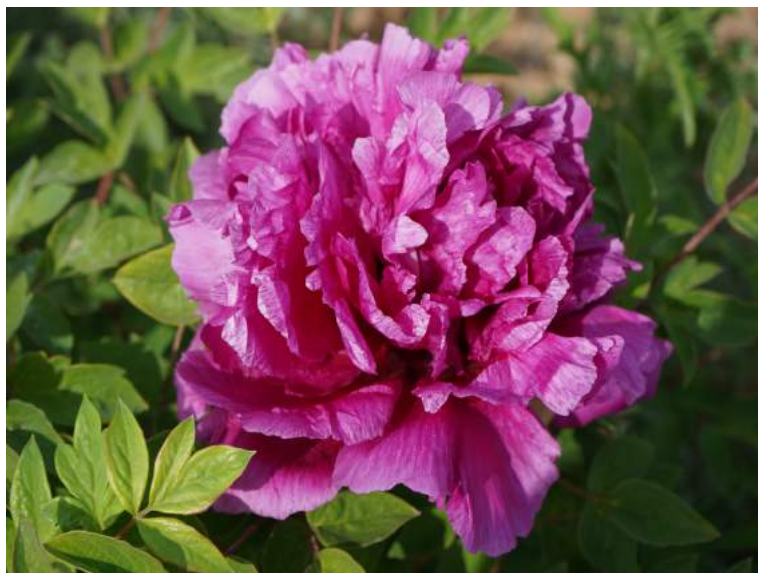
Rockii-Flare Pretty Lady (Jing Cheng Zi)