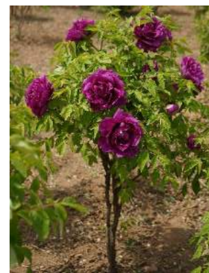
Tree Peony Penny Lane