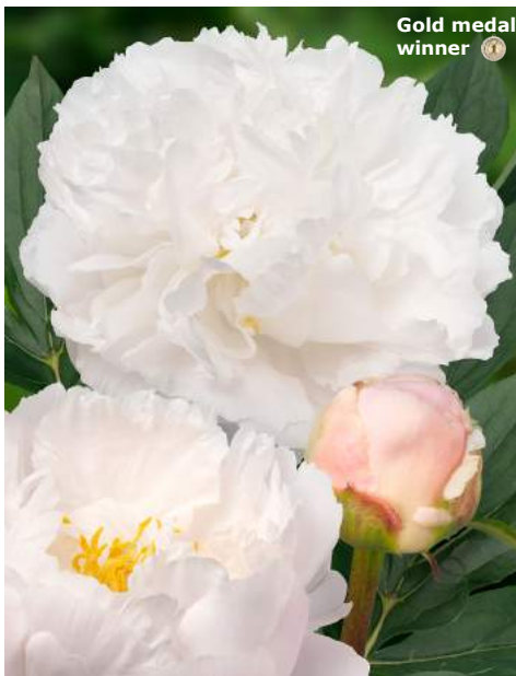
Miss America (1936) Early