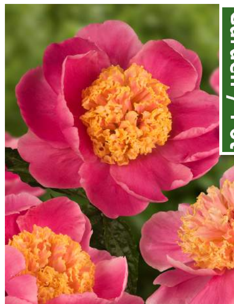
Doreen (1949) Late | Garden