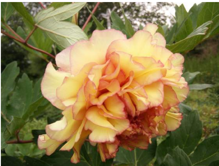
Lutea Souvenir de Maxime Cornu