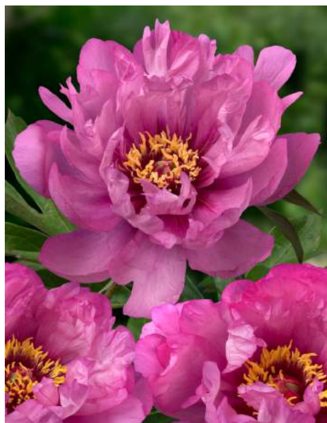
itoh First Arrival (1986)