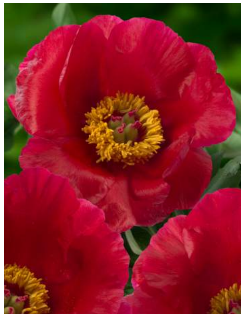
Blaze (1973) Early