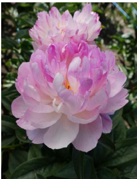
Petite Elegance (1995)