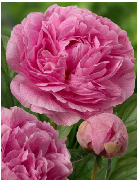
The Fawn (1996)