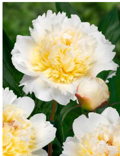
Bridal Grace (1999)