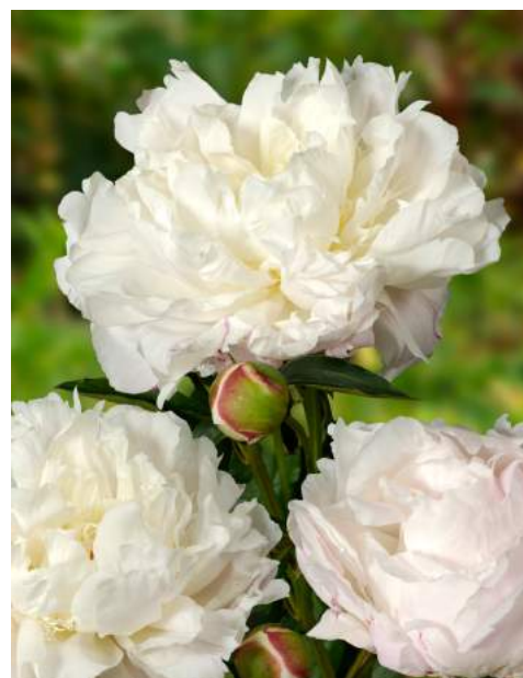
Shirley Temple (<1948)