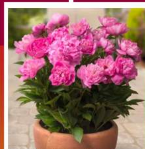
Patio Peony™ Rome