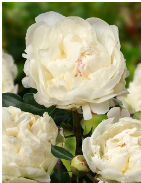
Kelway's Glorious (1909)