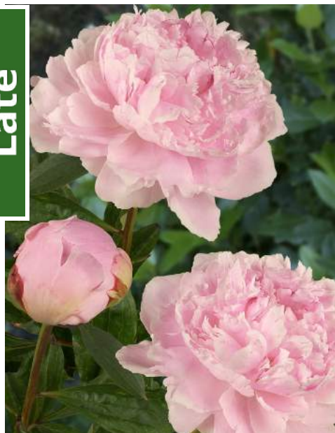
Sarah Bernhardt (1906)