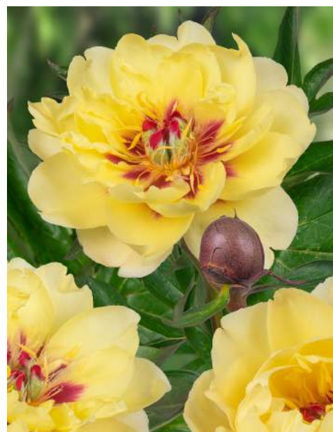
itoh Yellow Waterlily (1999) Mid.