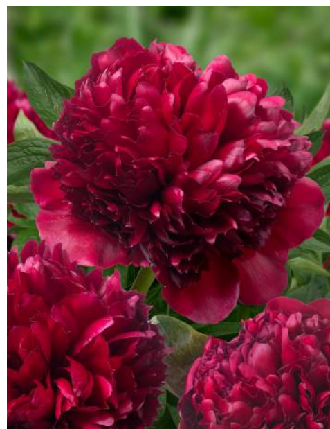
Red Grace (1980)