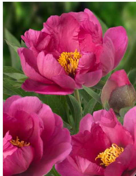
itoh Pink Ardour (1995) Mid.