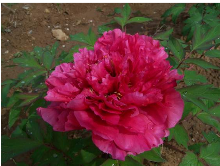
Suffruticosa Melody