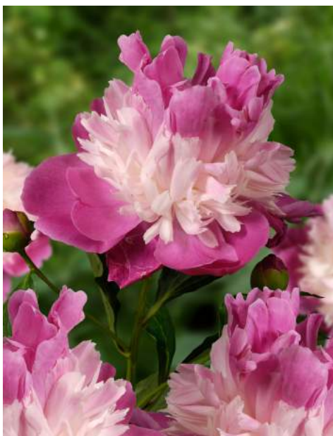
Gay Paree (1933)