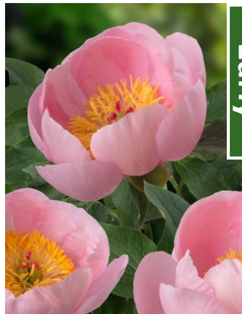
Soft Salmon Saucer (1981)