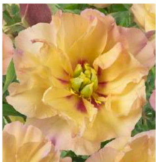
Itoh Canary Brilliant