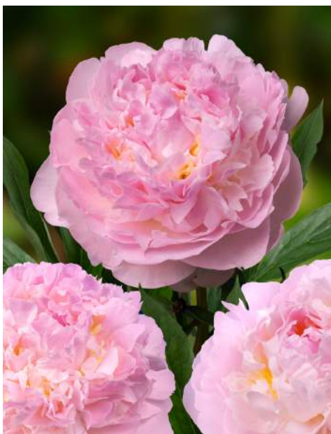
Blush Queen (1949)