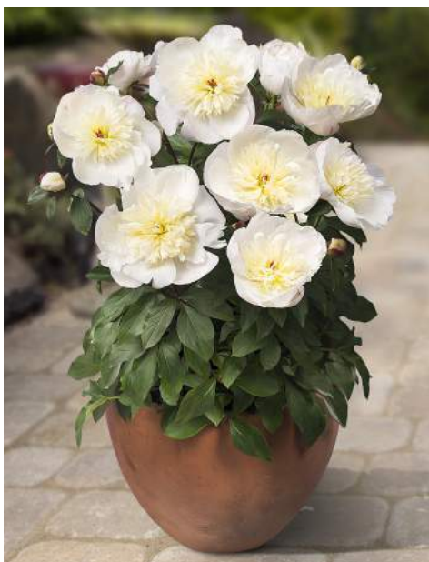
Patio Peony™ Madrid Late