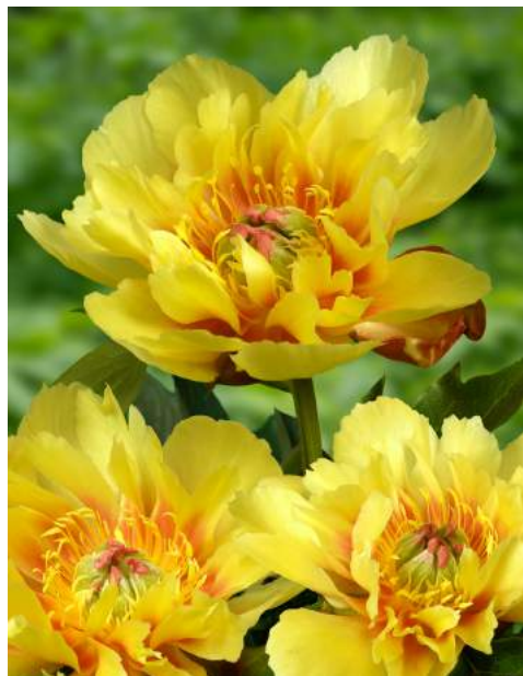
itoh Border Charm (1984)