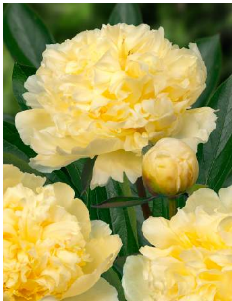
Goldilocks (1975) Mid. | Garden