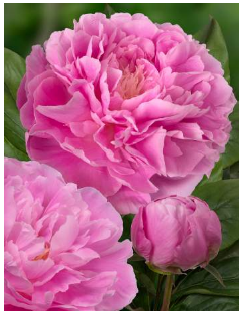
Silver Daubed (1977)