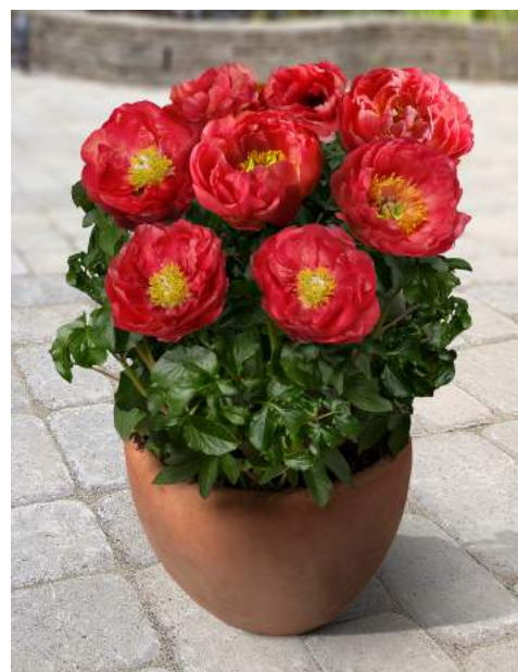
Patio Peony™ Moscow Early - mid.