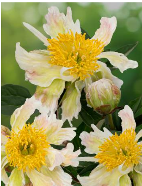
Green Lotus (1995)