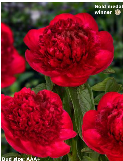
Red Charm (1944)