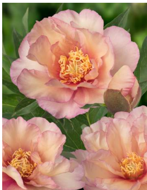
itoh Scrumdiddleumptious (2002) Very early