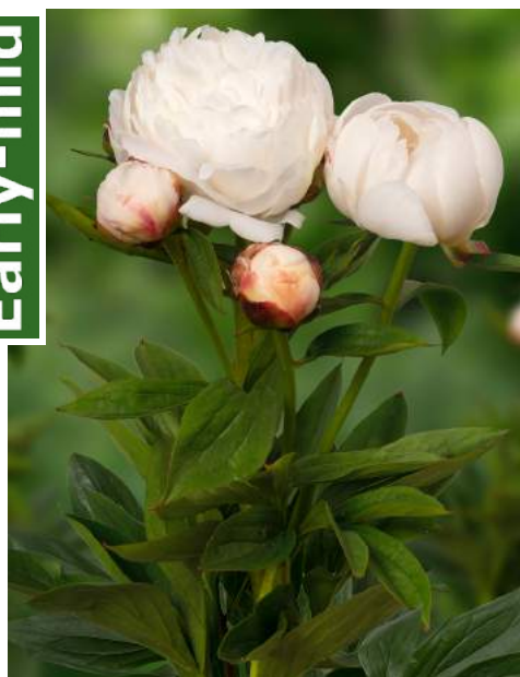
Allan Rogers (2008)