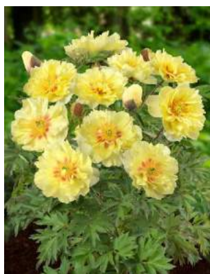
Paeonia itoh Bartzella