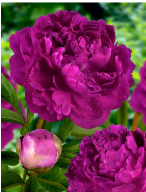
Victoire de la Marne (1915)