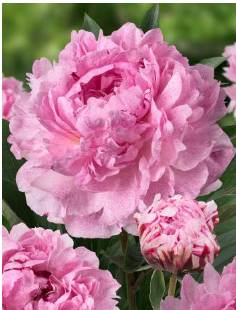
Sarah Bernhardt Unique