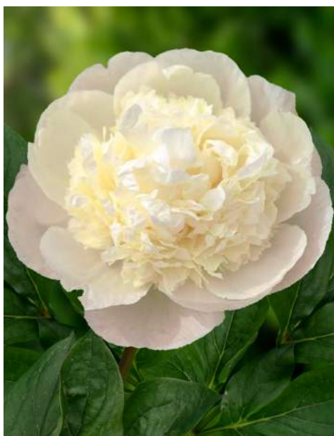
Princess Bride (1988)