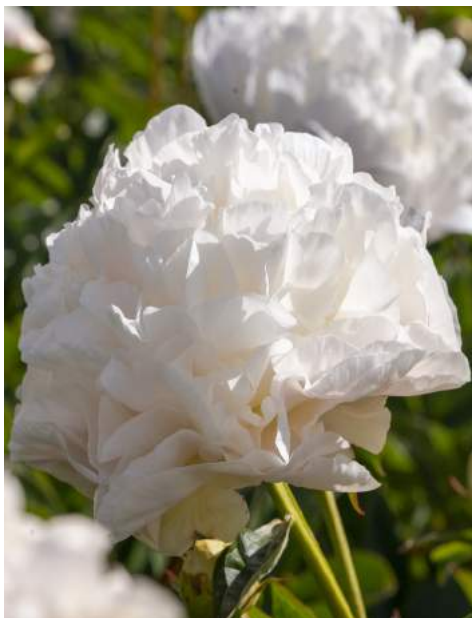
Moonlit Snow (1978)