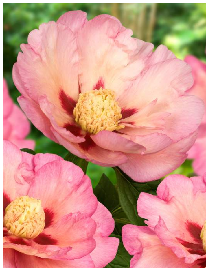
itoh Pastel Splendor (1996)