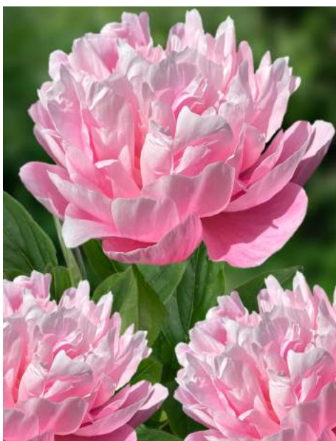
Pink Parfait (1975)