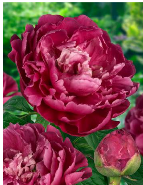
Louis van Houtte (1975)