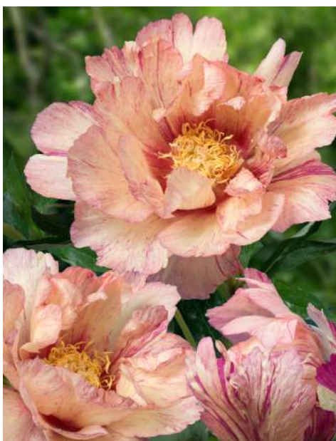
itoh Lollipop (1999)