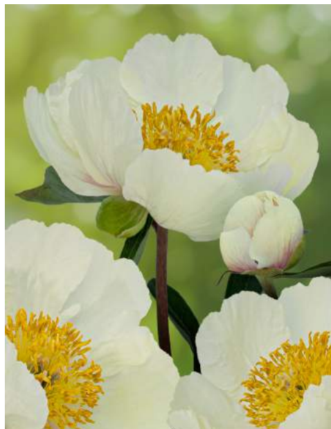
Claire de Lune (1954) Very early