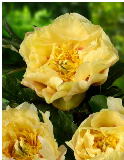
itoh Prairie Charm (1992) Mid.