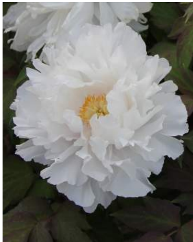
'Suffruticosa Bright Prince'