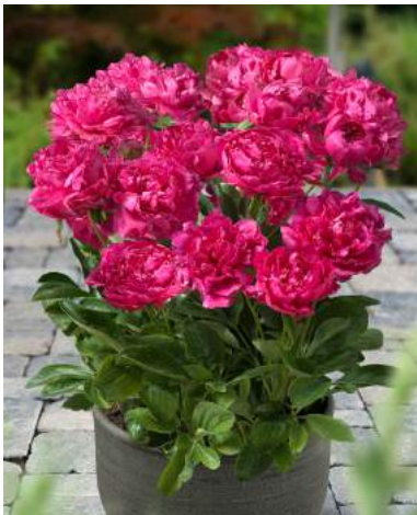
Patio Peony 'London'