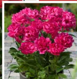
Patio Peony™ London