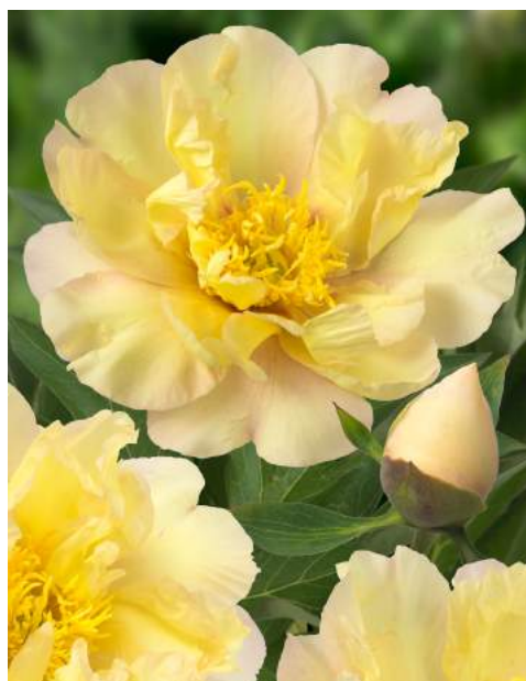
itoh Lemon Dream (1999)