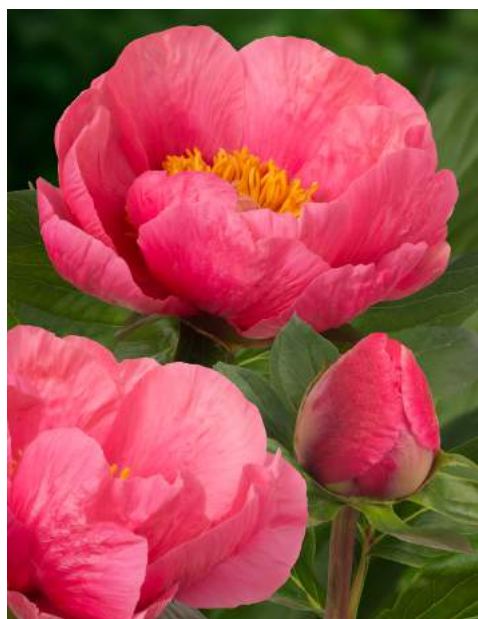
Lovely Rose (1942)