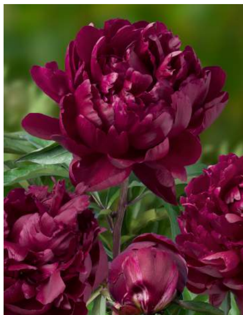
Cherry Hill (1915)