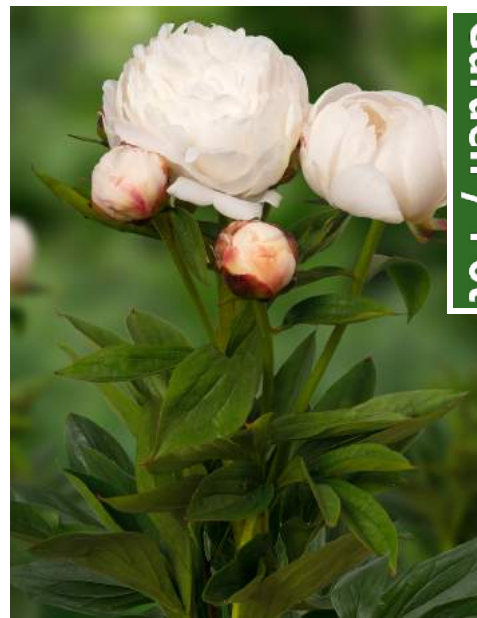
Allan Rogers (2008)