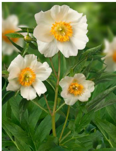
Early Windflower (1939) Very early | Garden