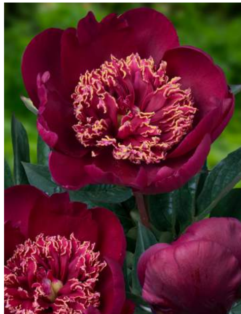
Sword Dance (1933)