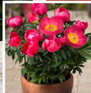
Patio Peony™ Oslo