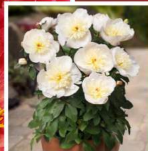
Patio Peony™ Madrid