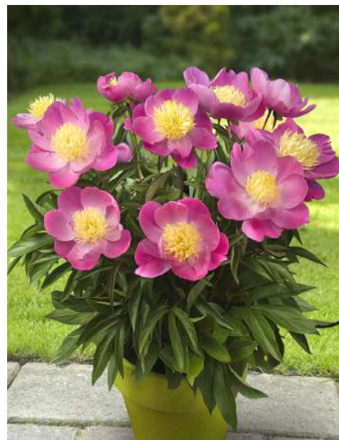
Patio Peony™ Kiev Mid.