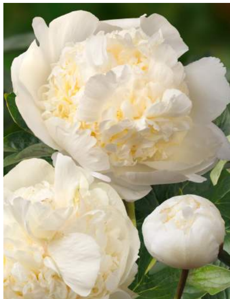
Bridal Shower (1959)