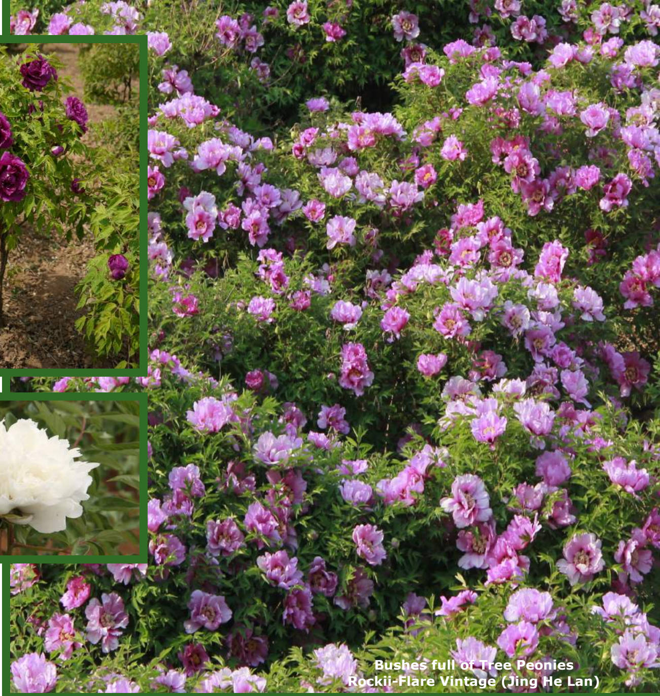
Bushes full of Tree Peonies Rockii-Flare Vintage (Jing He Lan)