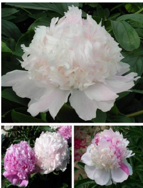
Mister Ed (1980)