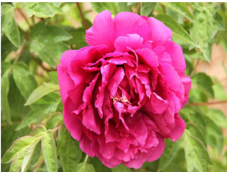
Rockii-Flare Penny Lane (Jing Di Hong)