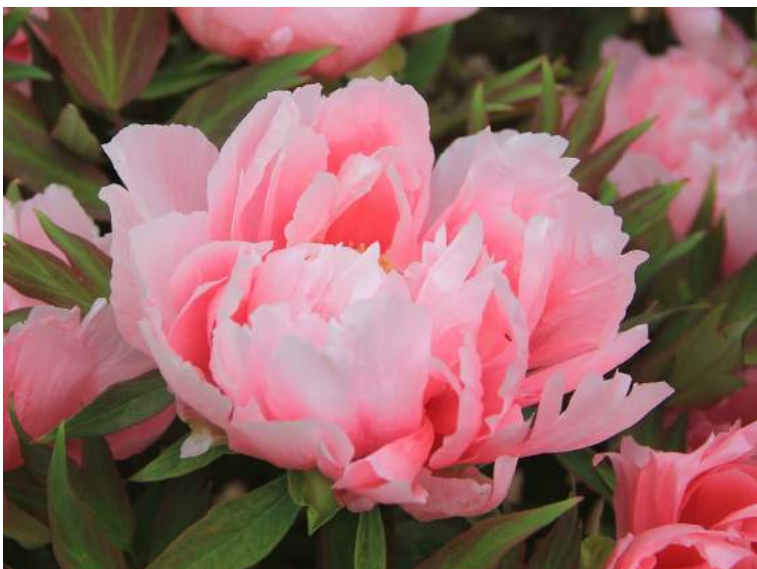
Suffruticosa Celebration (Ba Qian Dai Chun)