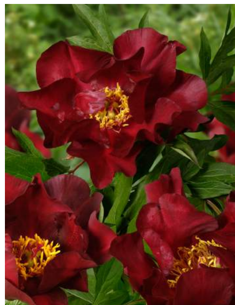
itoh Scarlet Heaven (1999) Early - mid.