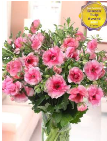
Ranunculus Butterfly™ Hera®