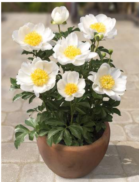
Patio Peony™ Dublin Late