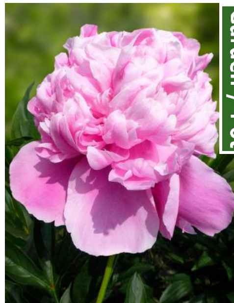
Lady Anna (1856)