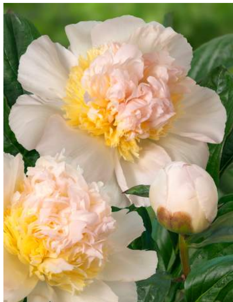
Honey Gold (<1976)