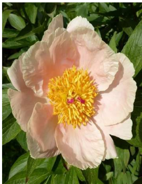
Apricot Whisper (1999)