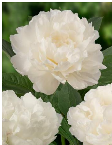
Fringed Ivory (1989)