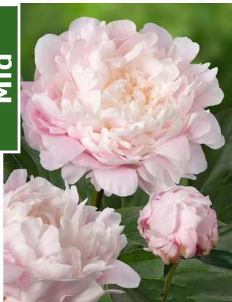
Moon River (1972)