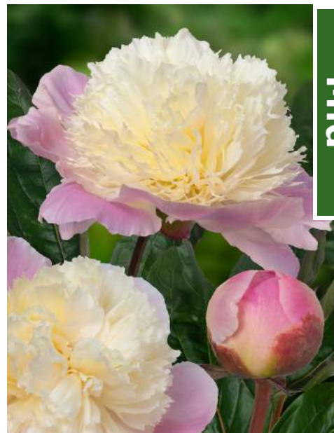
Touch of Class (1999)