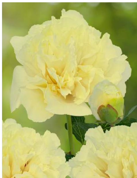
Vanilla Schnapps (2013)