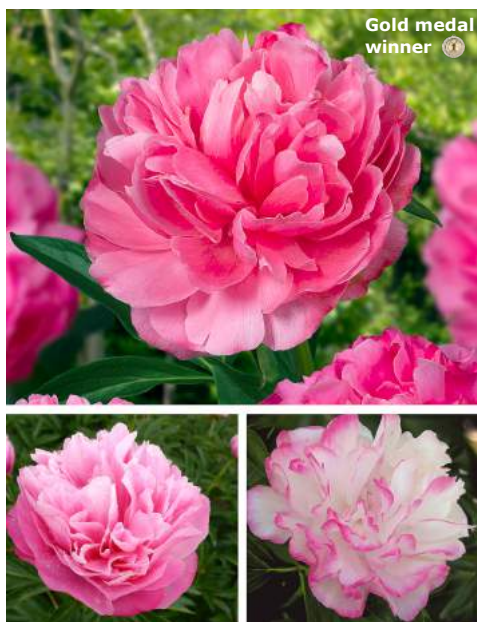
Joker (2004) Early | Garden