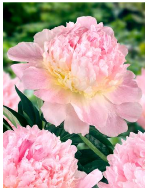
Raspberry Sundae (1968)