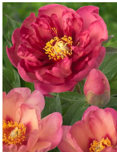
itoh Magical Mystery Tour (2002)