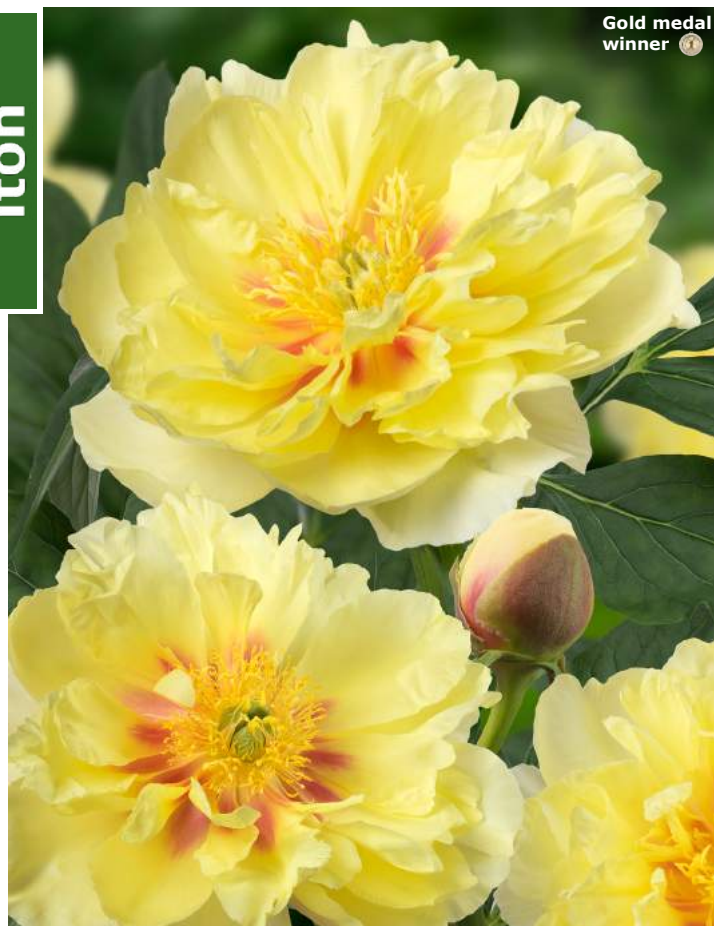
itoh Bartzella (1986)