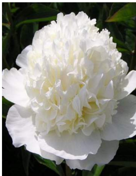
Lancaster Imp. (1987)