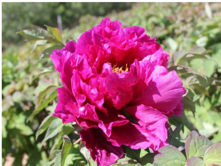
Suffruticosa Glamour (Dao Da Chen)