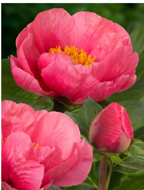
Lovely Rose (1942)